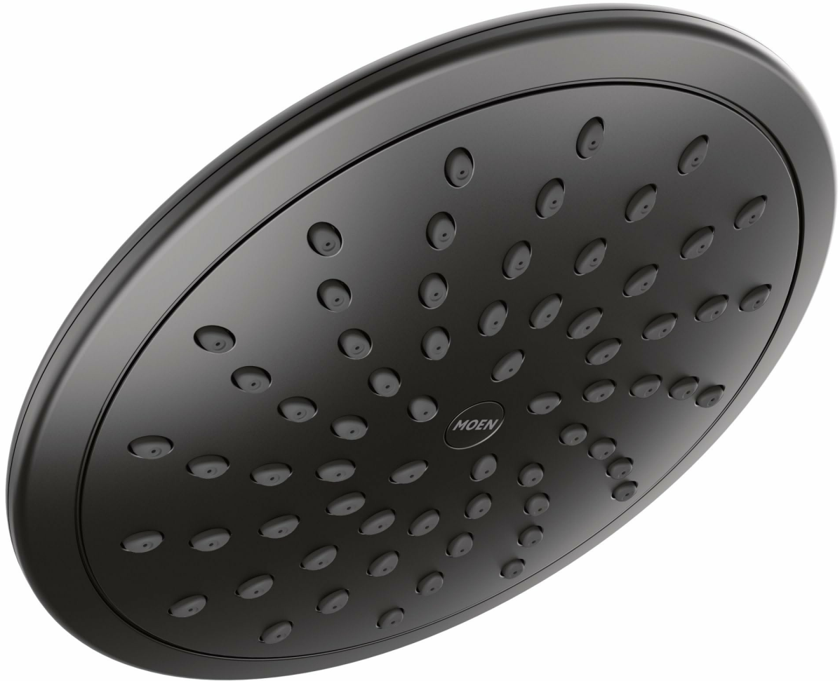
Figure 1: Moen 6345BL Matte Black 8-Inch Fixed Rainshower