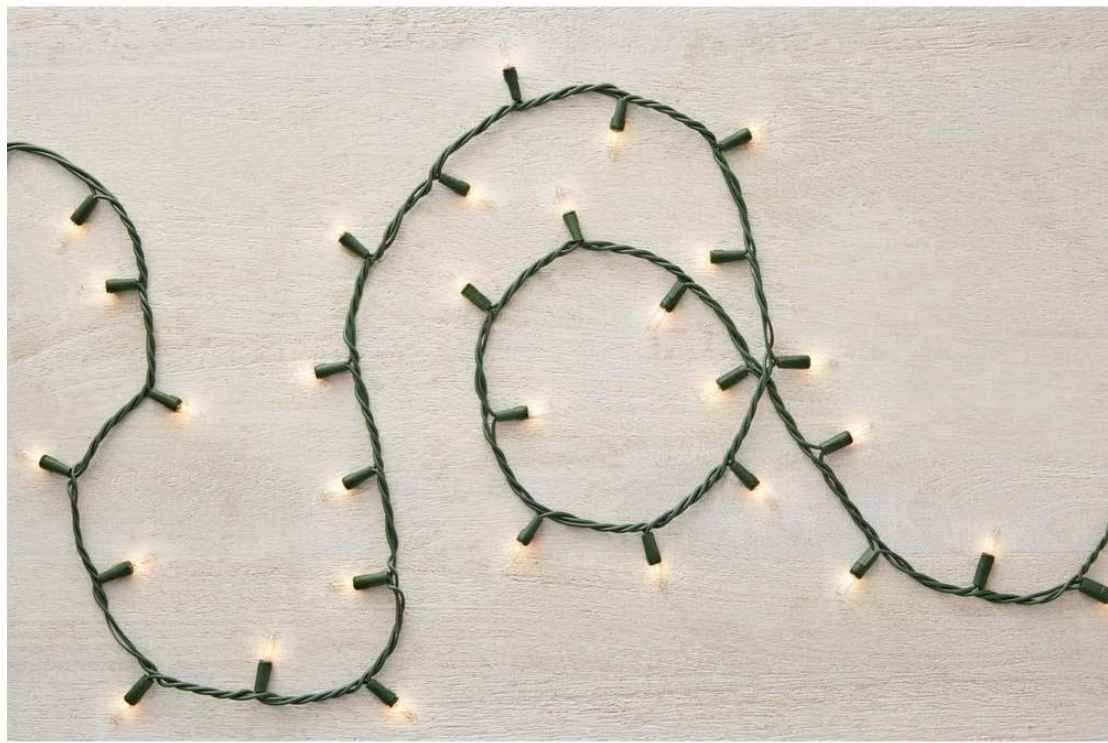
Image: The string of clear mini incandescent lights with green wire is shown laid out, illustrating its length and bulb spacing for setup.