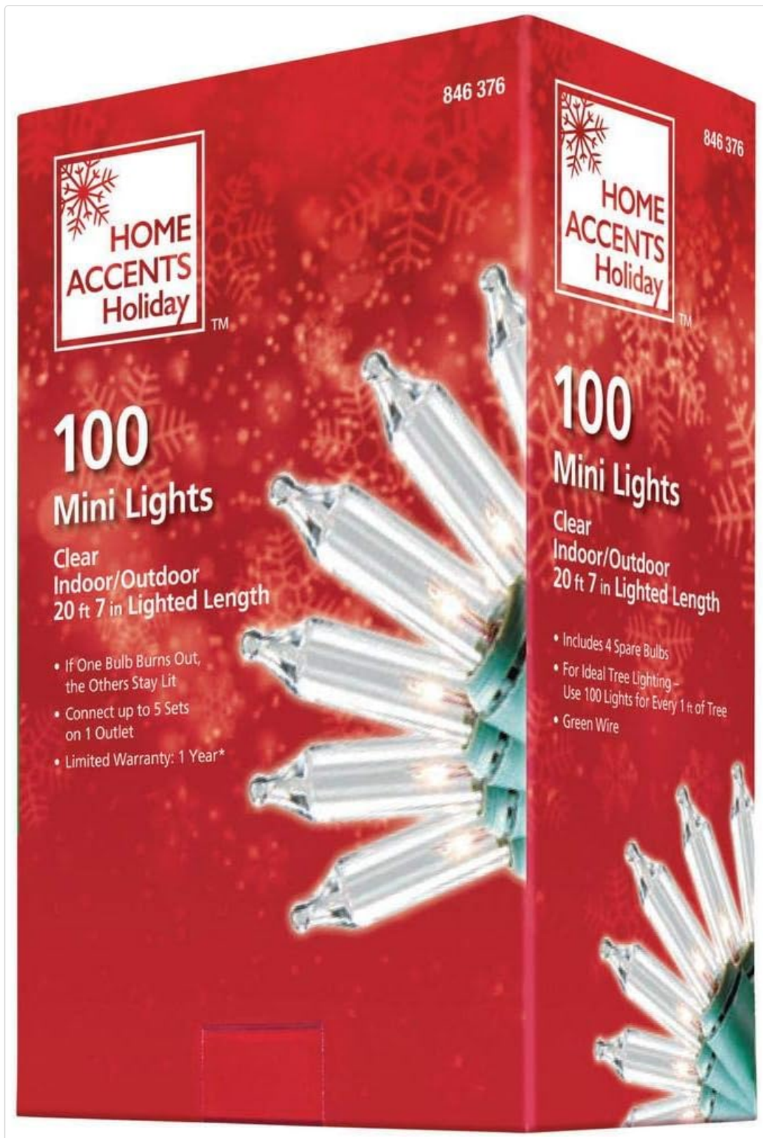
Image: The product box displays key features and contents, including the 100 clear mini lights and green cord.