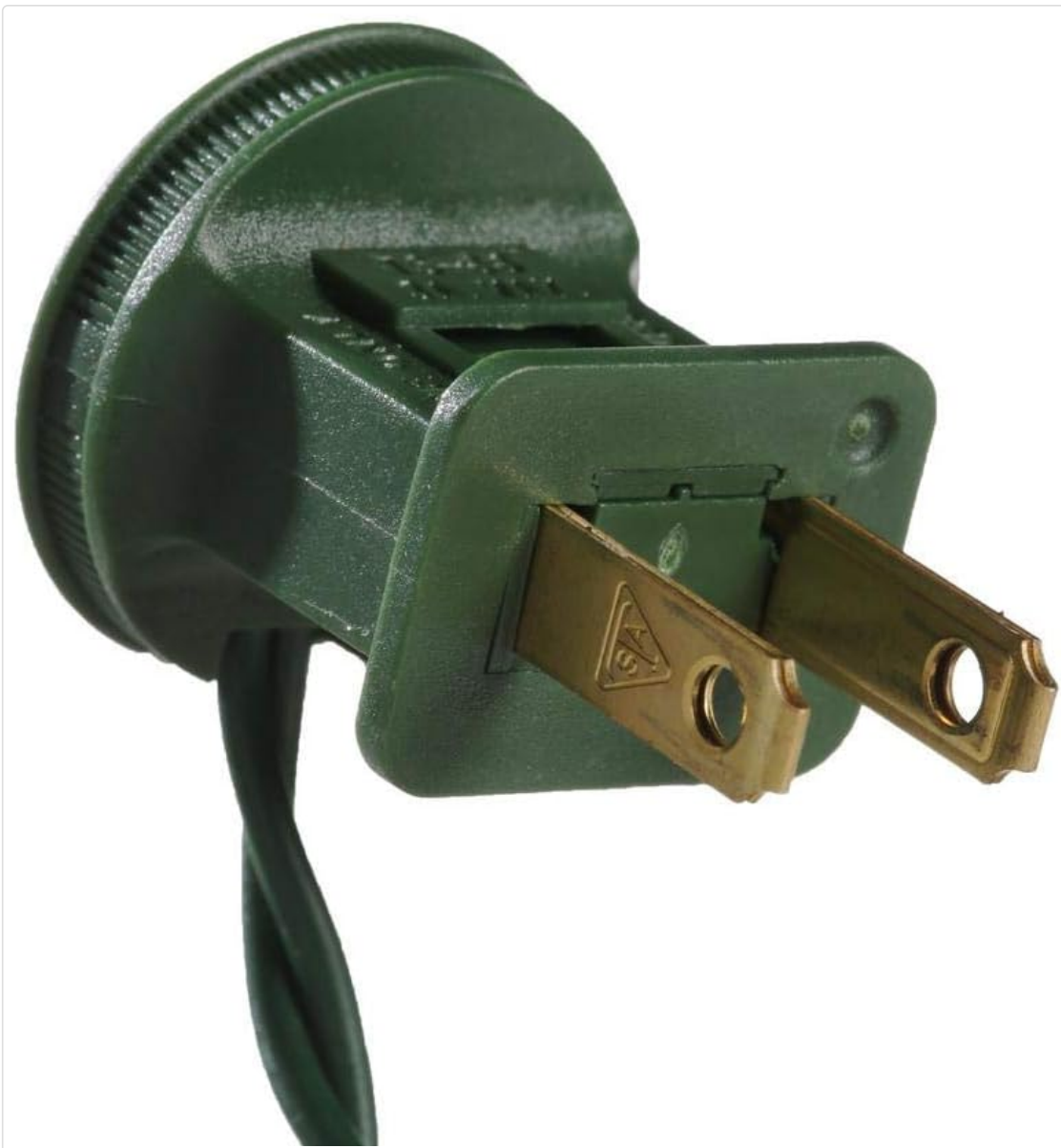
Image: The green electrical plug, designed for standard outlets, ensures safe power connection for the light set.