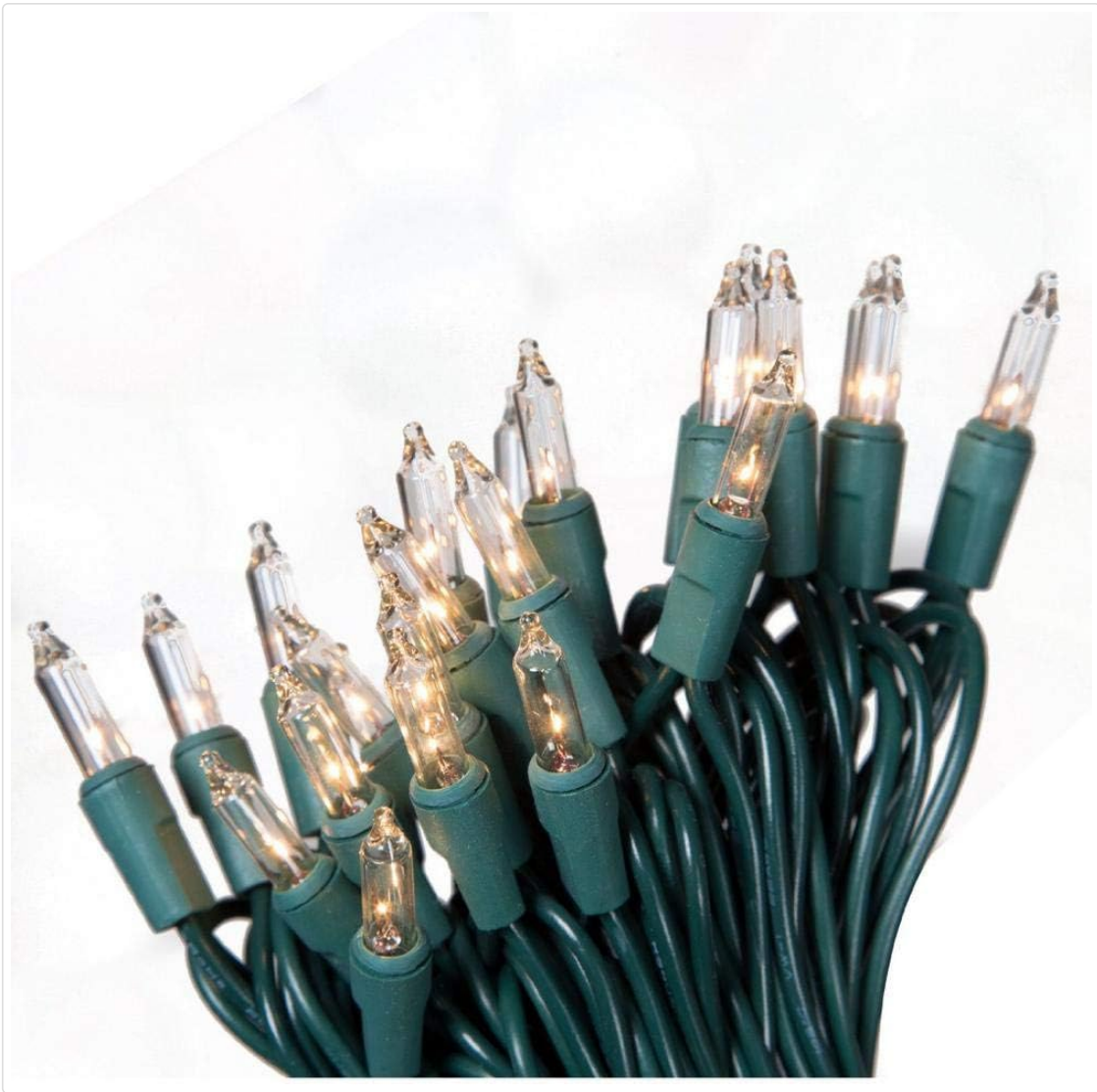
Image: A close-up view of several illuminated clear mini incandescent bulbs on a green wire, demonstrating their warm glow during operation.