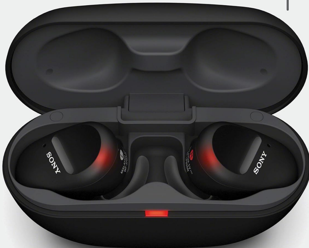
Image: The contents of the product box, including the earbuds, charging case, USB Type-C cable, and different sizes of earbud tips and arc supporters.

Up to 13 hours, up to 26 hours with charging case.