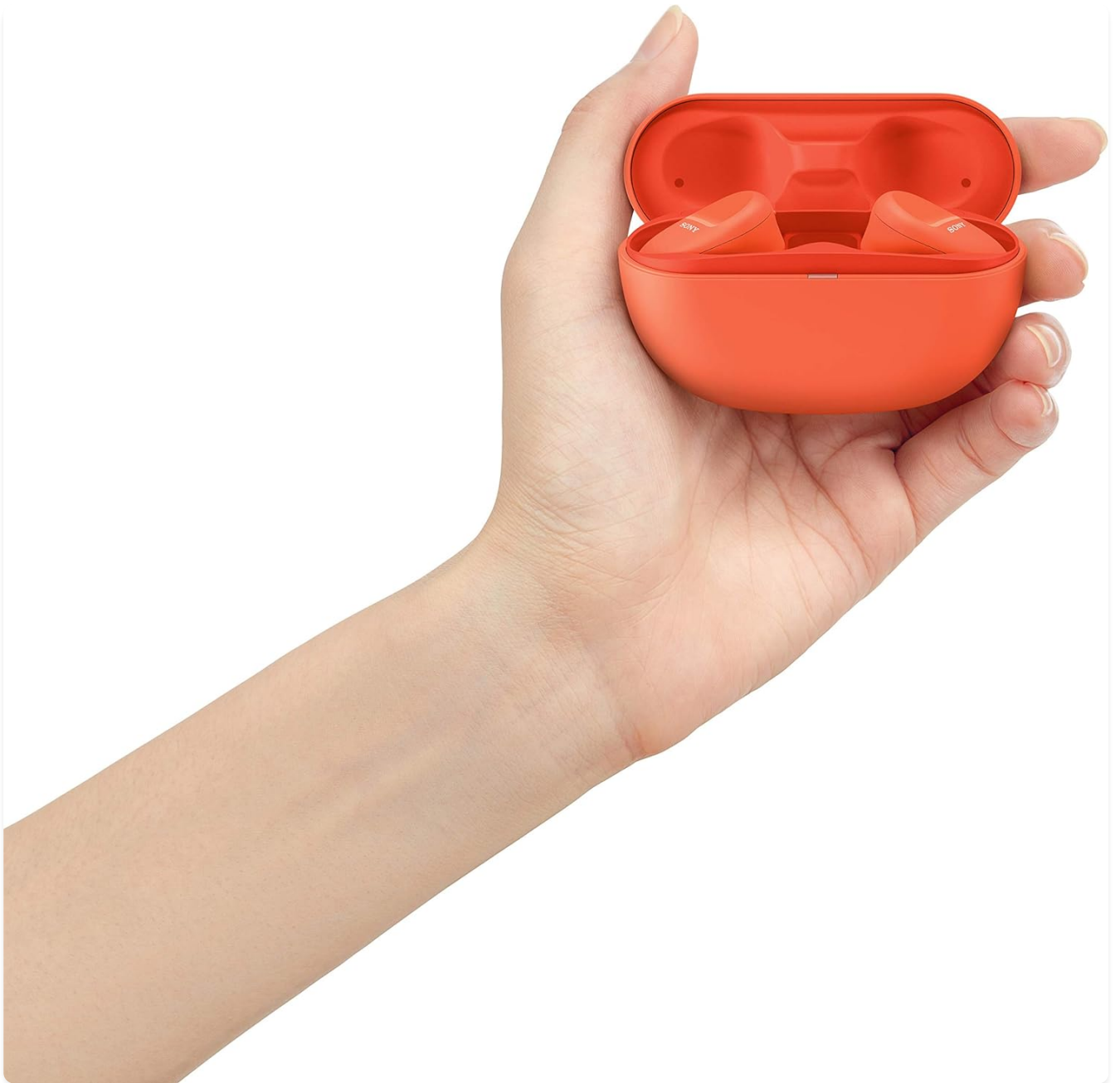
Image: A hand holding the compact charging case, which provides additional battery life for the earbuds and ensures they are ready for extended use.