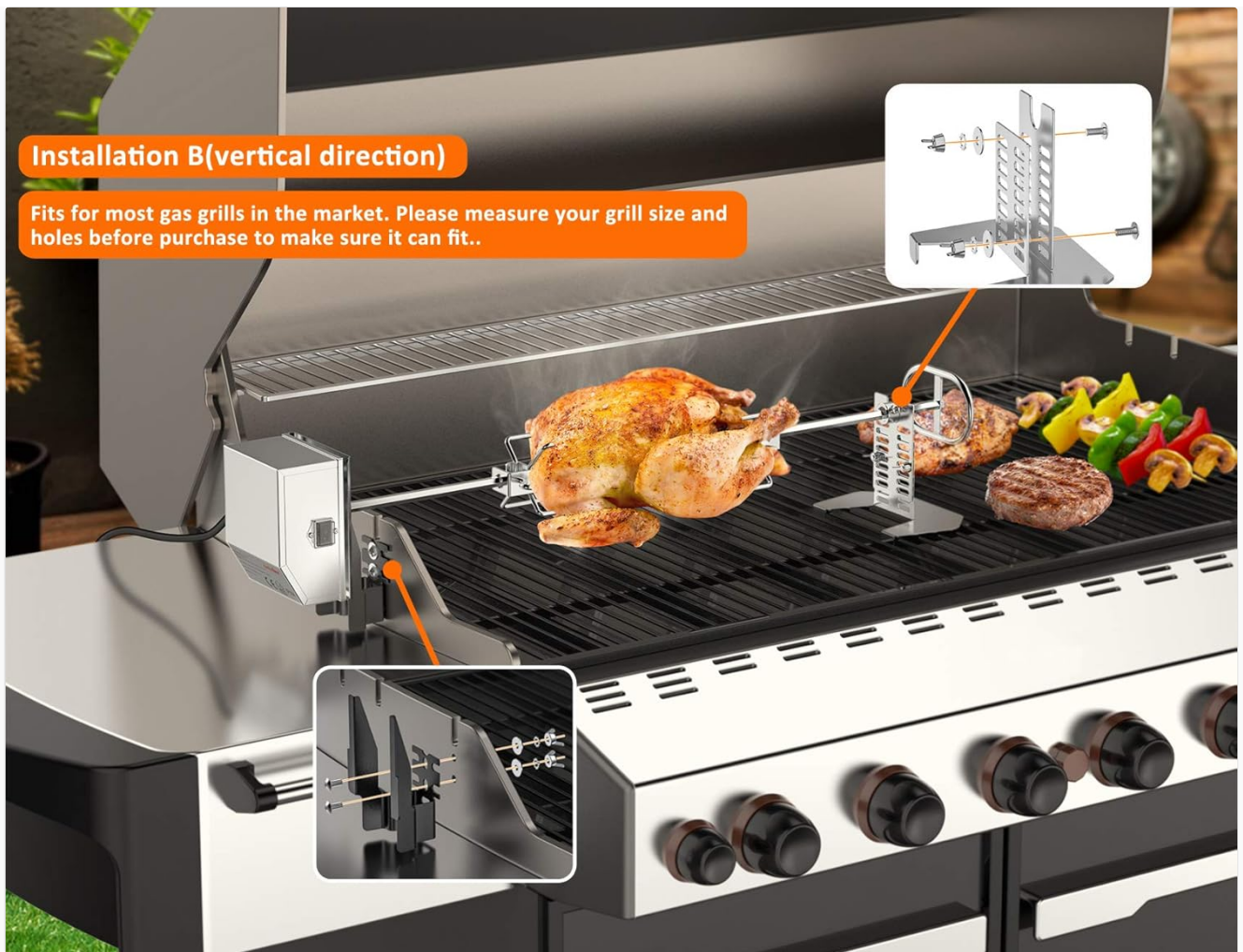
Figure 3: Installation Method B, demonstrating setup for grills with vertical or horizontal bracket holes.