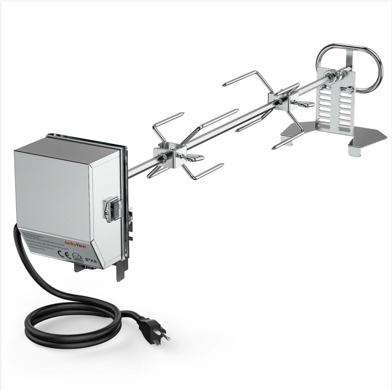
Figure 1: All components included in the onlyfire Stainless Steel Rotisserie Kit.