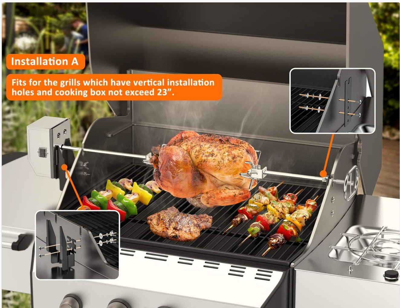
Figure 2: Installation Method A, showing the motor bracket attached to a grill with vertical holes.