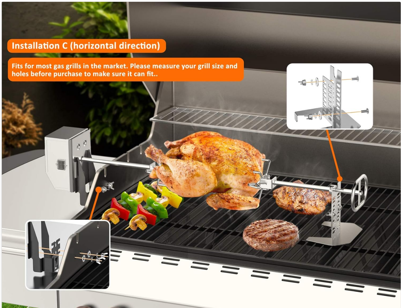
Figure 4: Installation Method C, showing the setup for horizontal bracket holes.