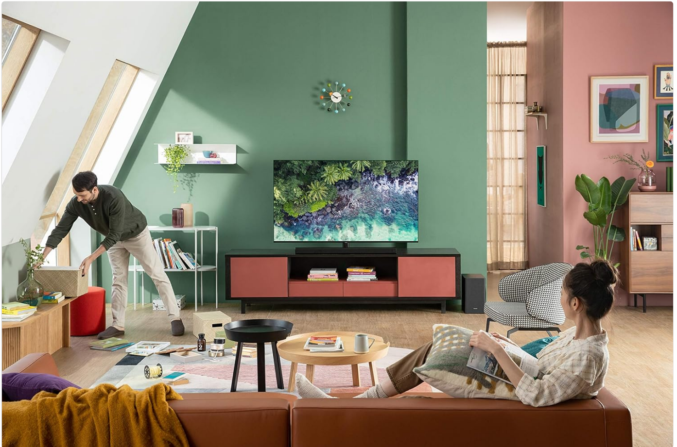
Figure 2: The Samsung Smart TV seamlessly integrated into a modern living room environment, demonstrating its aesthetic appeal.