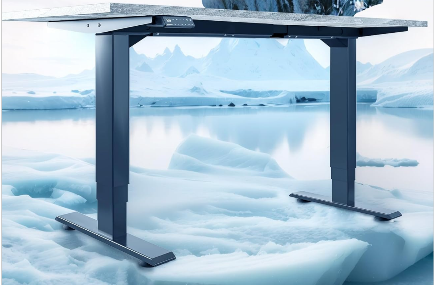
Image: Illustration highlighting the powerful dual motor system of the MAIDeSITE T2 Pro Plus, emphasizing its two motors, faster adjustment speed of 40mm/s, and quiet operation at less than 45dB.