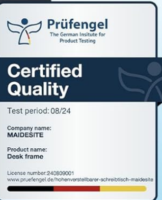
Image: Illustration highlighting the superior craftsmanship of the MAIDeSITe T2 Pro Plus, featuring a triangle stable structure and certified quality (TÜV Rheinland, UKCA). This image emphasizes the structural integrity and quality standards.