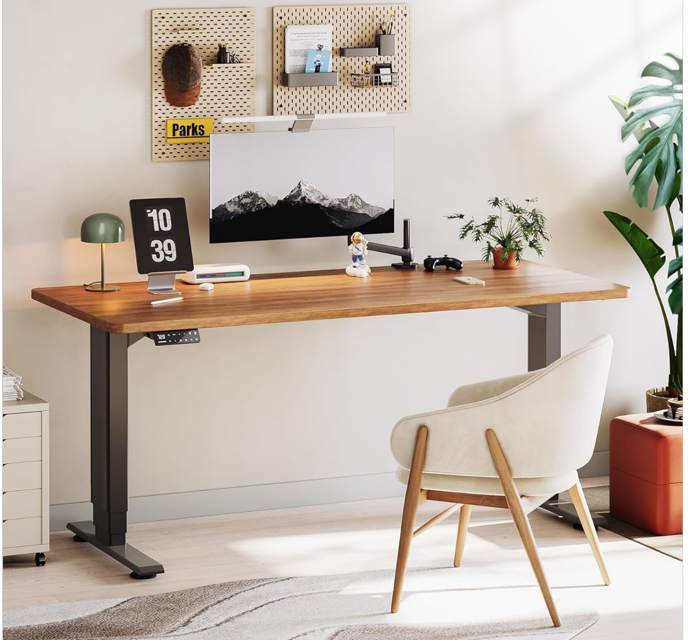
Image: A fully assembled MAIDeSITE T2 Pro Plus desk frame with a wooden desktop attached, ready for use. This shows the complete product setup.