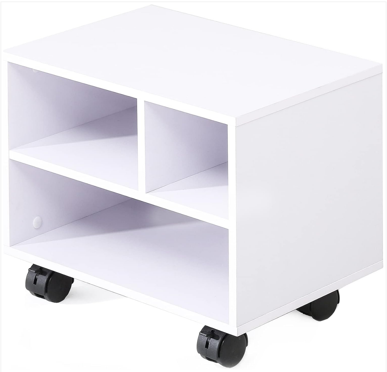
Figure 1: The FITUEYES Under Desk Printer Stand in white, showcasing its compact design and storage capabilities.