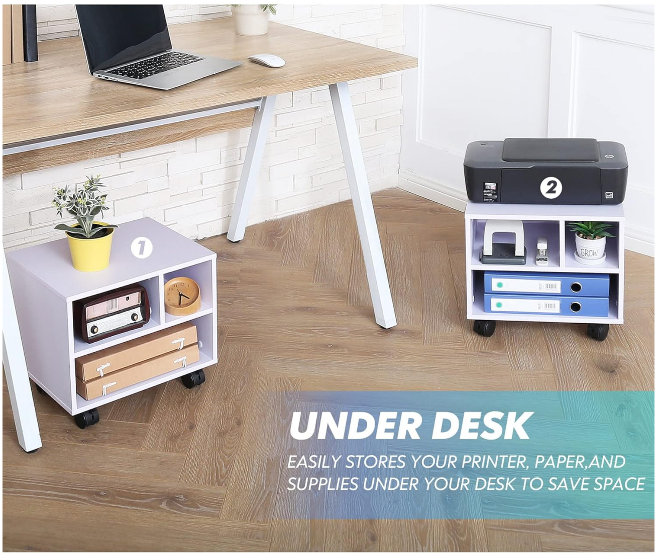
Figure 5: The printer stand neatly tucked under a desk, illustrating how it helps save space in a home or office setup.