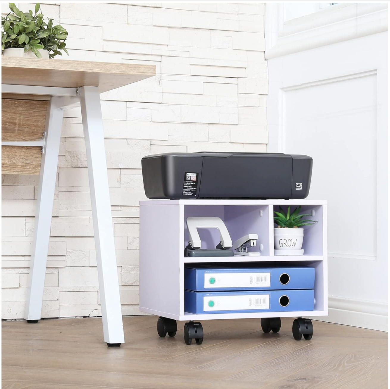
Figure 6: A printer placed on the stand, which is located under a desk, demonstrating that the printer remains fully functional and accessible even when stored beneath the desk.