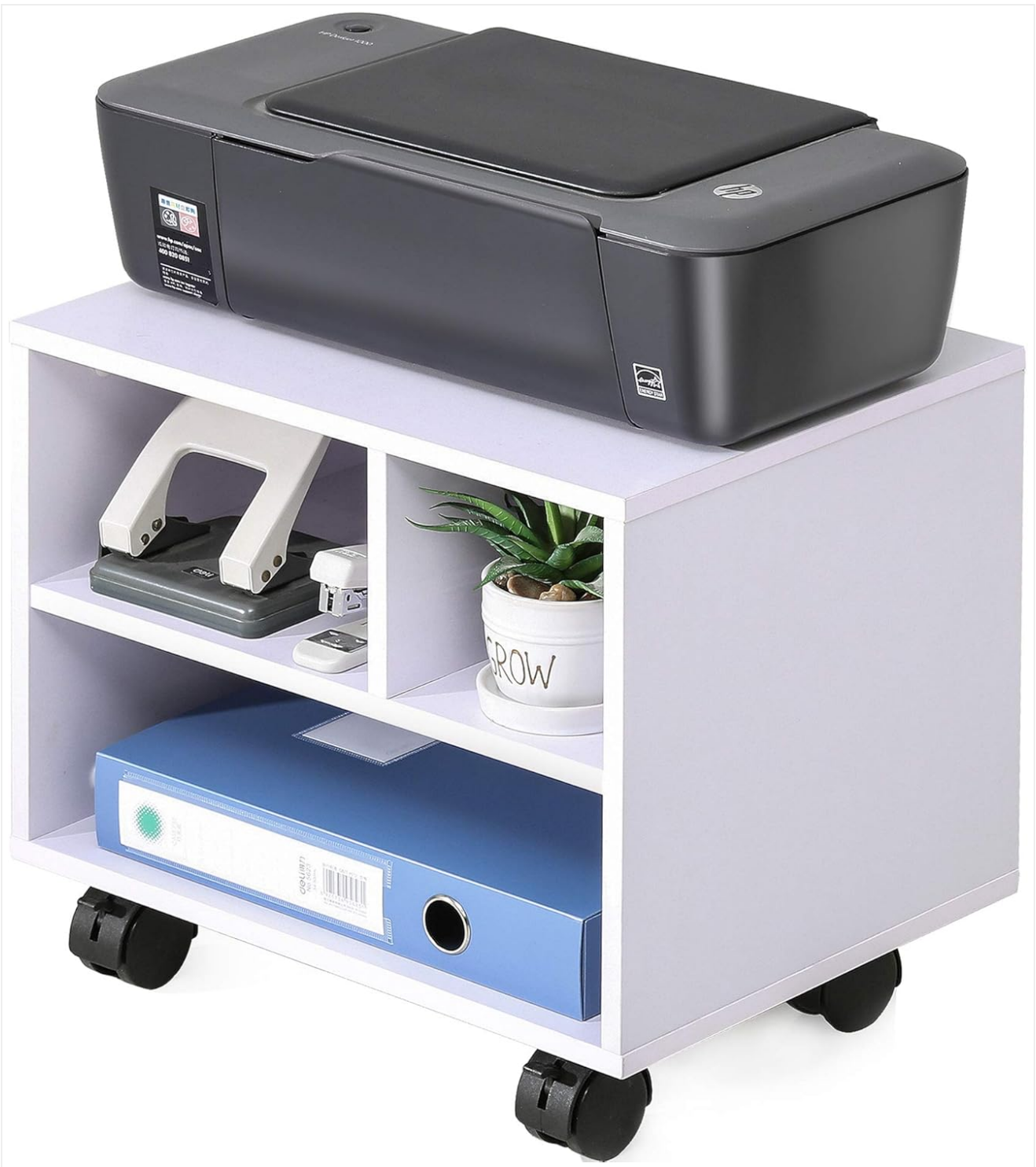
Figure 2: The printer stand in use, holding a printer on its top surface and various office supplies such as a hole punch, stapler, and binders in its three compartments.