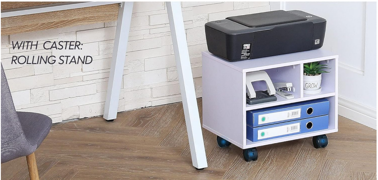
Figure 3: Illustration demonstrating the dual functionality of the stand, usable as a static desktop organizer or a mobile rolling cart by attaching or detaching the casters.