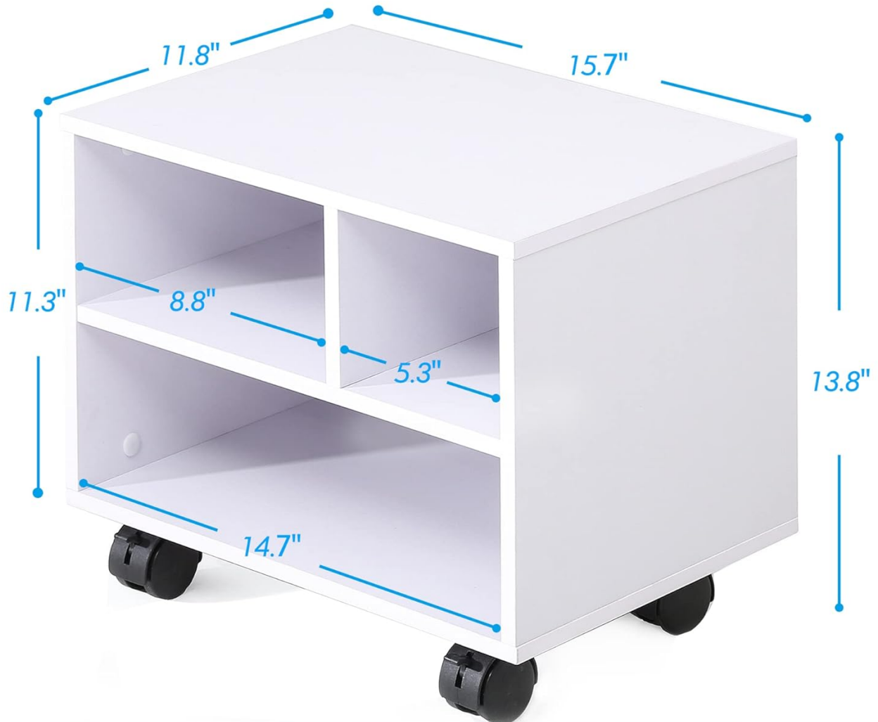
Figure 7: Detailed dimensions of the printer stand, including measurements for each compartment.