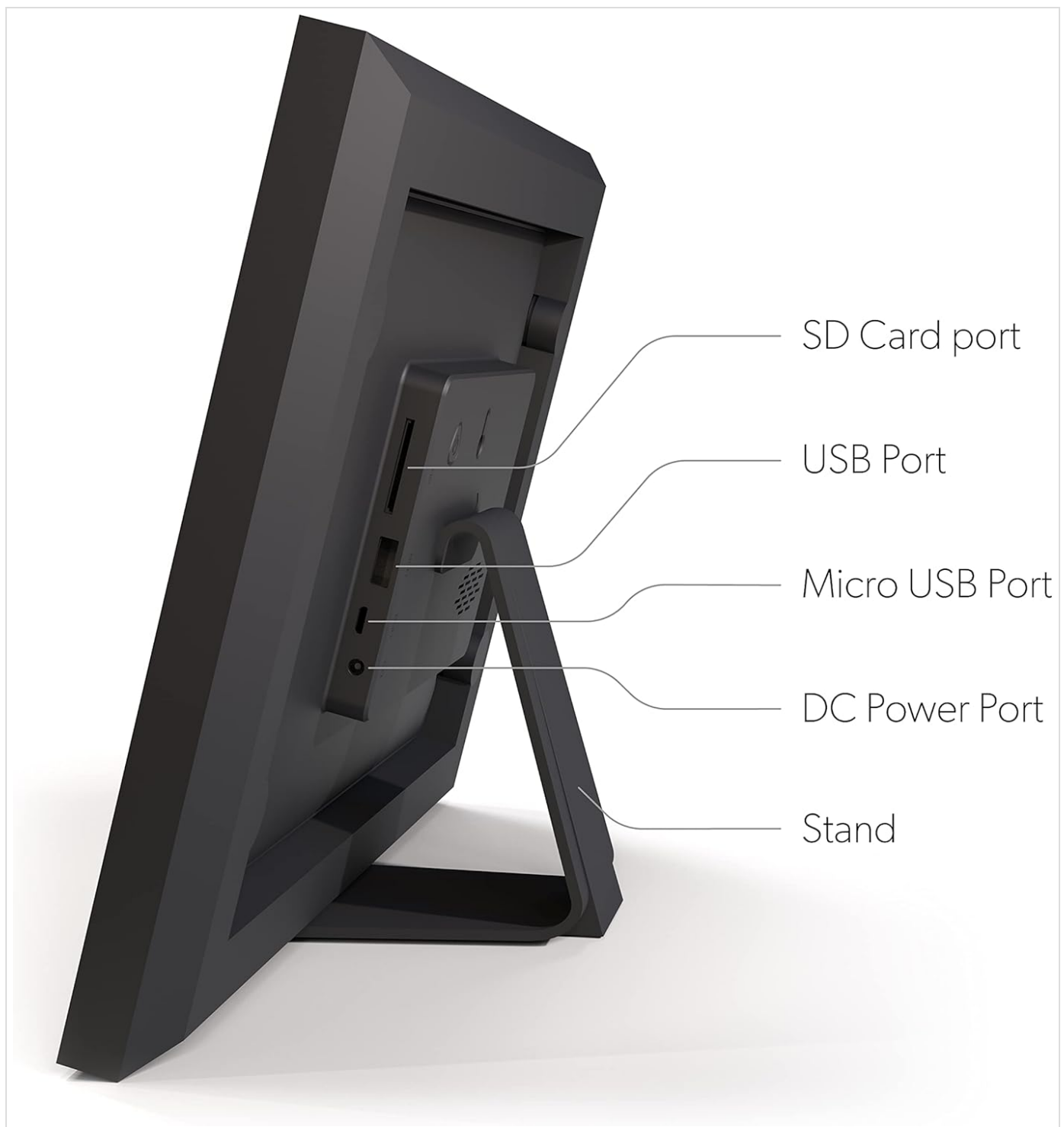
Side view of the frame, indicating the various ports for connectivity and the integrated stand.