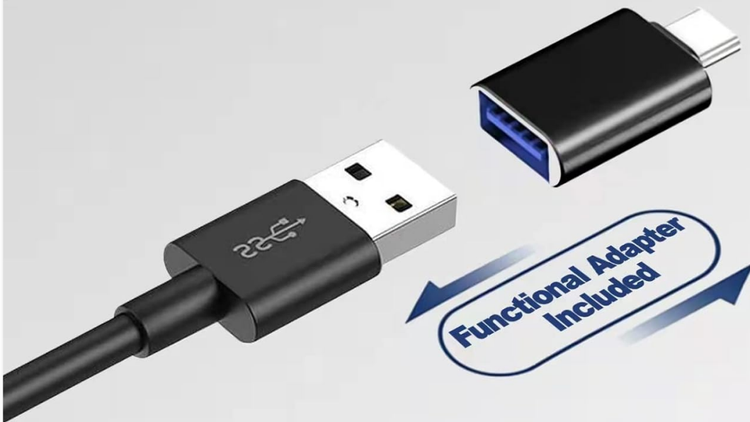
Image: A close-up of the USB-C to USB adapter, highlighting its inclusion for versatile connectivity.

For those computers Pad and mobile phones with only type-c interface, we specially prepared USB C to USB Adapter