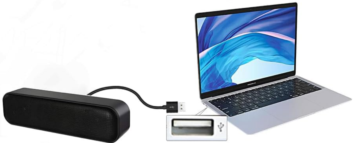
Image: Visual instructions demonstrating the three-step plug-and-play process: plug into USB, click speaker icon, select 'Speaker (Audio USB 2.0)'.

Select "Speaker(Audio USB 2.0)" as your computer playback device.