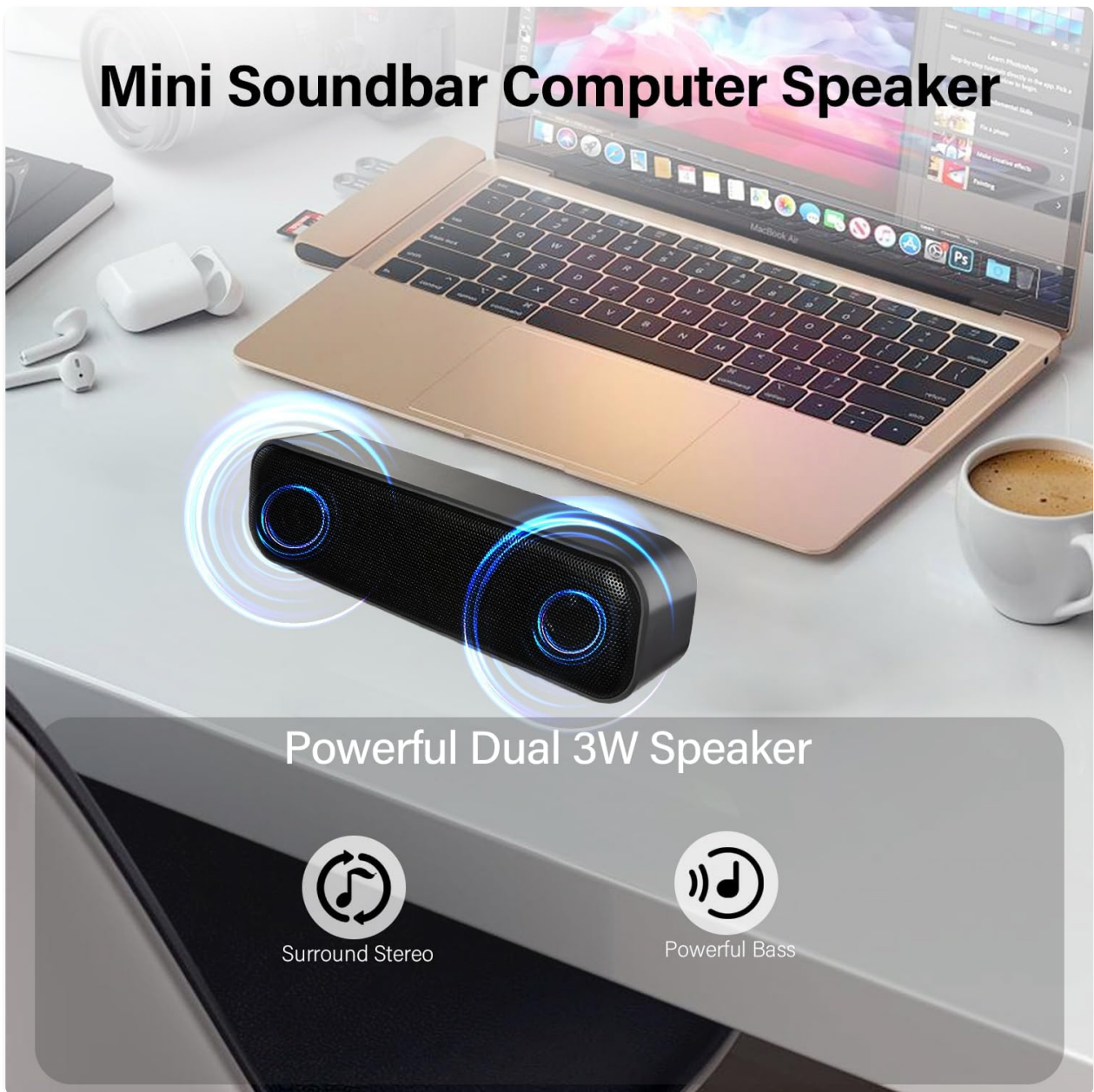
Image: The mini soundbar positioned on a desk next to a laptop, with visual effects indicating powerful dual 3W speakers, surround stereo, and powerful bass.