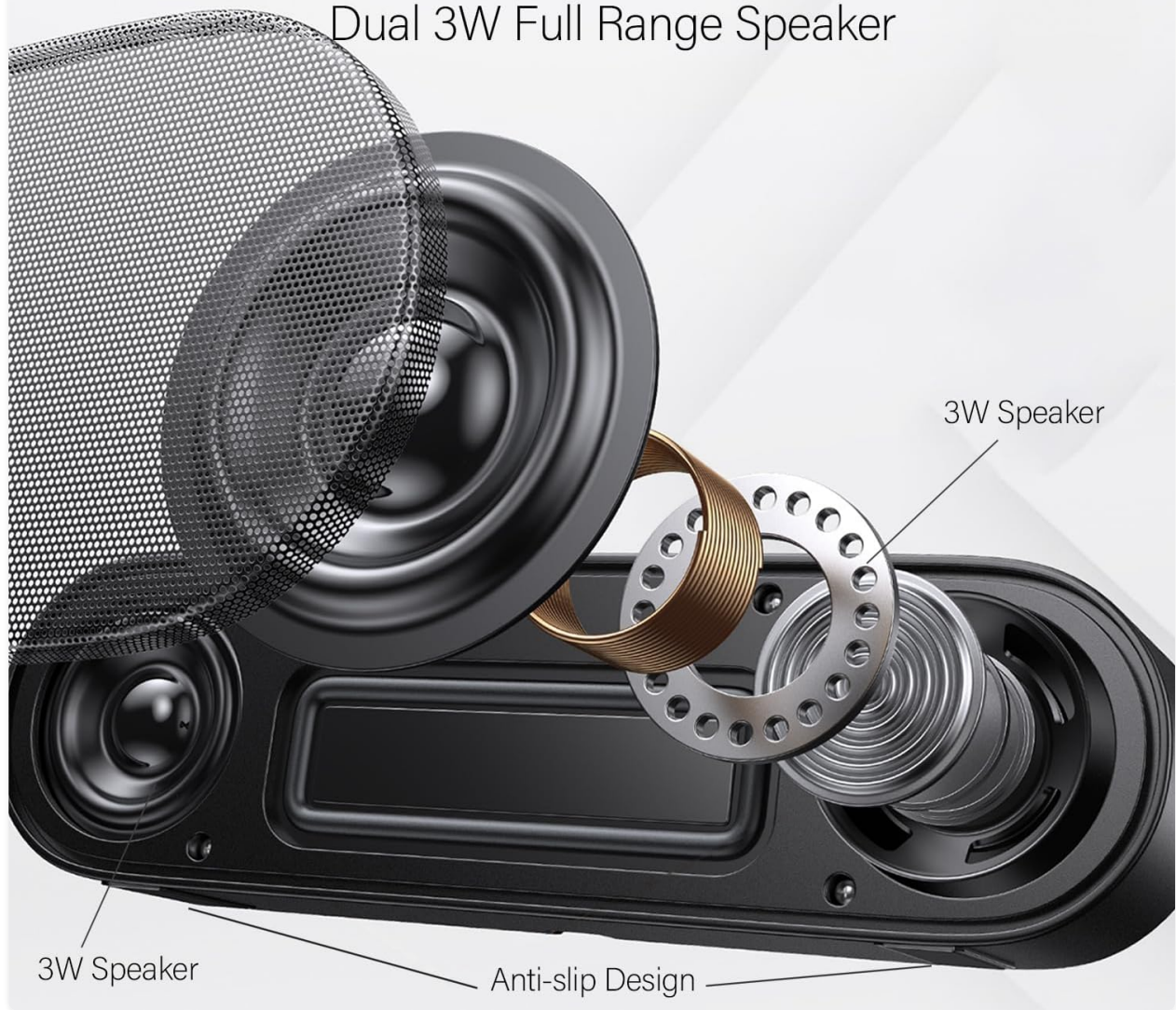
Image: An exploded view diagram of the speaker's internal components, highlighting the dual 3W speakers and anti-slip design for powerful and clear sound.