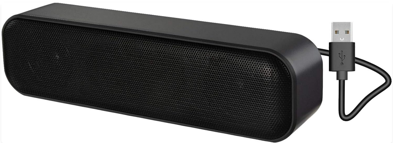
Image: The ZETIY USB Powered Computer Speaker, a sleek black soundbar with its attached USB cable.

Thank you for choosing the ZETIY USB Powered Computer Speaker. This portable mini soundbar is designed to provide high-quality audio for your desktop, Windows PC, or Mac with simple plug-and-play functionality. It features dual 3W high-excursion speakers for clear and powerful sound, and includes a USB-C to USB adapter for broad compatibility.