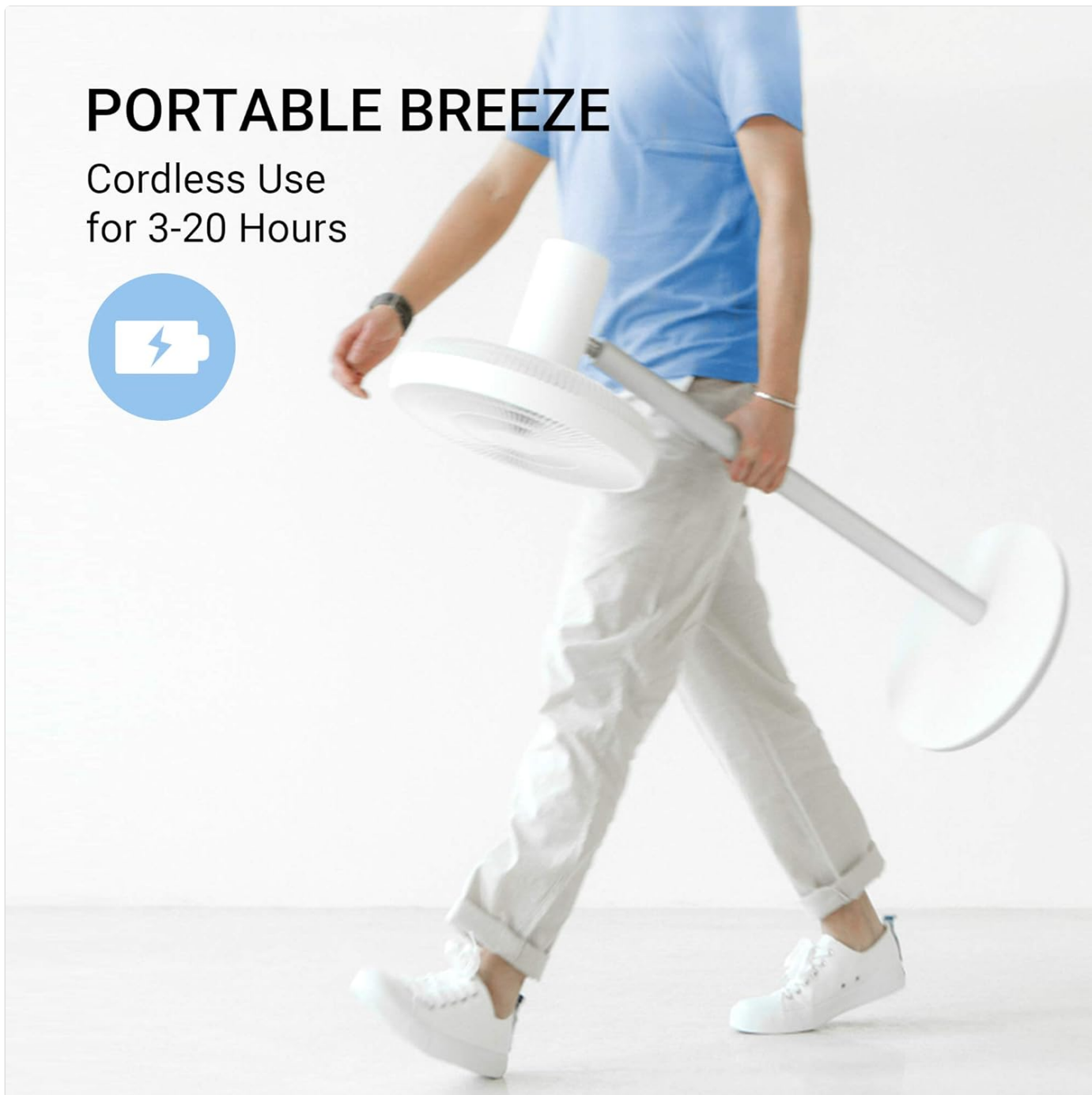
Figure 5: The fan's portable design for cordless use.