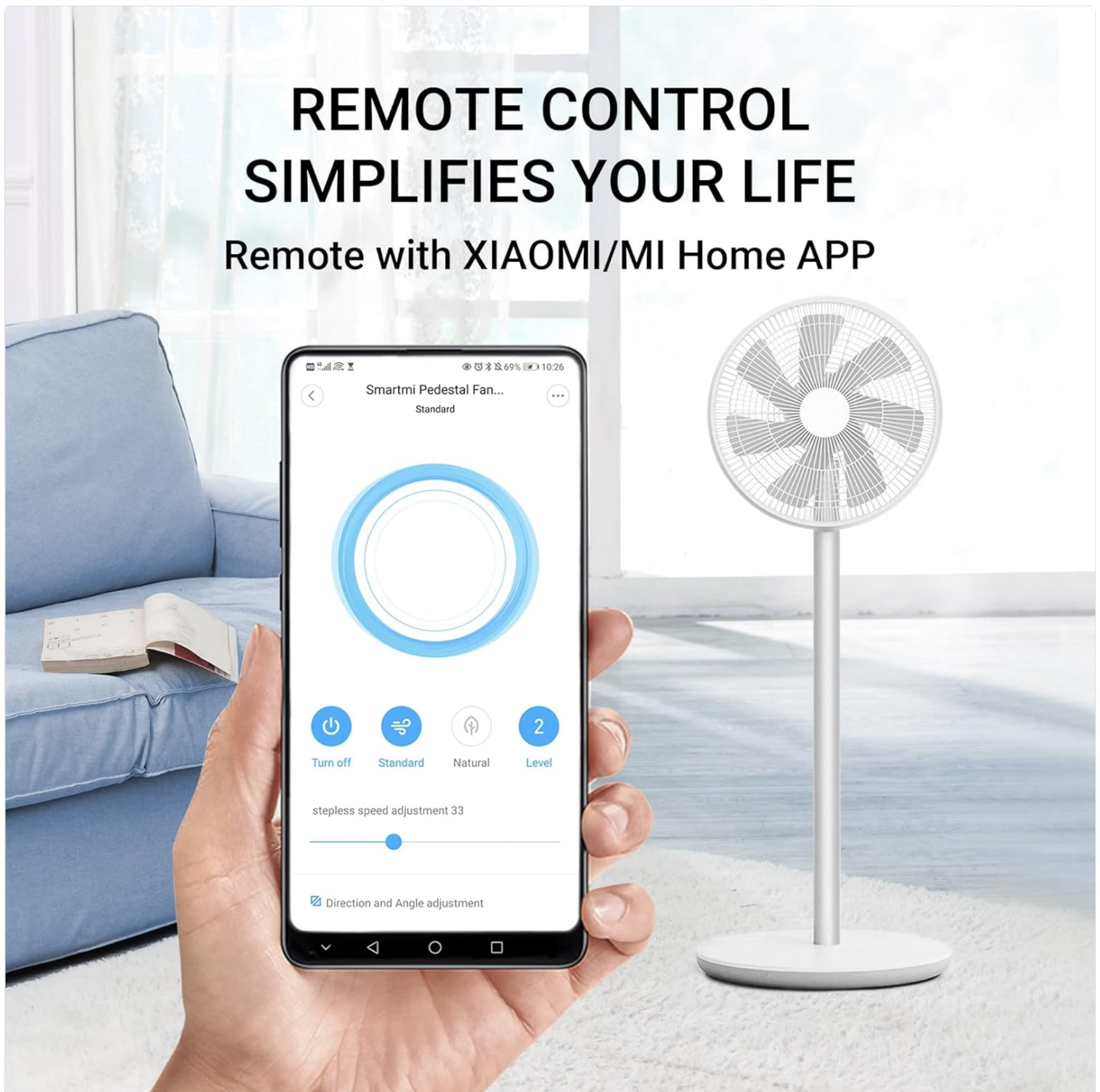
Figure 3: Controlling the fan via the Mi Home App.