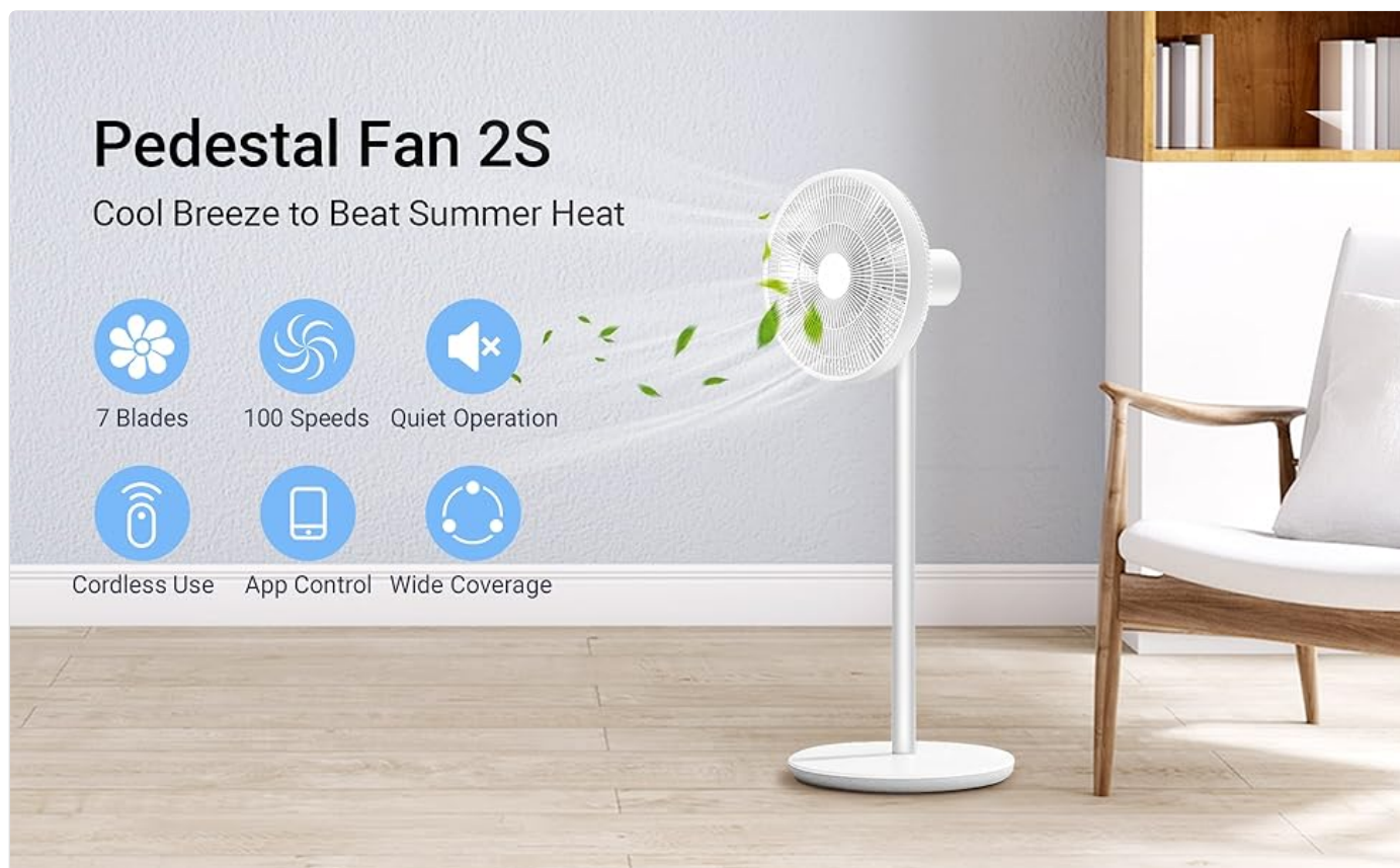
Figure 1: Smartmi Pedestal Fan 2S highlighting key features.

The Smartmi Outdoor Pedestal Fan 2S is designed to provide a natural and comfortable breeze for both indoor and outdoor environments. Featuring a premium DC inverter motor, this fan offers quiet operation, energy efficiency, and a long lifespan. Its cordless design and smart control options enhance user convenience and portability.