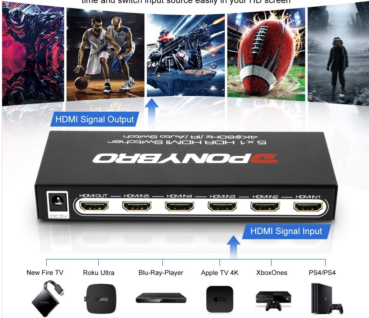
Image: Setup diagram illustrating how to connect various HDMI input devices (New Fire TV, Roku Ultra, Blu-Ray Player, Apple TV 4K, XboxOneS, PS4/PS5) to the PONYBRO HDMI Switch, which then outputs to an HD screen.

connect with 5 HDMI devices at the same time and switch input source easily in your HD screen