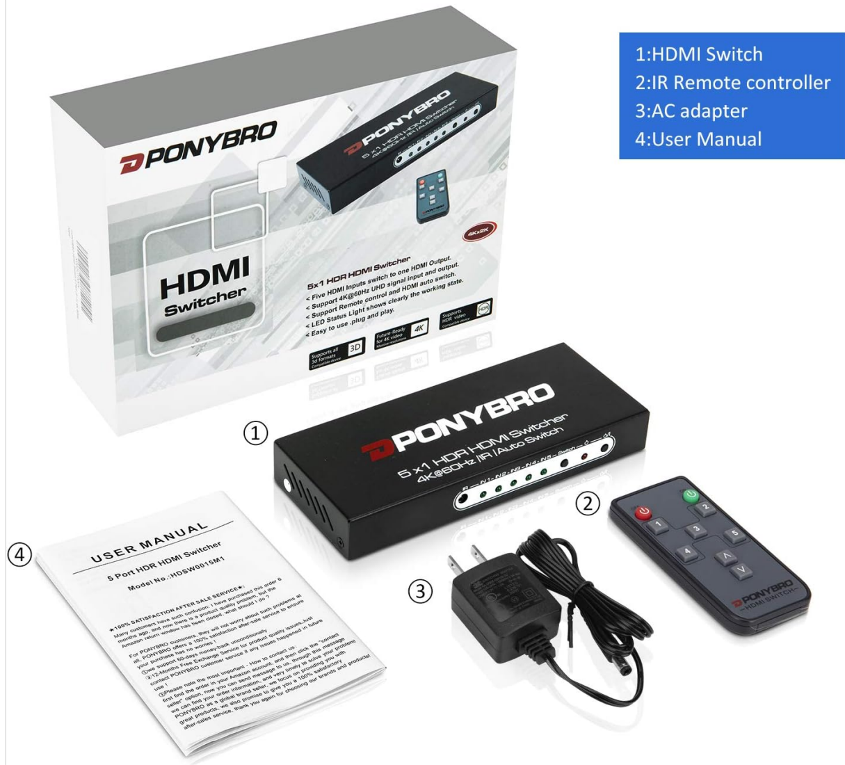
Image: The PONYBRO HDMI Switch, remote control, power adapter, and user manual are included in the package.