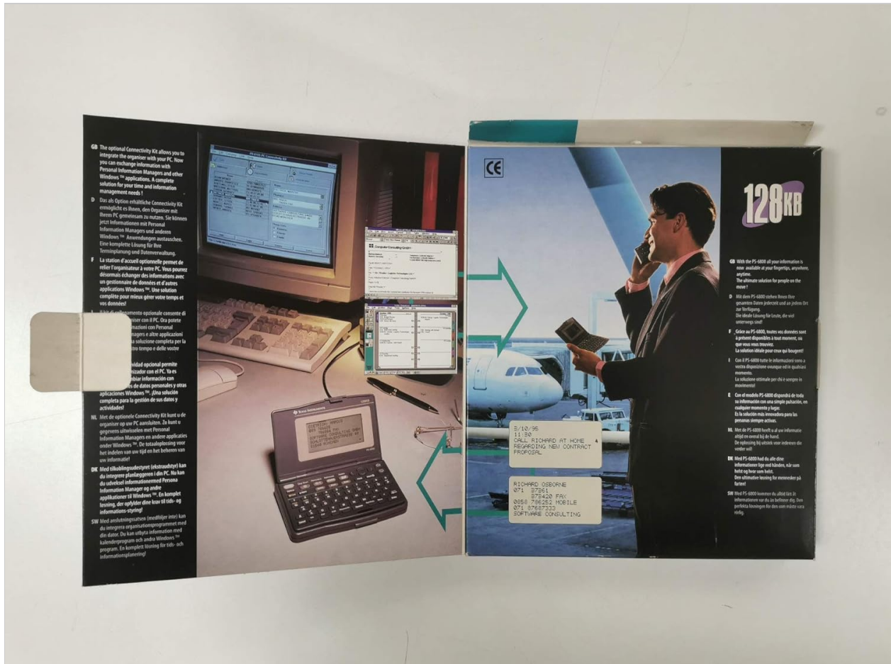
Figure 2: Inside view of the product packaging, showing the PS-6800 device alongside a computer screen demonstrating its connectivity features and data management.

The PS-6800 is compatible with the optional PS-6155 Connectivity Kit (Docking Station and Windows software). This kit allows for data transfer and synchronization with a personal computer. Refer to the PS-6155 kit's manual for detailed setup instructions.