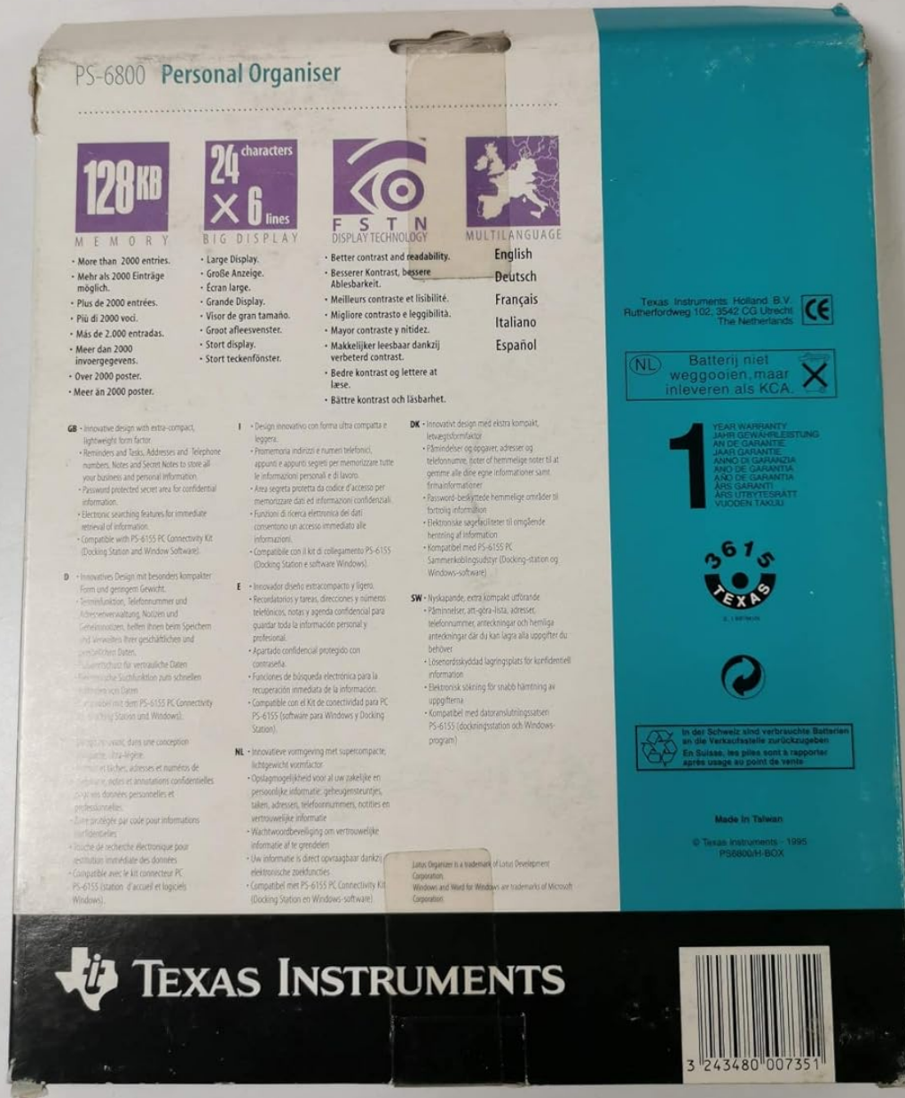
Figure 3: Rear view of the product packaging, highlighting key features such as 128KB memory, 24x6 character display, FTD (Fast Text Display) technology, and multi-language support. It also shows the manufacturer's details and a barcode.