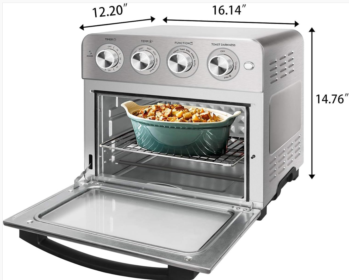
Image: The Schloß GTO23 Toaster Oven with its dimensions clearly marked: 12.20 inches (width), 16.14 inches (depth), and 14.76 inches (height). A casserole dish is shown inside the oven.