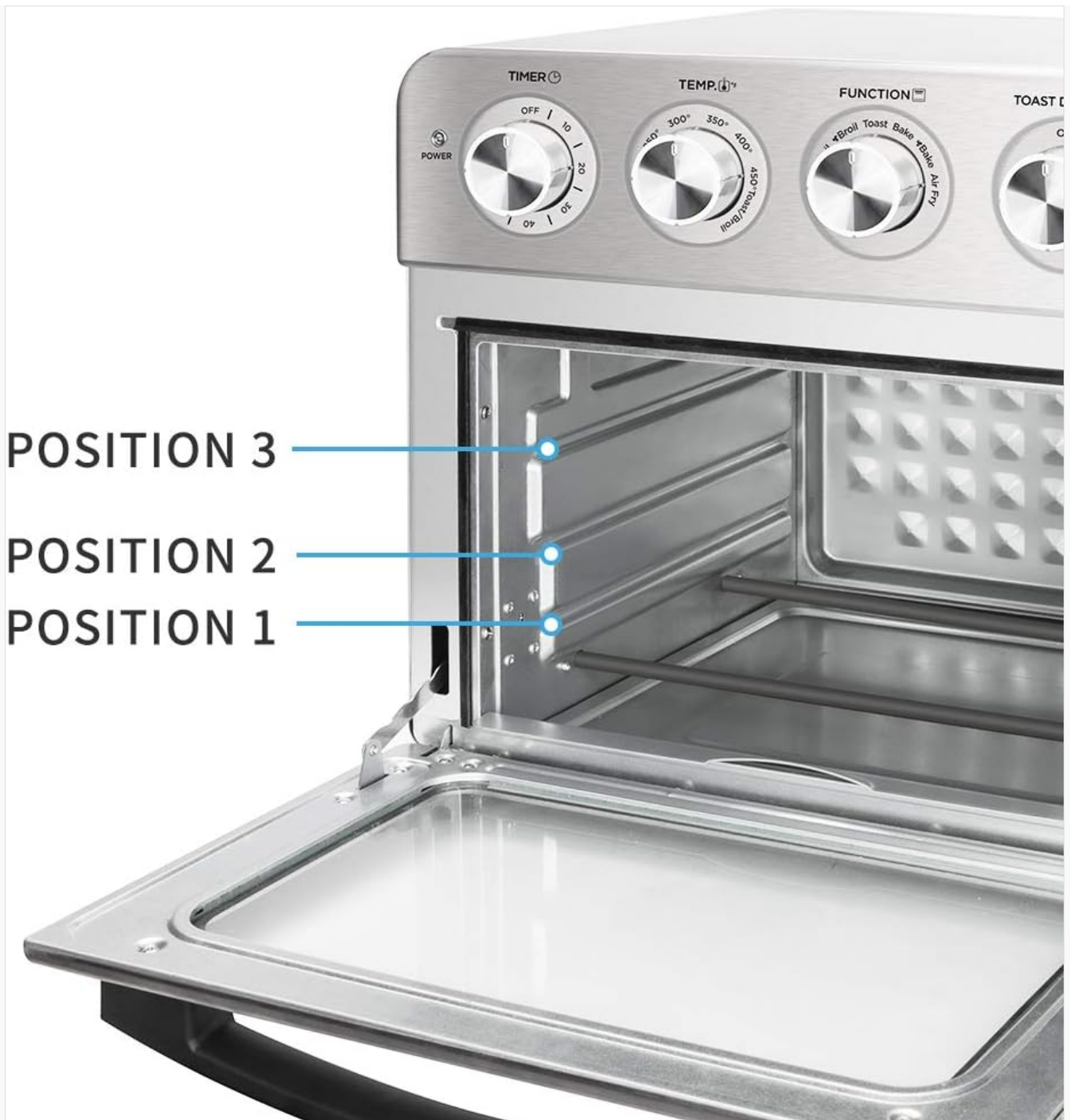
Image: Interior view of the oven with the door open, indicating three distinct rack positions (Position 1, Position 2, Position 3) for versatile cooking.