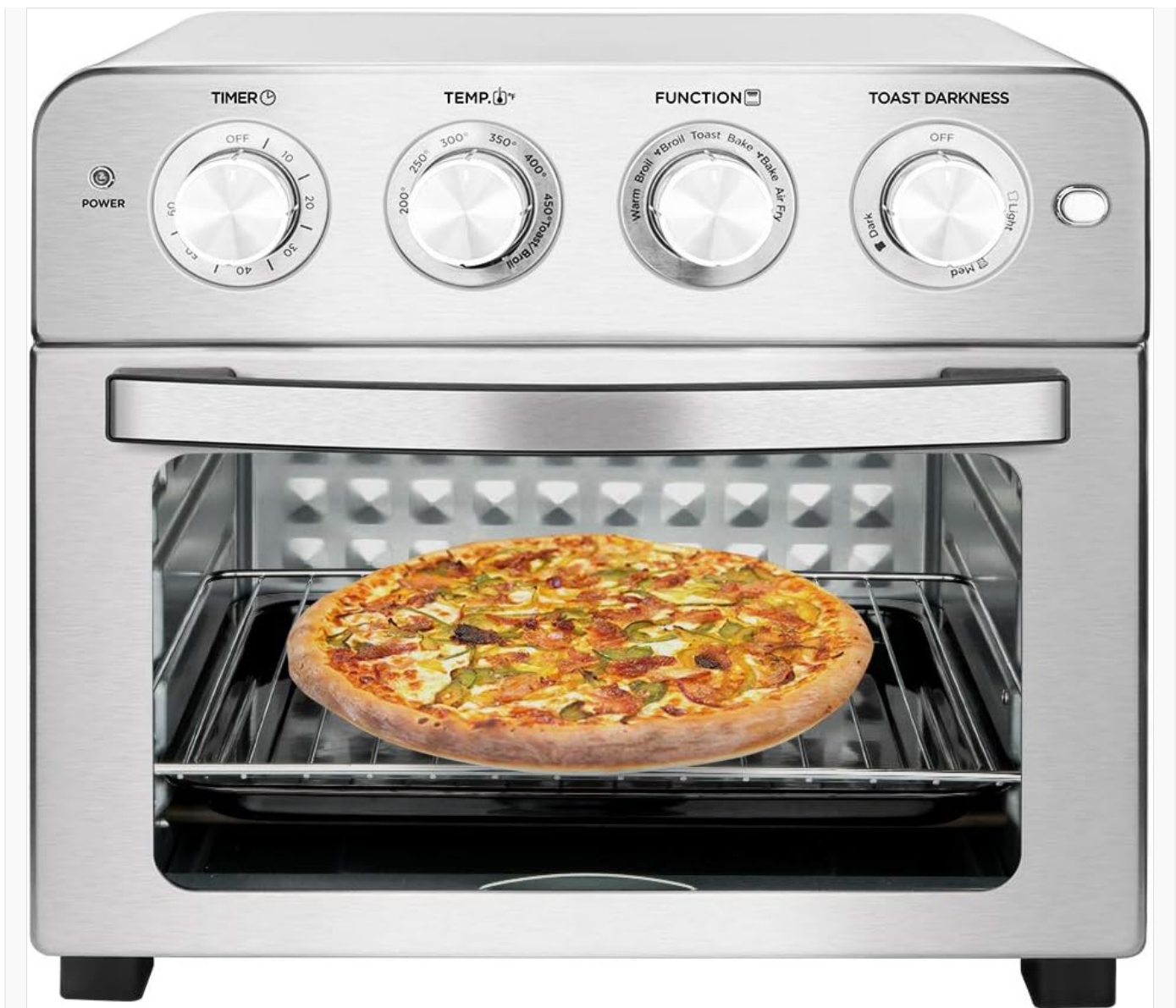
Image: A large pizza baking on the oven rack inside the Schloß GTO23 Toaster Oven, illustrating its capacity for baking larger items. Ideal for cakes, cookies, casseroles, and roasting meats. The convection feature circulates hot air for faster and more even cooking. Use the oven rack or baking pan, typically in Position 1 or 2 depending on food size.