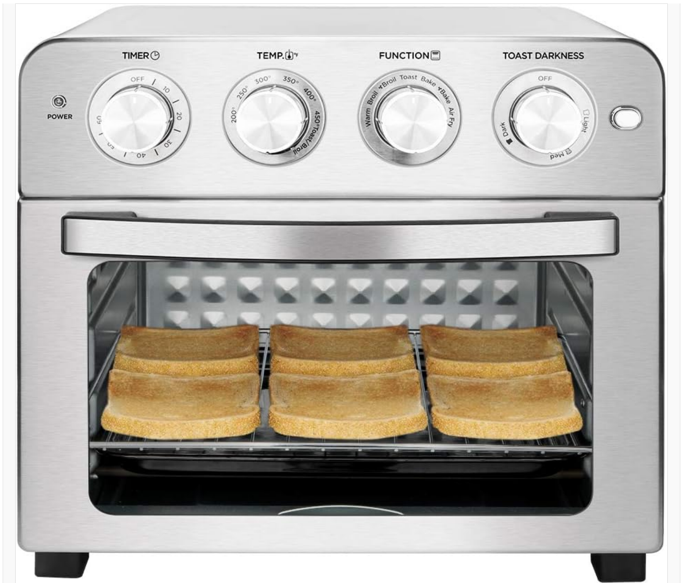
Image: Six slices of bread being toasted on the oven rack inside the Schloß GTO23 Toaster Oven, demonstrating its capacity for toast. Use the Toast function for bread, bagels, and frozen waffles. Place items on the oven rack in Position 3. Use the Toast Darkness dial to select your preferred shade (Light, Med, Dark). The timer will automatically adjust based on the darkness setting.