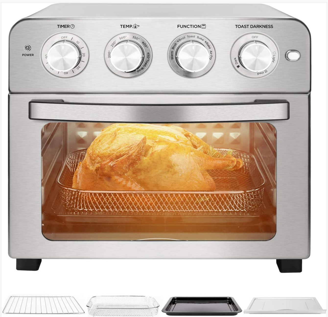
Image: Front view of the Schloß GTO23 Toaster Oven, showcasing its control panel and a roasted chicken cooking inside the main compartment. The control panel includes knobs for Timer, Temperature, Function, and Toast Darkness.