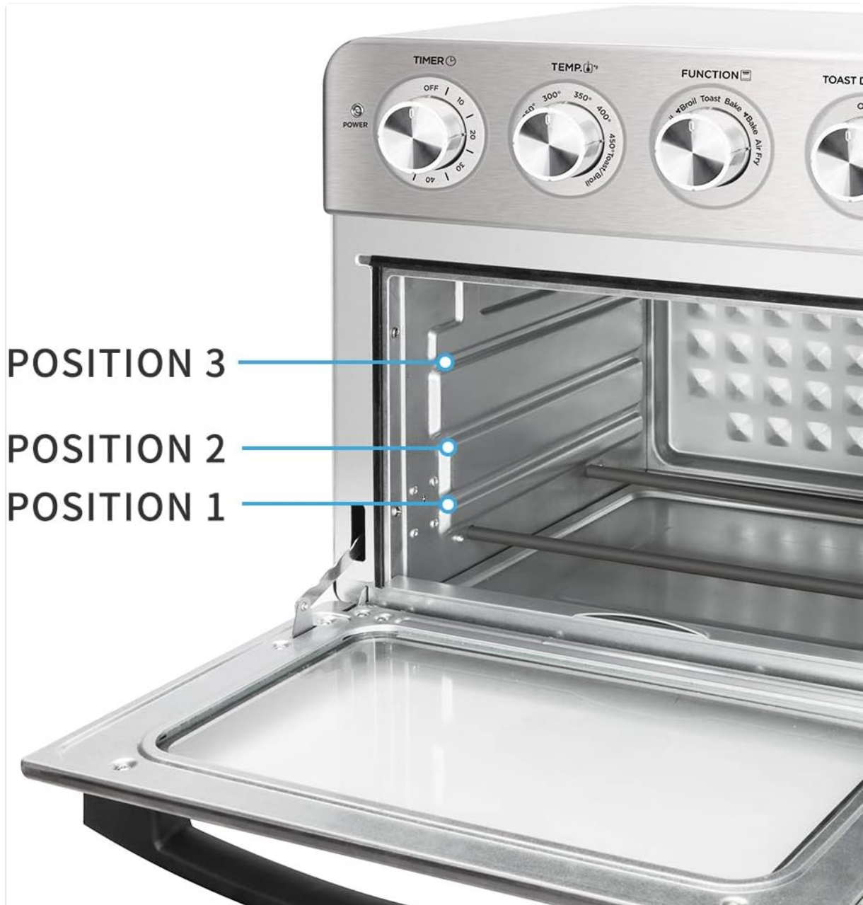
Image: Interior view of the oven highlighting the three distinct rack positions, numbered 1 (bottom), 2 (middle), and 3 (top).

The oven features three rack positions for optimal cooking flexibility: