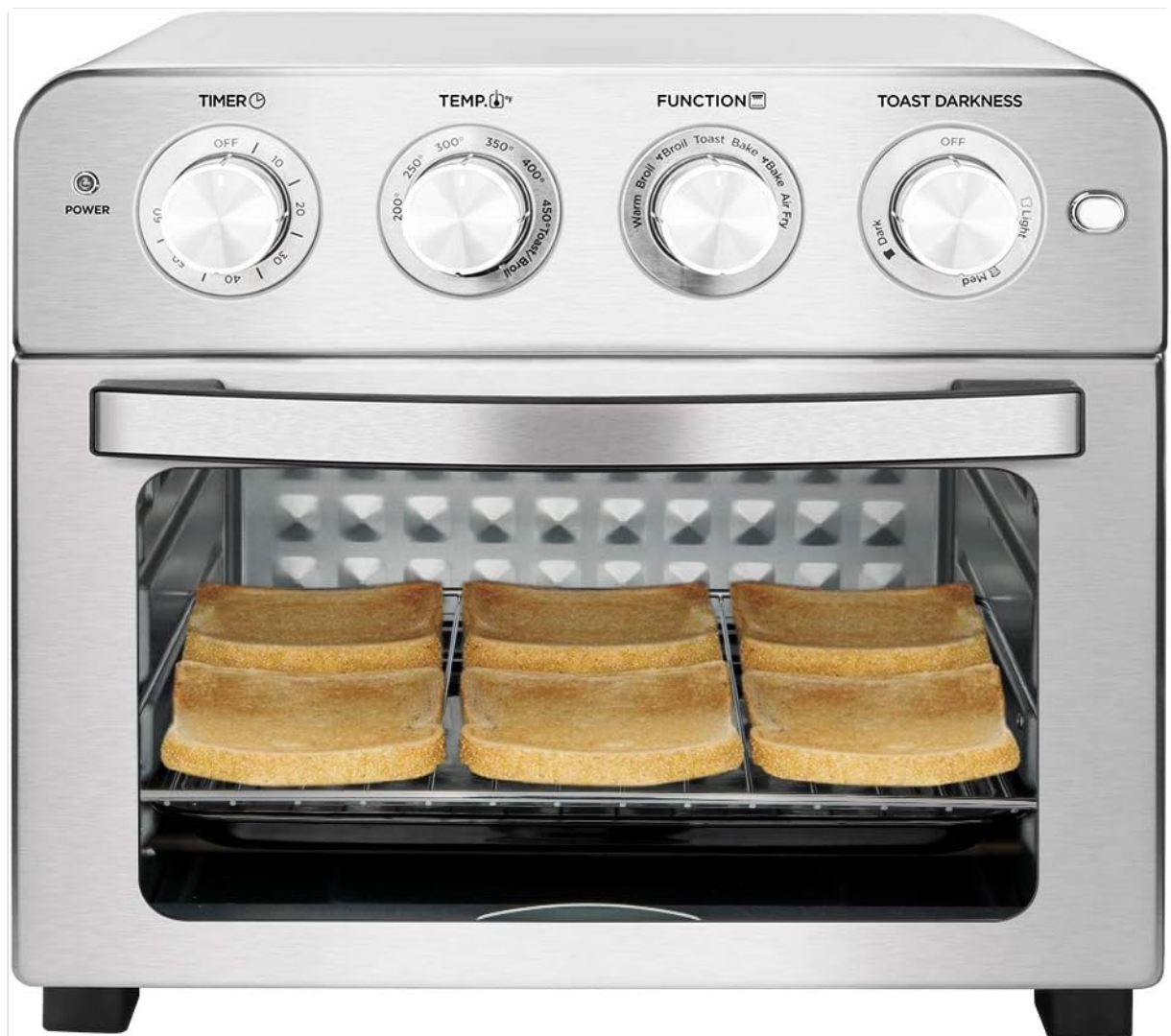
Image: Six slices of bread toasting evenly on the oven rack, demonstrating the toaster function.

For toasting bread, bagels, and waffles.