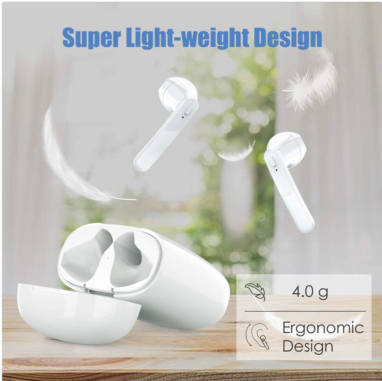
Image 3.2: Lightweight and Ergonomic Design. This image emphasizes the earbuds' super lightweight design (4.0g per earbud) and ergonomic shape for comfortable fit.