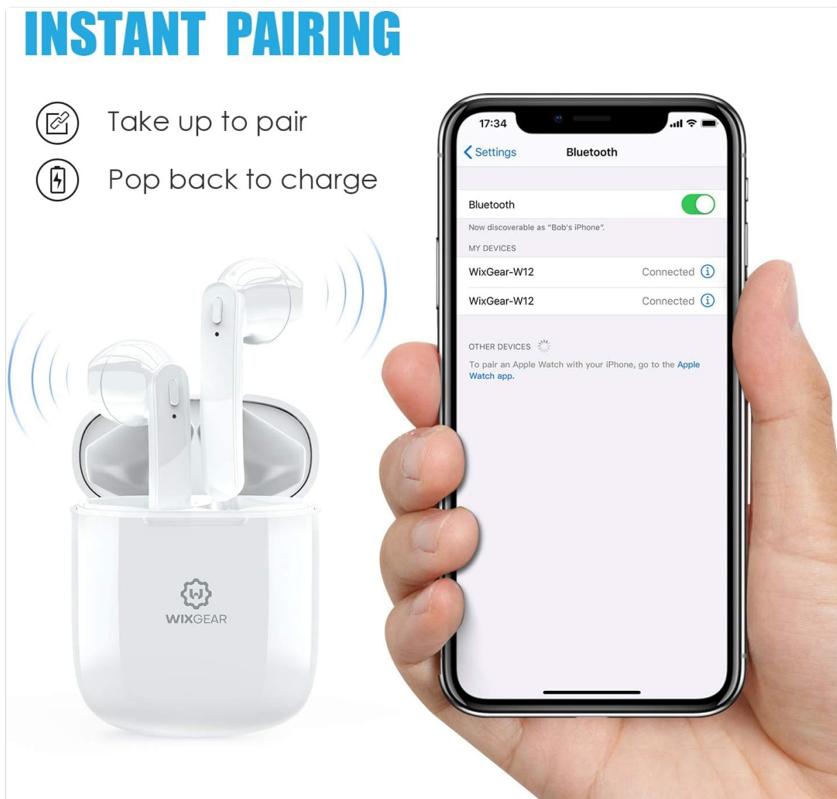
Image 2.1: Instant Pairing Process. This image illustrates the simple pairing process: take the earbuds out of the case to pair, and place them back to charge. A smartphone screen shows 'WixGear-W12' as a connected Bluetooth device.