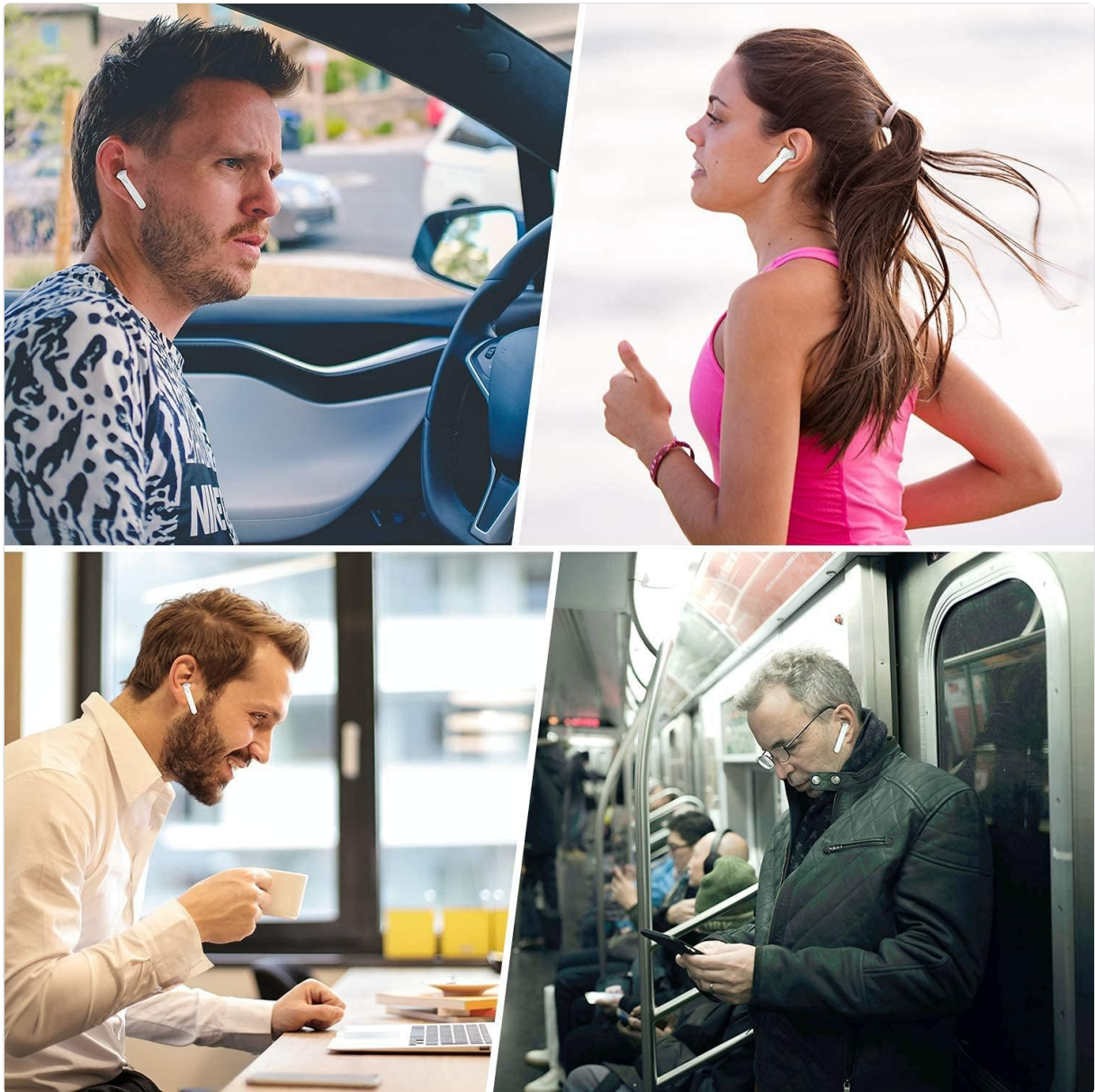
Image 3.1: Earbuds in Use. This collage shows individuals wearing the WixGear earbuds during driving, running, working, and commuting, highlighting their versatility.