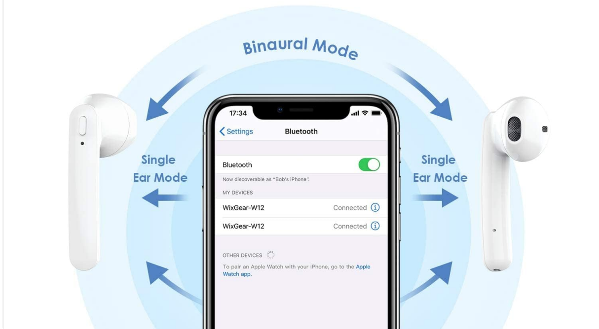
Image 2.2: Single Ear Mode vs. Binaural Mode. This diagram explains how to use one earbud (L or R) independently or both together for stereo sound, with an illustration of the Bluetooth settings on a phone.

Put any earphone back into the charging box and the other earphone continues to work.