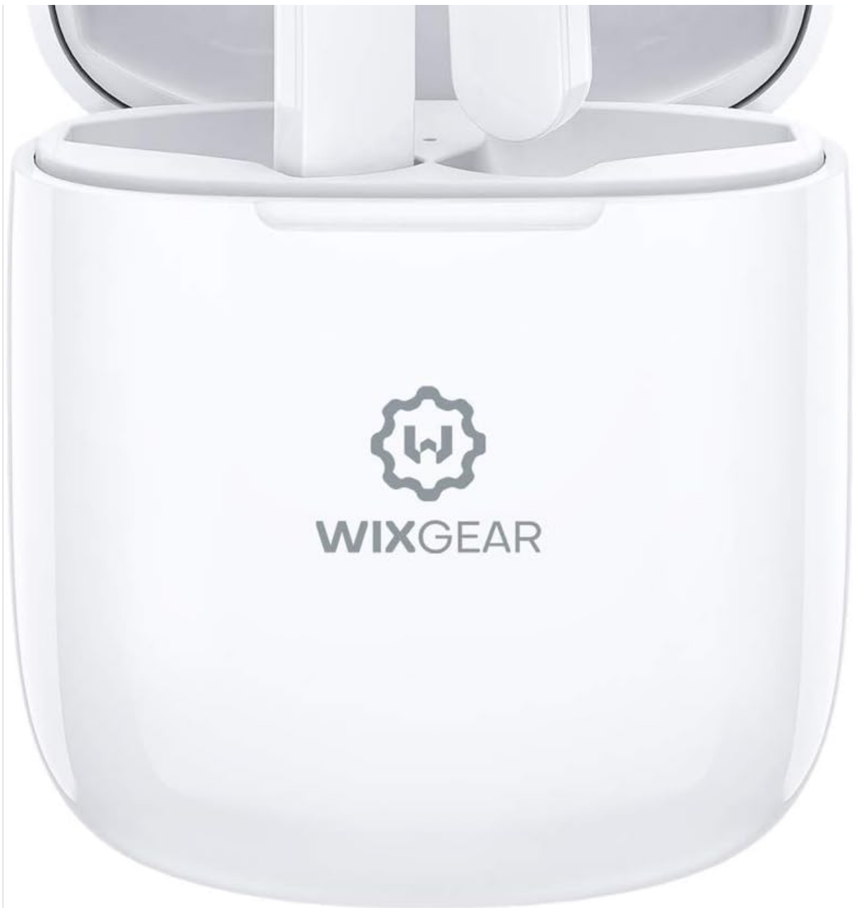
Image 1.1: WixGear Bluetooth 5.0 Wireless Earbuds and Charging Case. The earbuds are shown resting inside their white charging case, ready for use or charging.