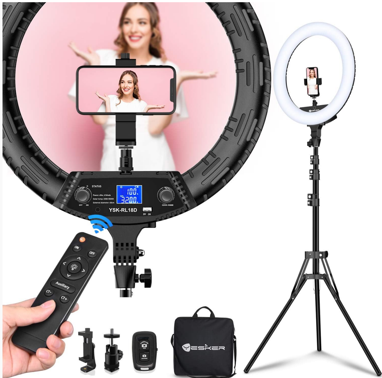
Image 1.1: The Yesker 18-inch Ring Light with its components, including the tripod stand, wireless remote, and phone holder.