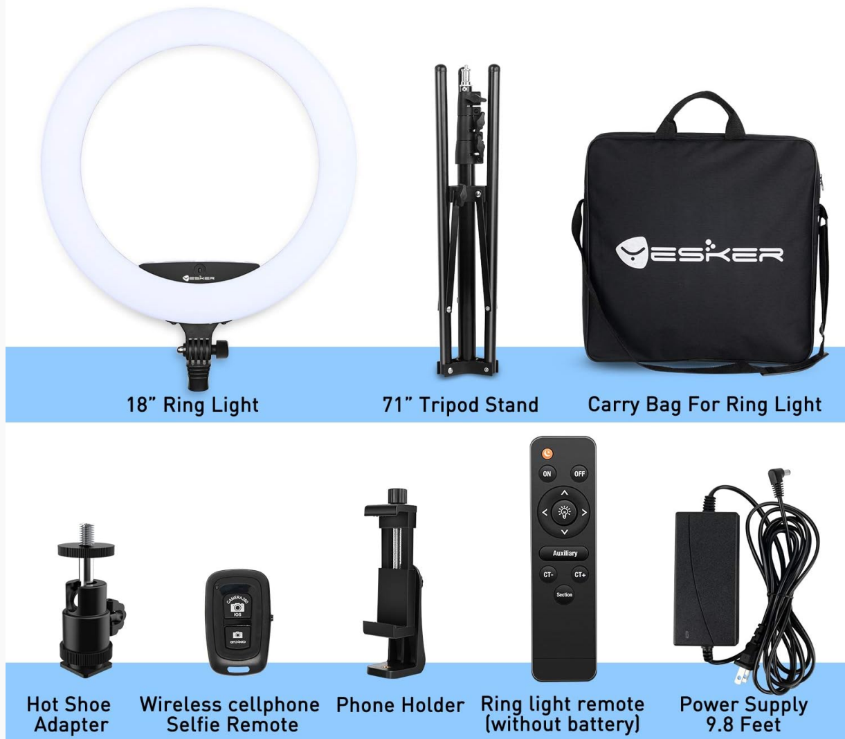
Image 3.1: A visual representation of all components included in the Yesker 18-inch Ring Light package.