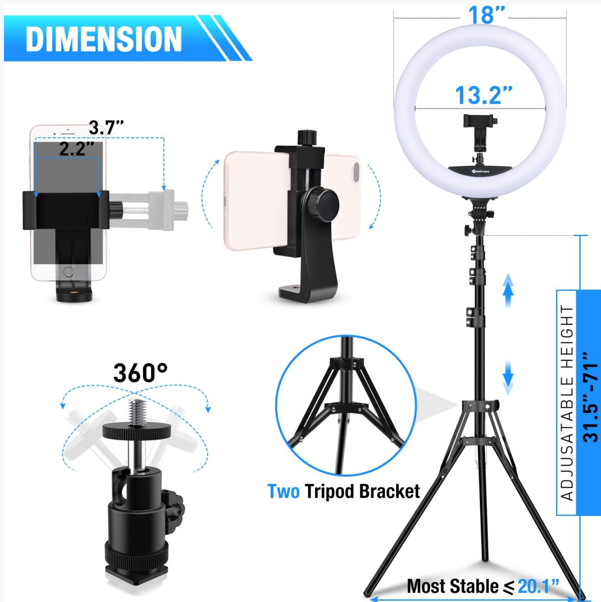
Image 5.1: Illustration of the tripod's adjustable height range (31.5"-71") and the 360-degree rotation capability of the mounting head.