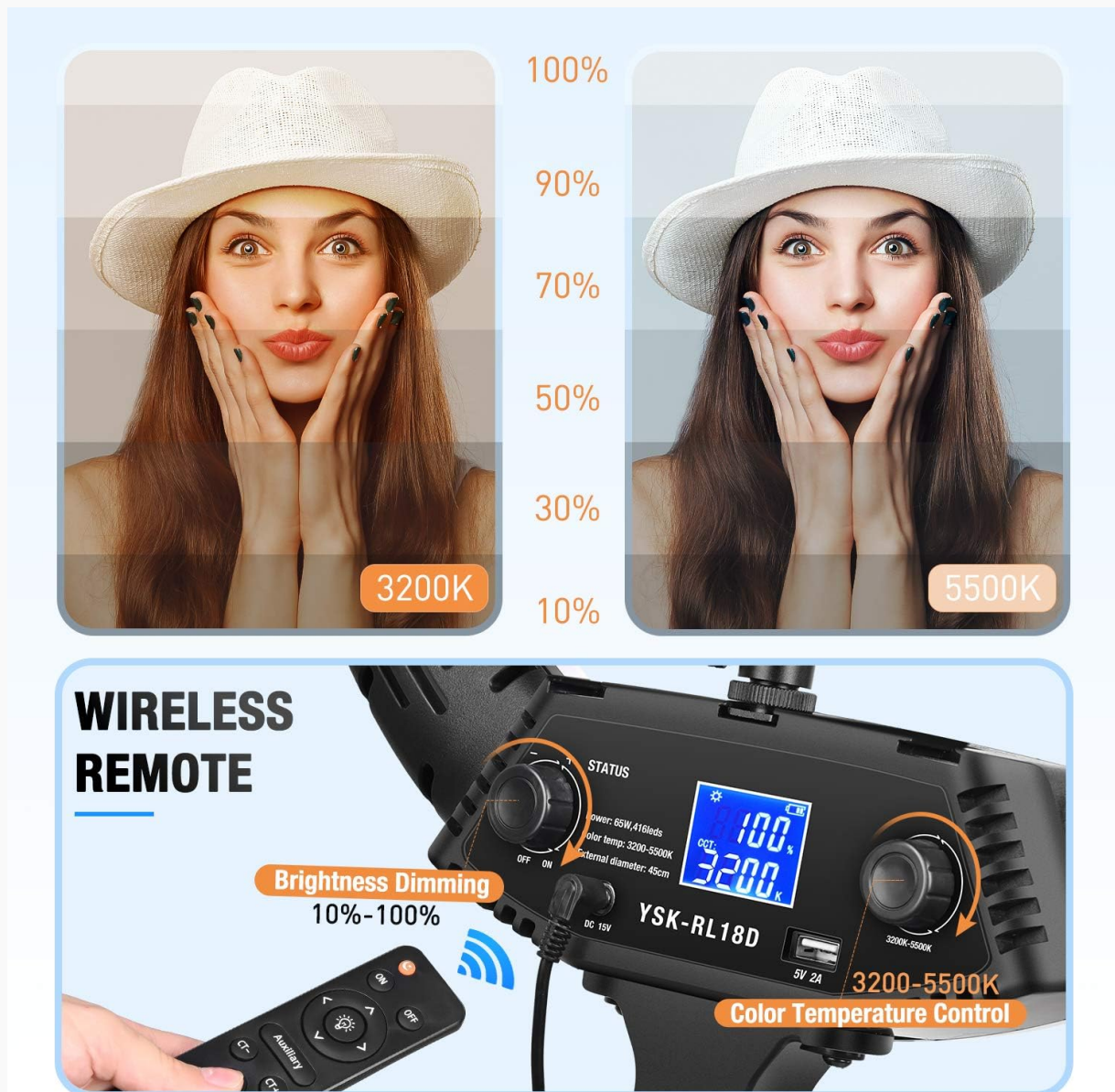
Image 4.1: Detailed view of the ring light's control panel, showing the LCD display for brightness and color temperature, and the wireless remote.