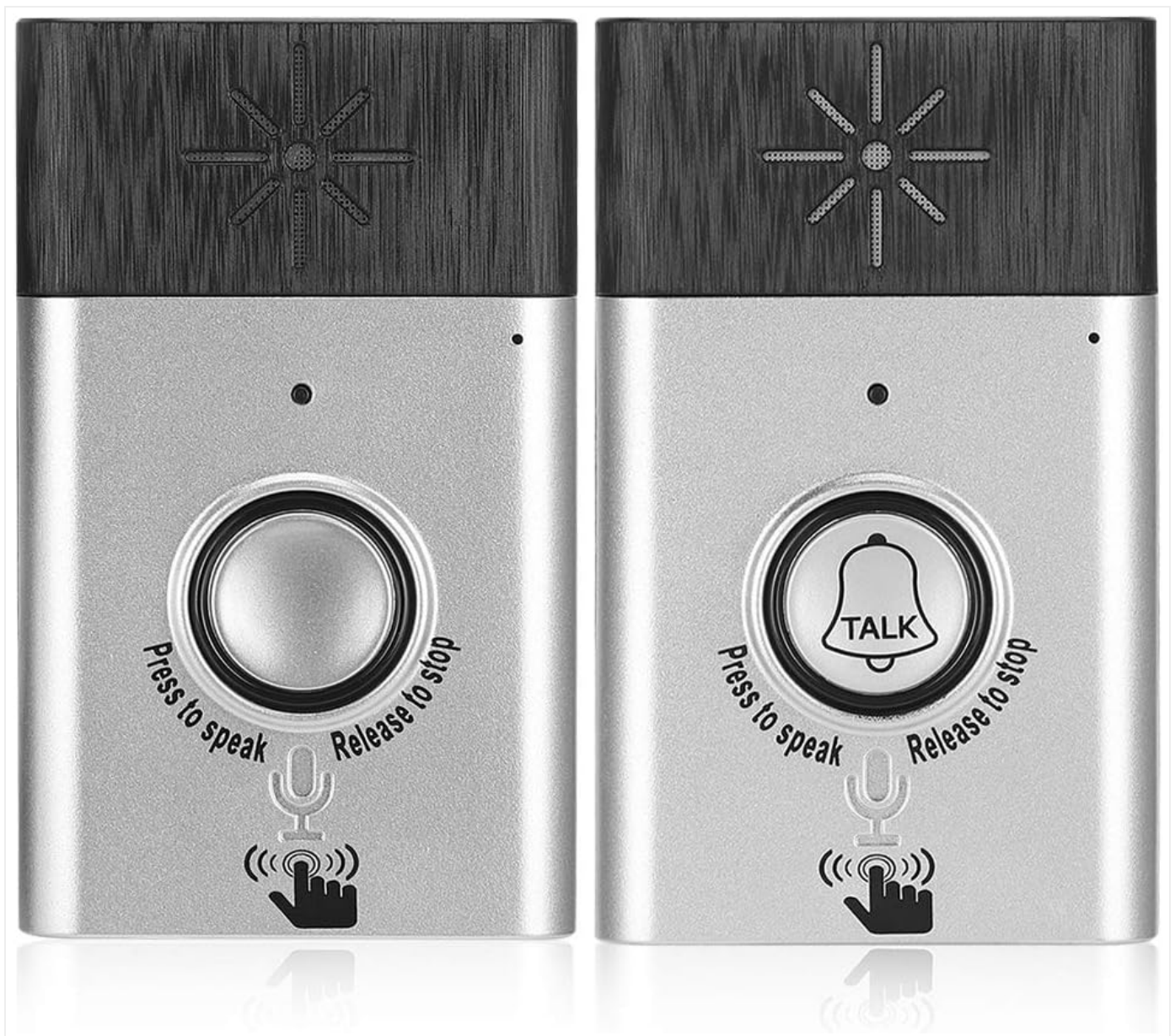
Image 1.1: Front view of the Tosuny Wireless Two-Way Intercom Doorbell units, showing the outdoor unit (left) and indoor unit (right) with 'Press to speak' and 'Talk' buttons.