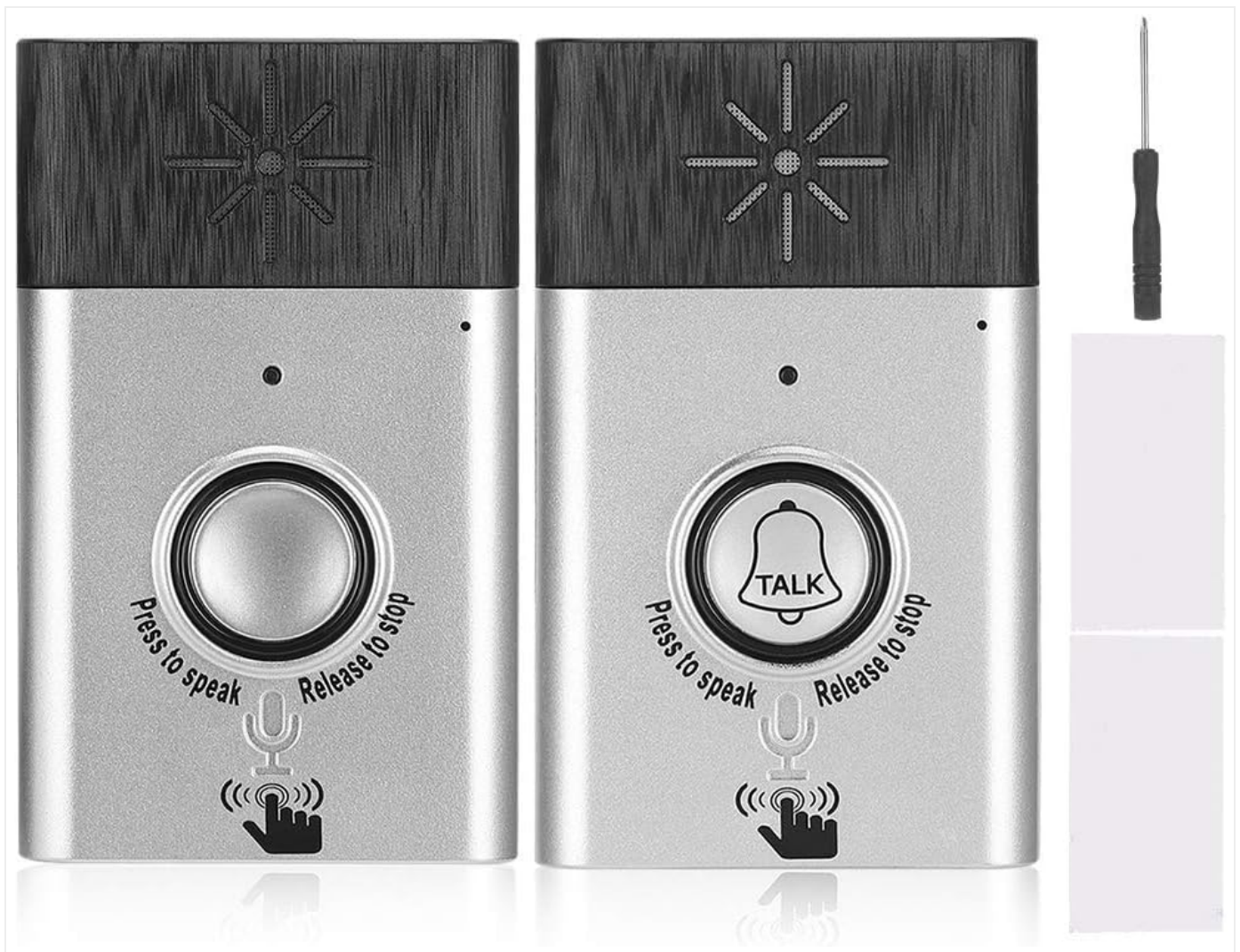
Image 3.1: The outdoor and indoor units of the doorbell system, along with a small screwdriver and adhesive pads for installation.