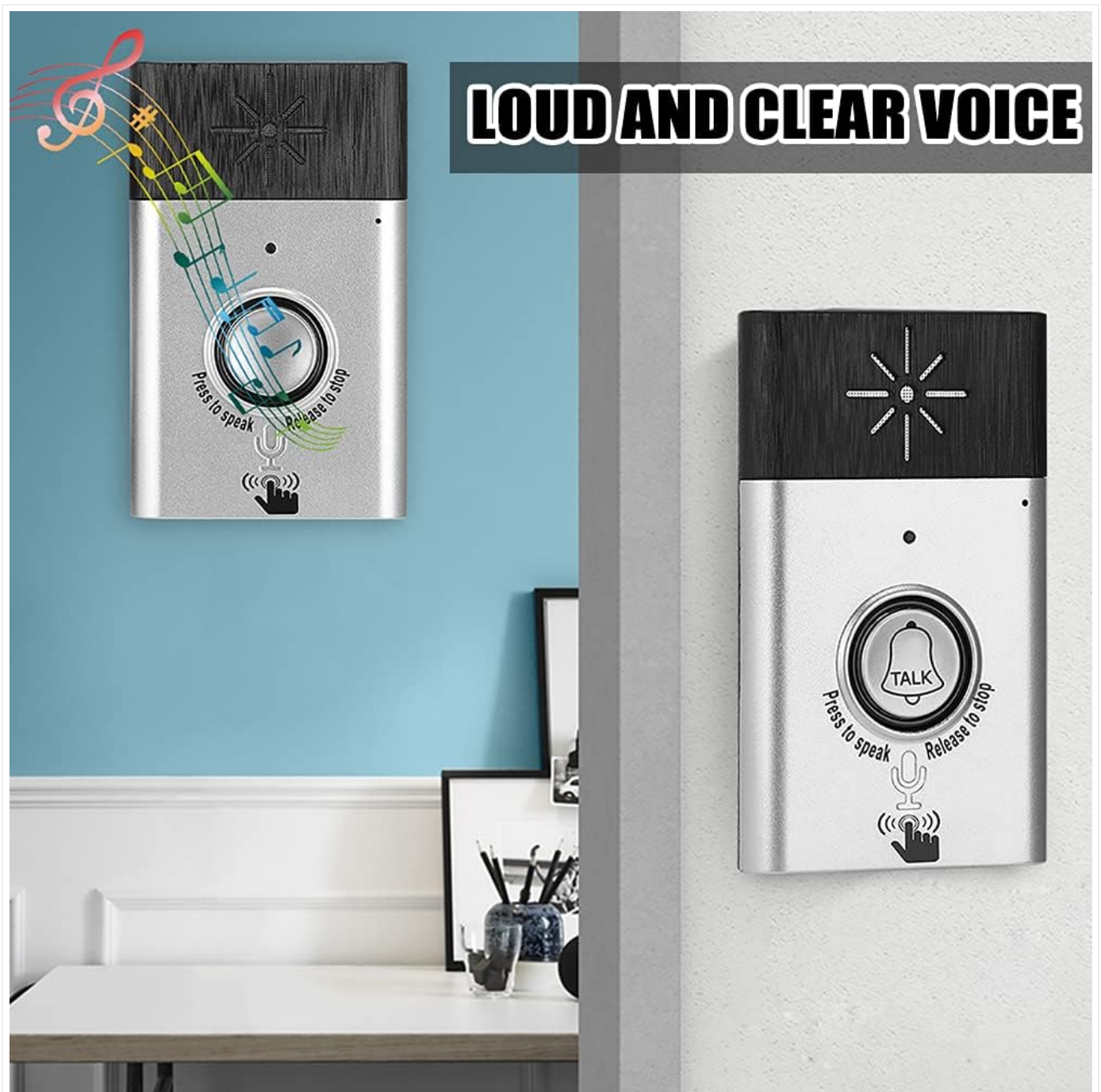
Image 4.3: The indoor unit highlighting its adjustable voice volume and changeable ring type features.