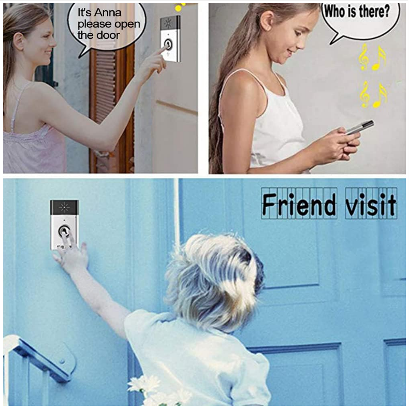
Image 4.1: A person pressing the button on the outdoor doorbell unit, initiating a call.