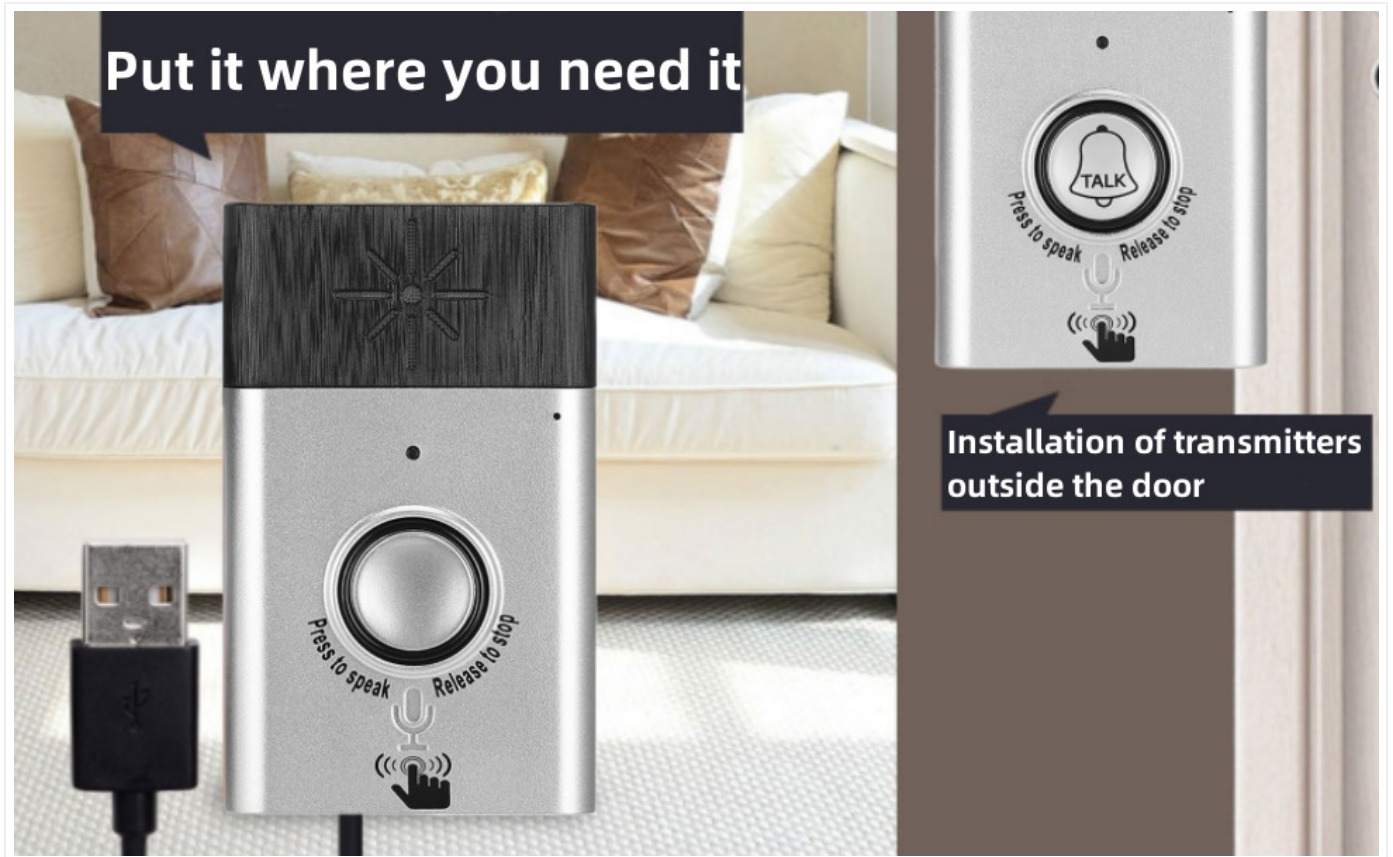
Image 3.2: Diagram illustrating the placement of the outdoor unit near a door and the indoor unit within a home environment.