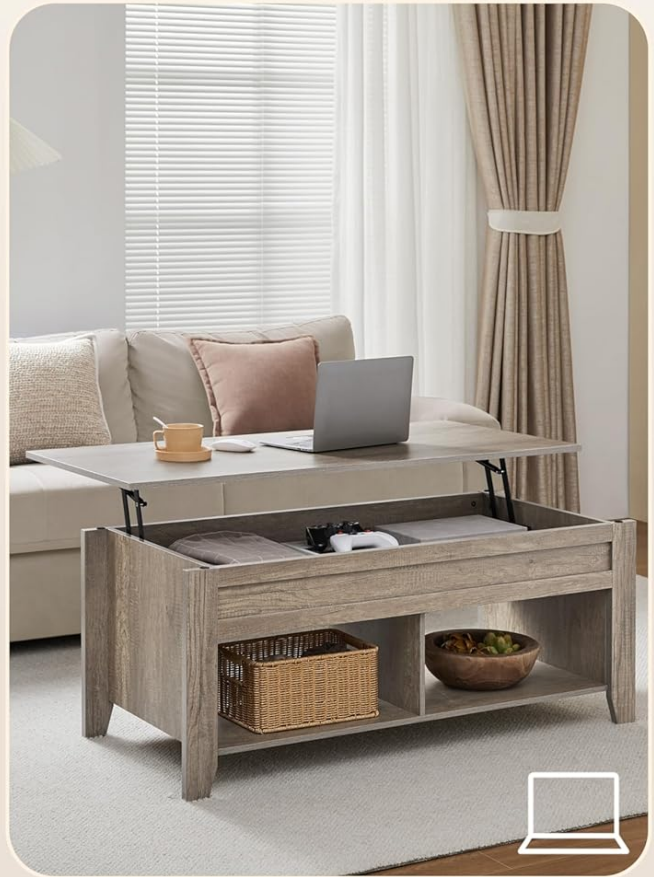
Image: The hidden storage compartment revealed, showcasing ample space for various items, keeping your living area tidy.