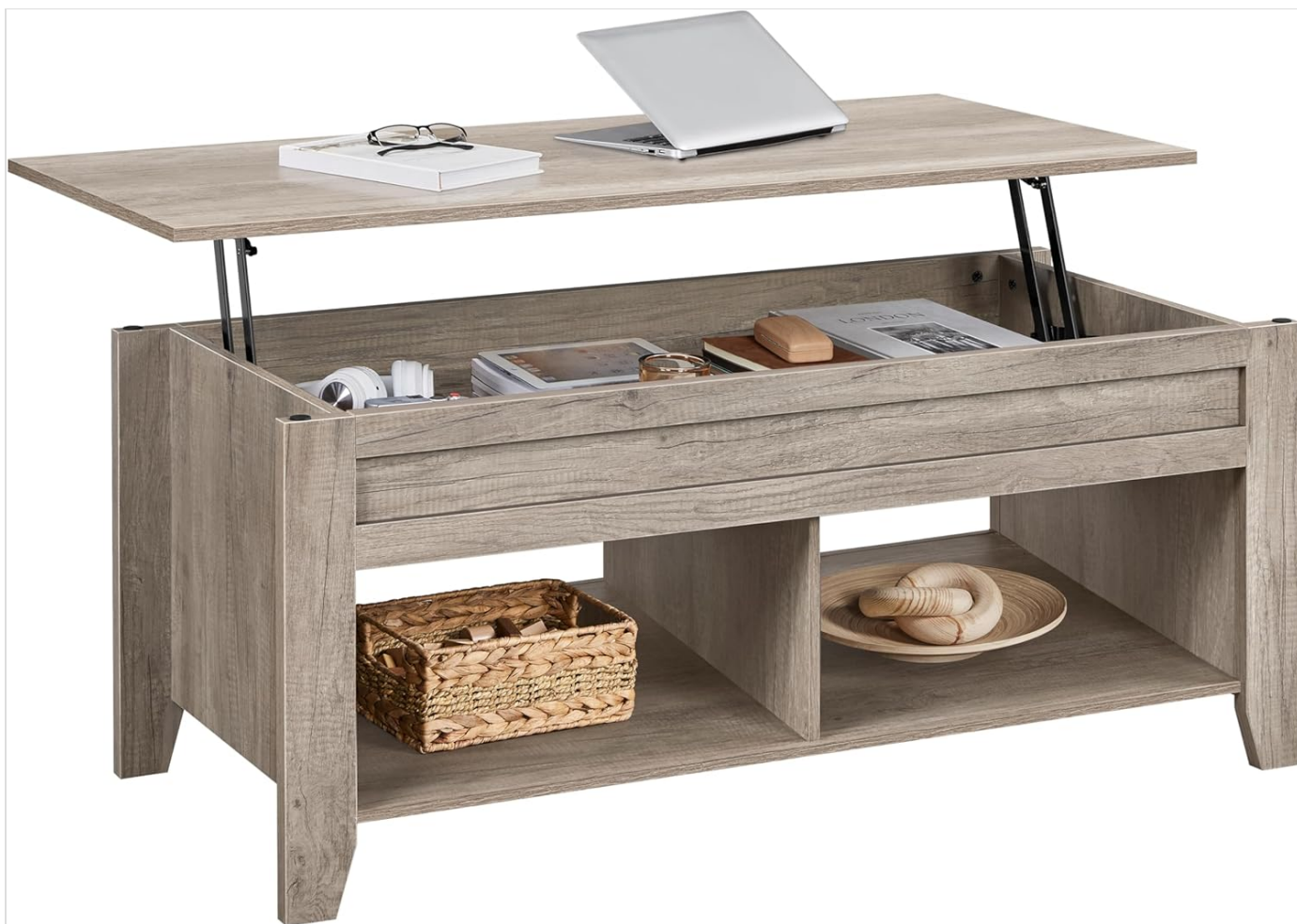
Image: The coffee table in its lifted position, demonstrating its use as a comfortable surface for working with a laptop or dining.