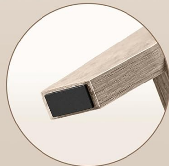
Foot Pads Prevent the floor from scratches

Image: Protective EVA foam pads ensure safe and quiet operation of the lift-top, while foot pads prevent floor scratches.