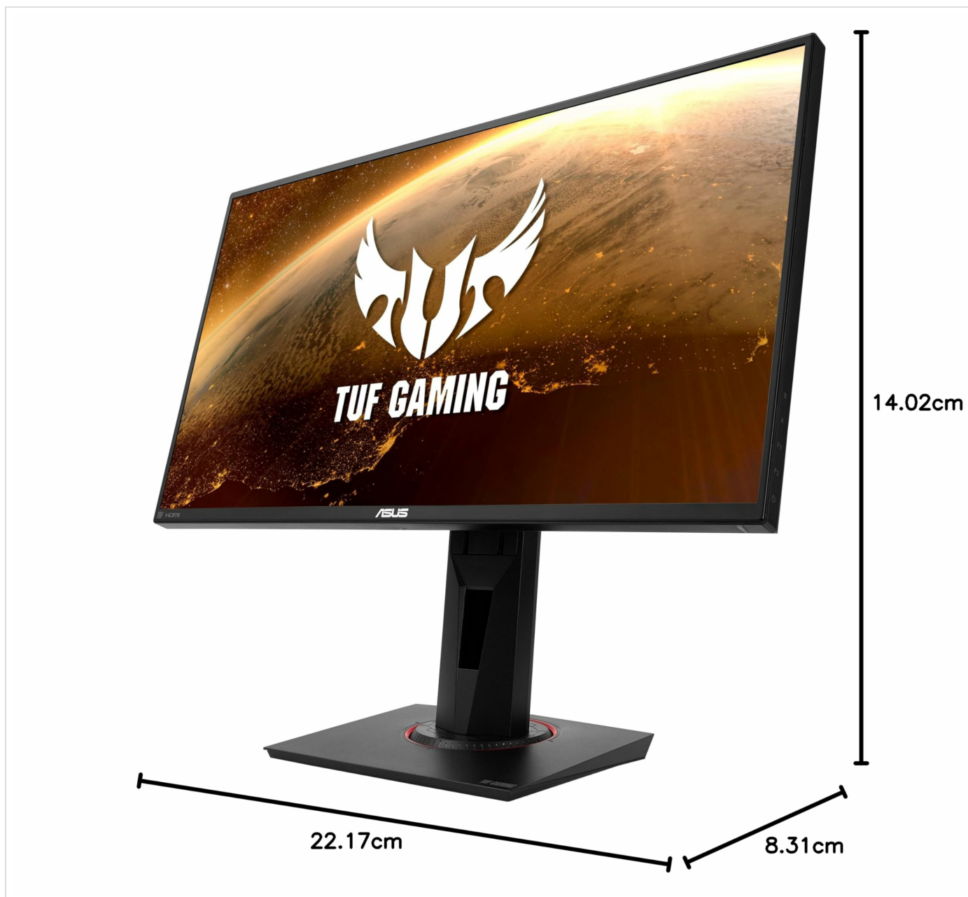
Image: Product dimensions of the ASUS TUF Gaming VG259QM monitor.