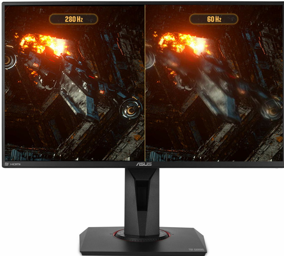
Image: Visual comparison of 280Hz versus 60Hz refresh rates, highlighting the fluidity of the higher refresh rate.