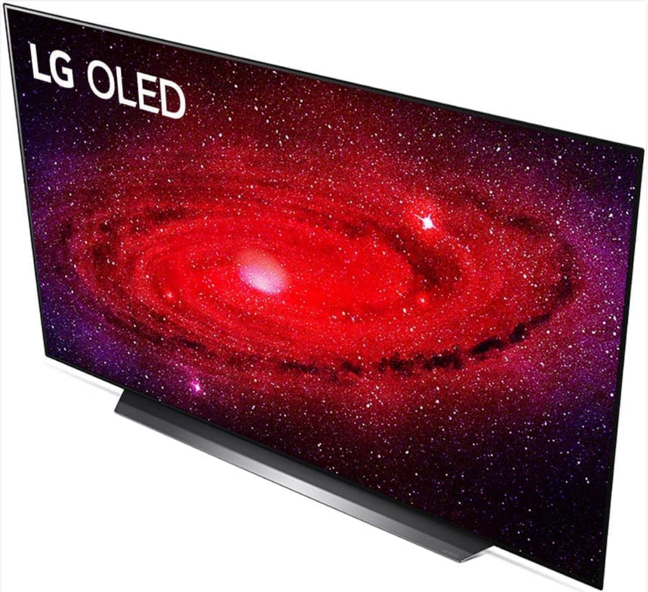
Figure 4.1: Top-down view of the LG OLED55CX6LA TV, showing the integrated stand and rear ventilation.