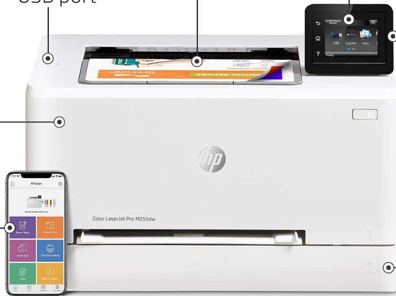
Image 2.1: Diagram highlighting key features of the HP Color LaserJet Pro M255dw, including dual-band Wi-Fi, Ethernet, front USB port, automatic two-sided printing, 2.7" color touchscreen, strong security, HP Smart app integration, and a 250-sheet input tray.