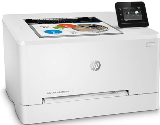
HP Color LaserJet Pro M255dw