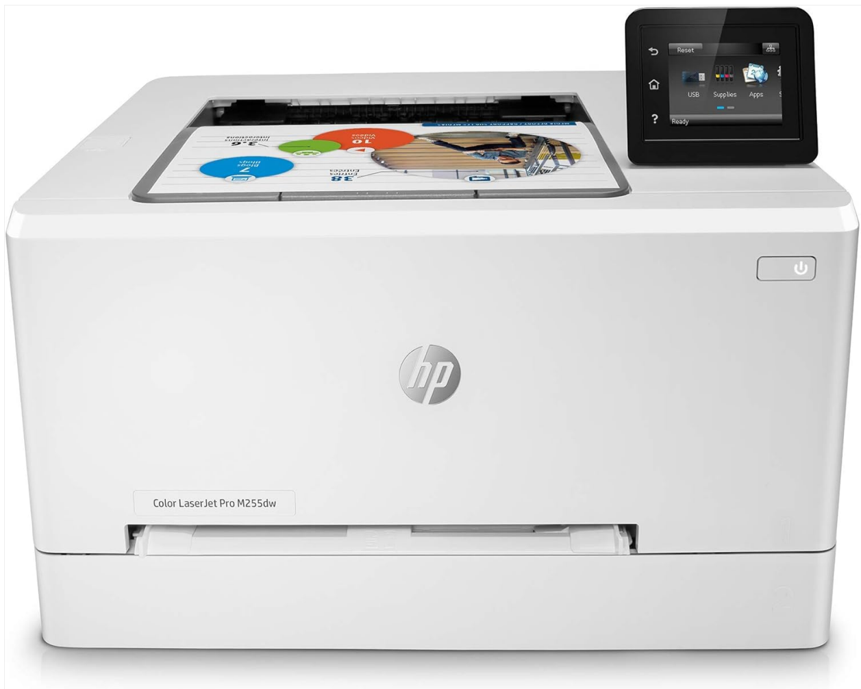
Image 1.1: Front view of the HP Color LaserJet Pro M255dw Wireless Laser Printer, showing its compact design and control panel.