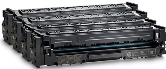
HP 206A LaserJet Toner Cartridges Black, Cyan, Magenta, Yellow