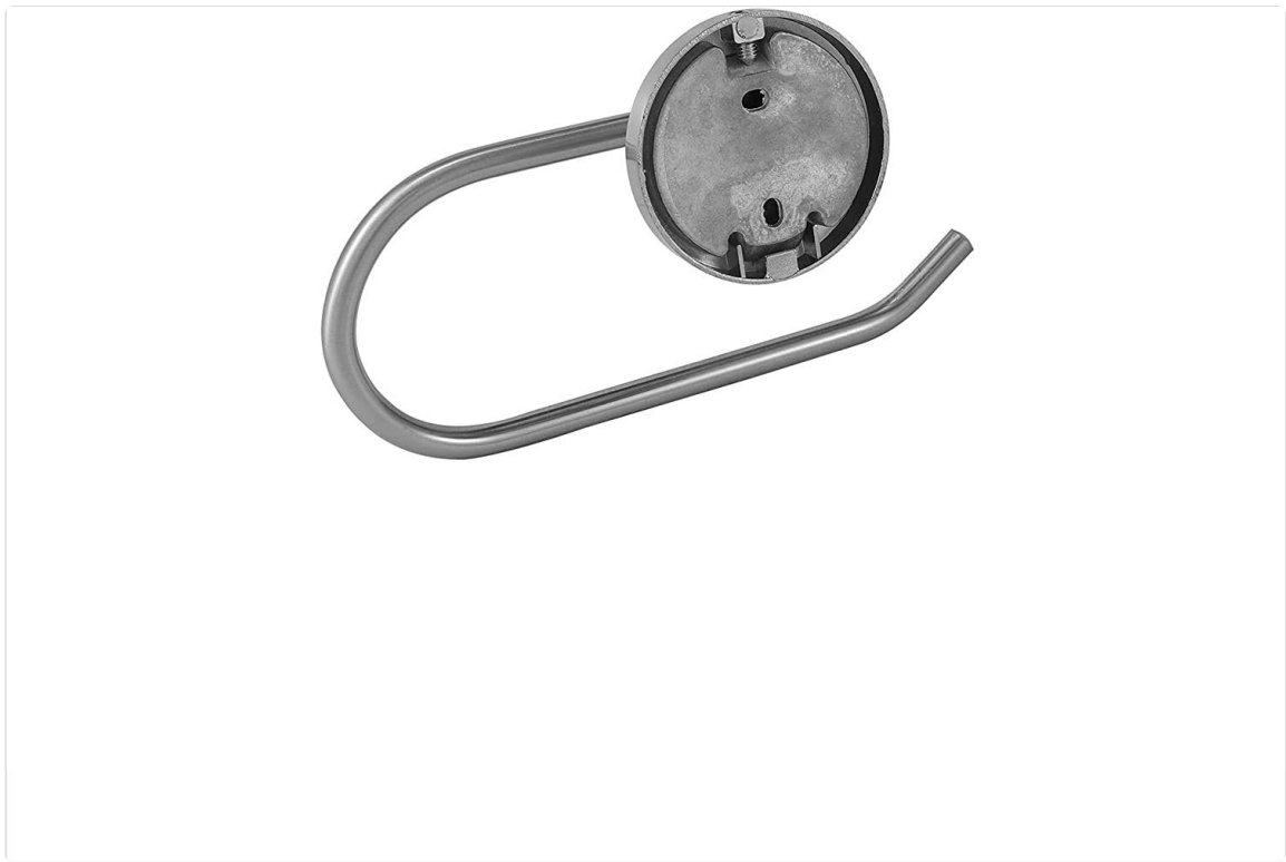
Image: Rear view of the toilet paper holder's mounting plate, indicating the screw holes for traditional installation.