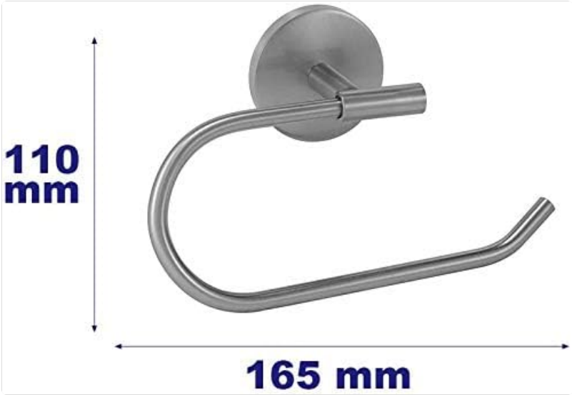
Image: Diagram showing the dimensions of the toilet paper holder: 110 mm height and 165 mm width.

This SENSEA product is covered by a 4-year warranty from the date of purchase. This warranty ensures the product's reliability, safety, and solid construction under normal use. Please retain your proof of purchase for warranty claims.