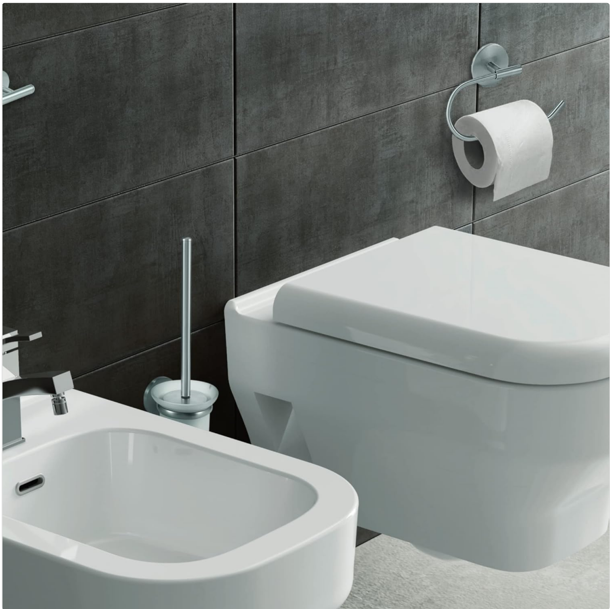
Image: The SENSEA toilet paper holder mounted in a bathroom setting, holding a toilet paper roll.