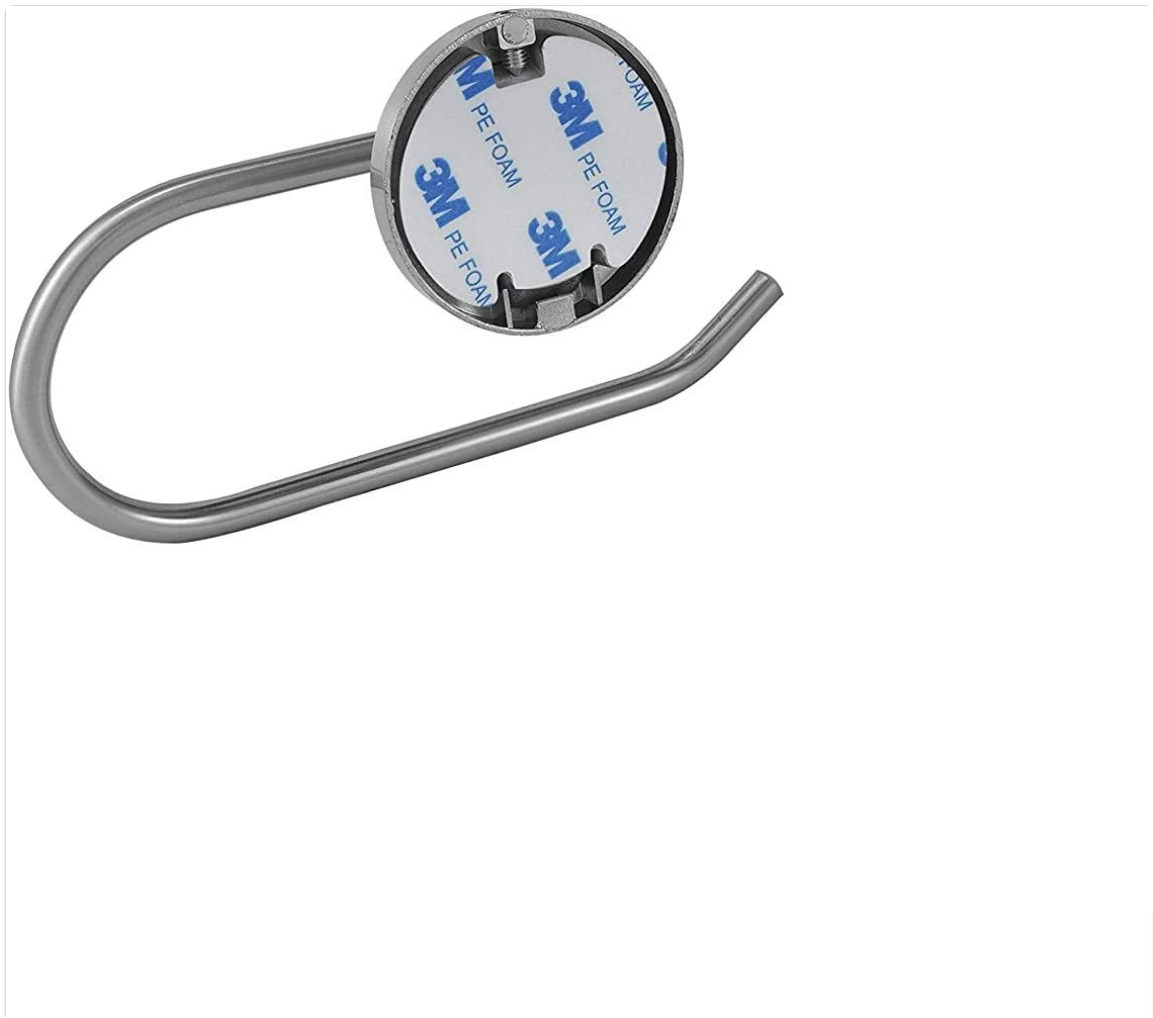
Image: Rear view of the toilet paper holder showing the 3M adhesive pad attached to the mounting plate.