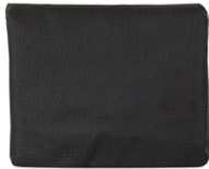
Vinyl Storage Cover (style may vary)