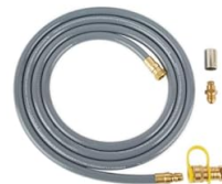
Natural Gas Conversion Kit