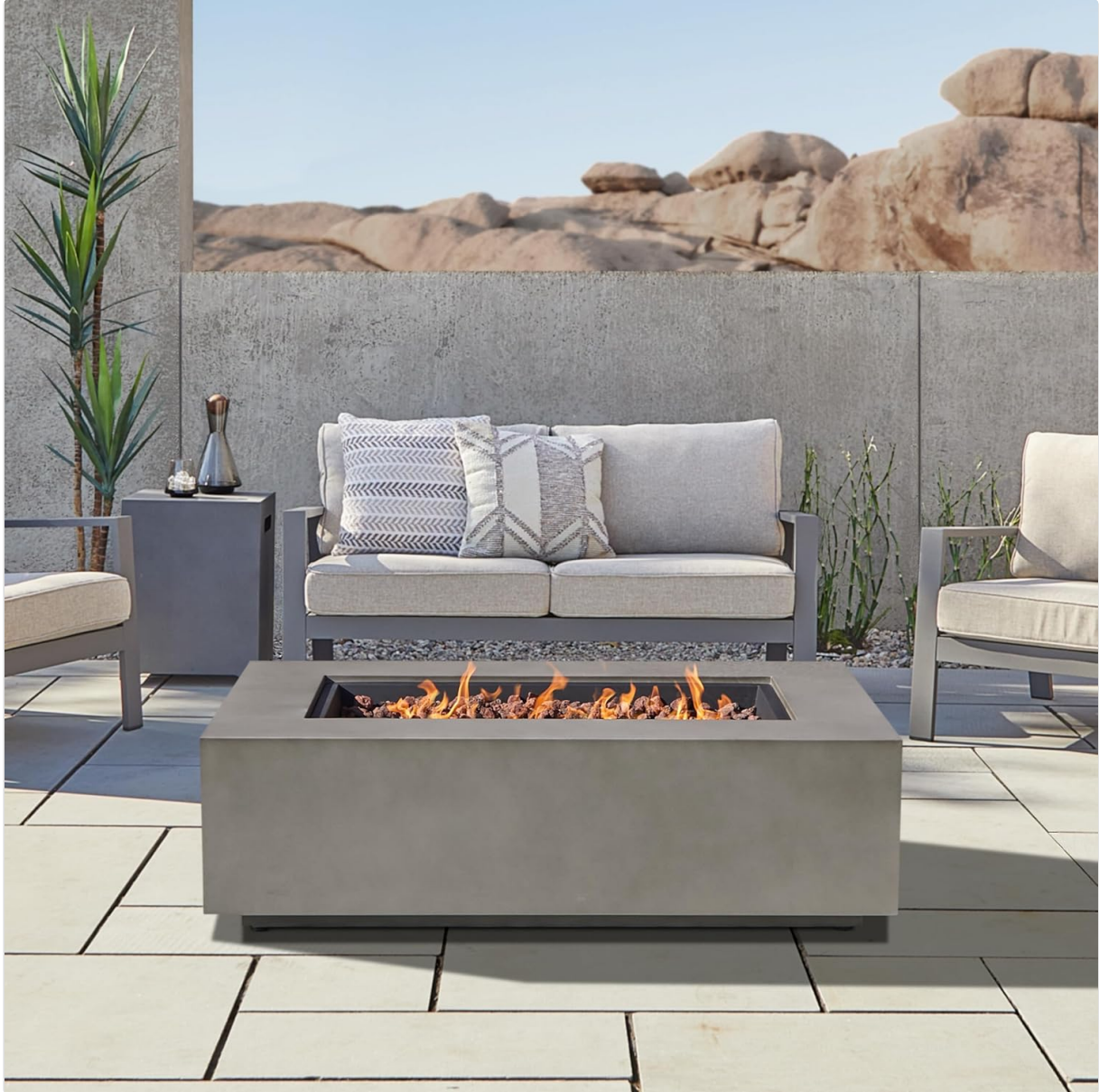
Image: The Aegean fire pit table positioned on an outdoor patio, demonstrating typical placement with outdoor furniture.

The Real Flame Aegean Fire Pit Table requires no assembly. Place the fire pit on a level, non-combustible surface outdoors. Ensure adequate clearance from combustible materials (walls, furniture, etc.) as specified by local codes and the product's safety labels.