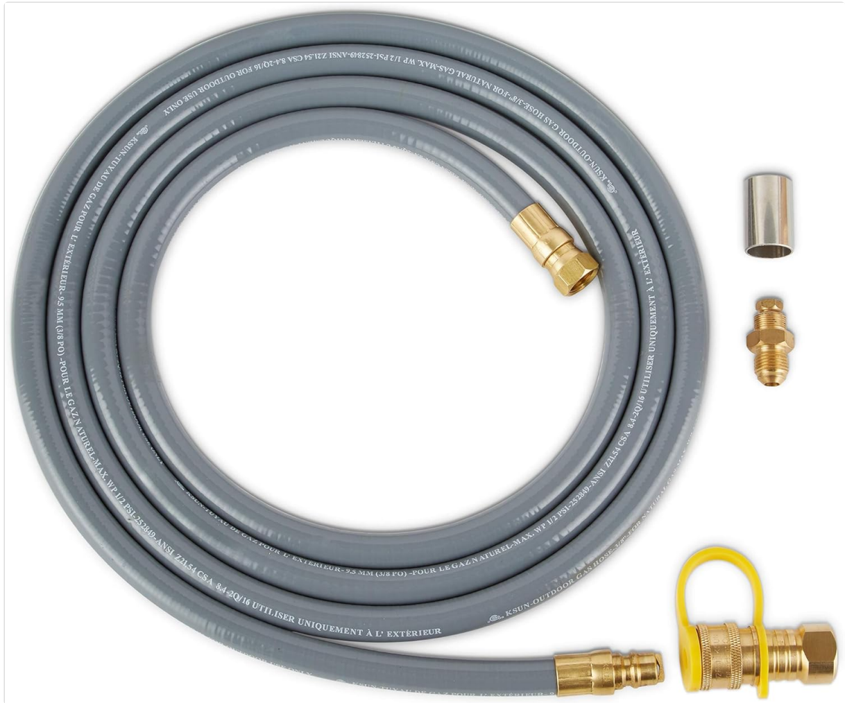
Image: Components of the natural gas conversion kit, including a gas hose and various fittings, used for converting the fire pit from propane to natural gas.