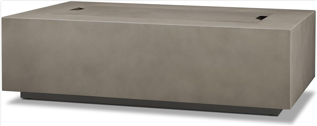
Image: The Aegean fire pit table with its steel lid in place, demonstrating its functionality as a coffee table when not in use as a fire pit.

When not in use, especially during inclement weather or extended periods, cover the fire pit with the included polyester protective cover. Store the propane tank in a well-ventilated area, away from direct sunlight and heat sources.