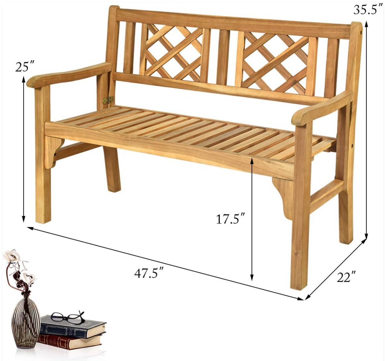
Figure 3: Bench Features and Construction Details