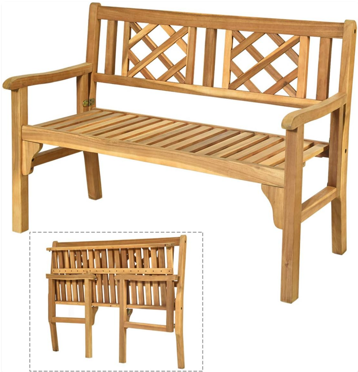
Figure 1: Giantex 4 Ft Foldable Outdoor Bench (Assembled and Folded)