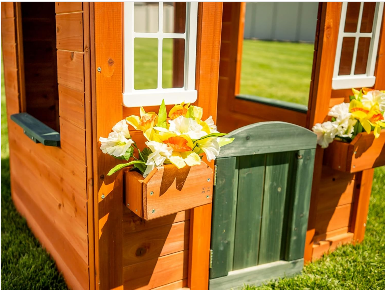
A detailed view of the wooden flowerpot holders, highlighting their design and potential for decorative use.