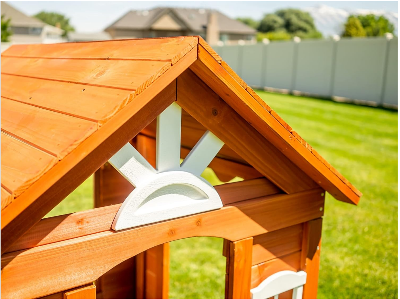
A close-up shot of the playhouse roof and decorative gable, showing the quality of the wooden construction.