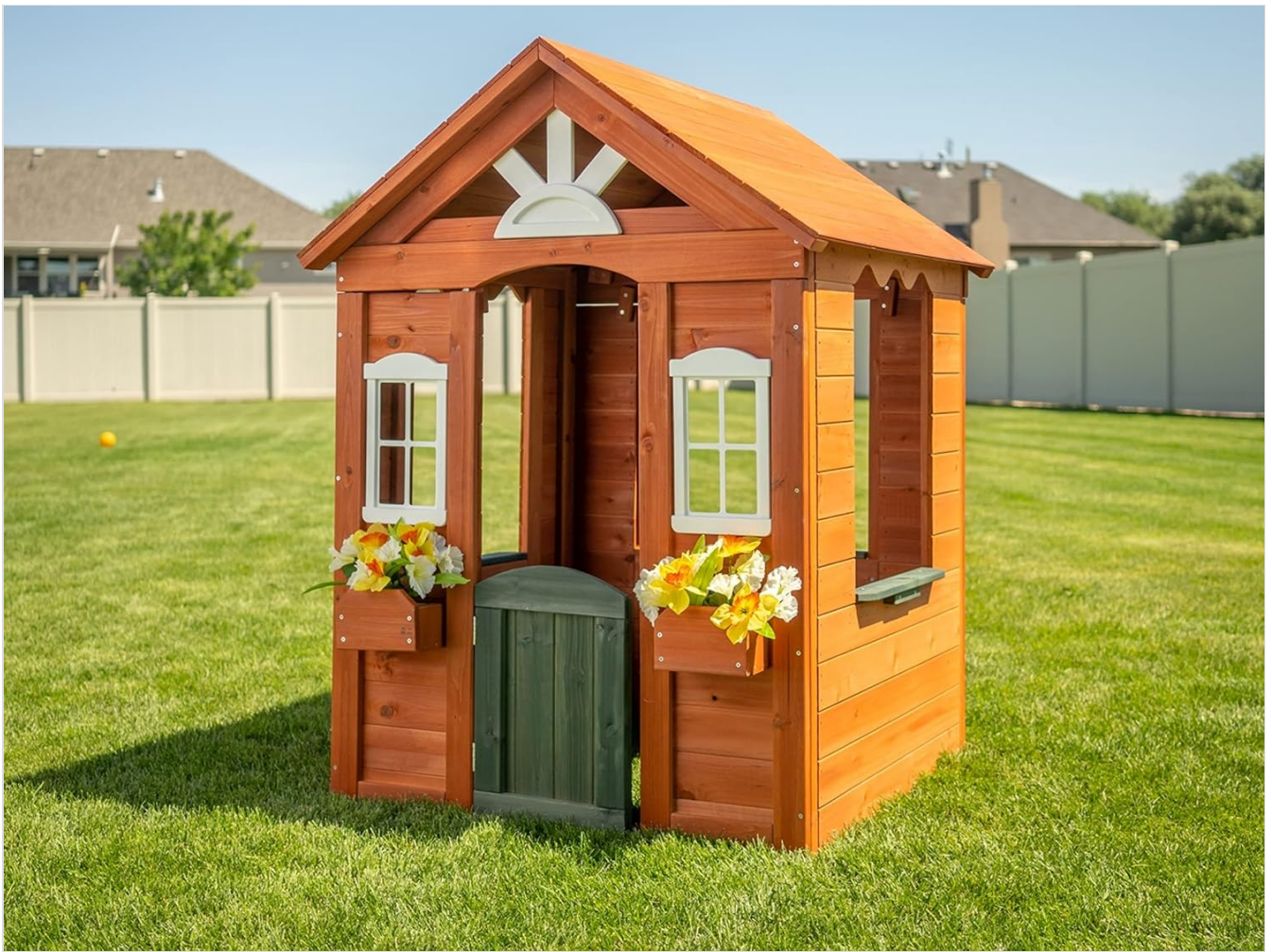
An overall view of the Sportspower Bellevue Wooden Outdoor Playhouse, showcasing its design and natural wood finish in a green backyard.