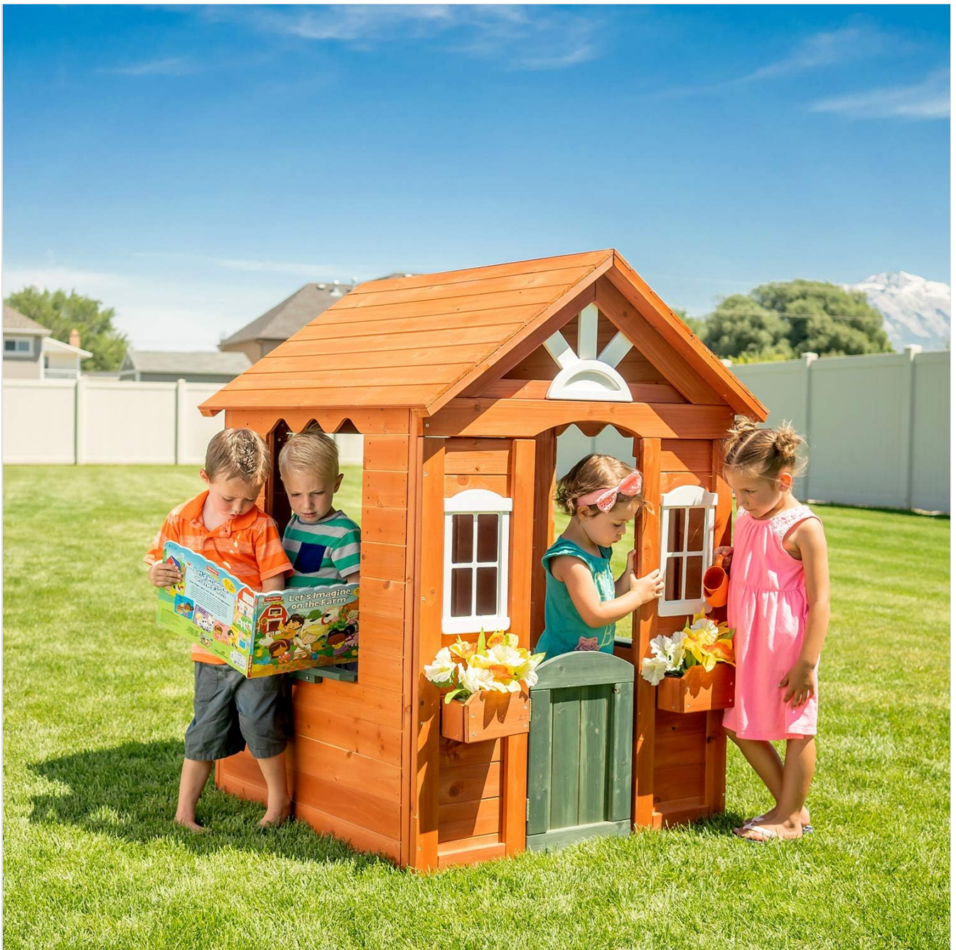
Multiple children engaging in play around the playhouse, demonstrating its interactive features and open design.