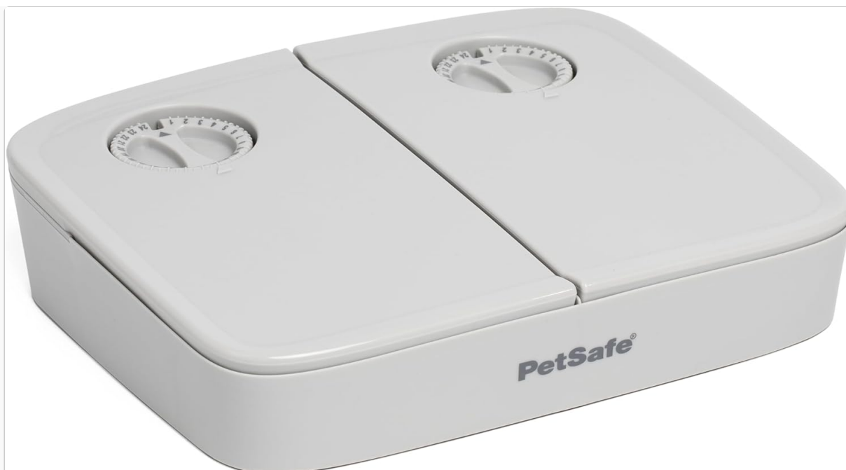
Image: Top-down view of the closed feeder, showing the two timer dials for setting meal times.

Your browser does not support the video tag.