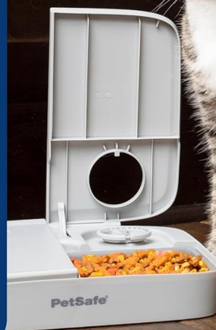
Image: A cat enjoying a meal from one of the feeder's open compartments.