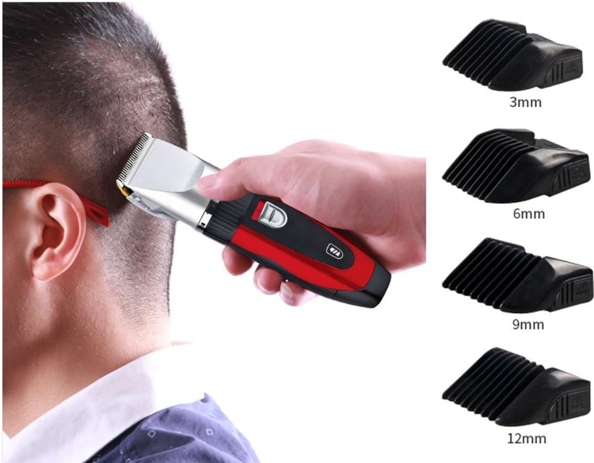
Image: The Surker hair clipper with its four guide combs. The image demonstrates how to attach and use the guide combs for different hair lengths.

Put on the preferred guide comb to achieve the satisfactory shape or length of the hair, (Guide comb specifications are as follows:3mm 6mm 9mm 12mm)