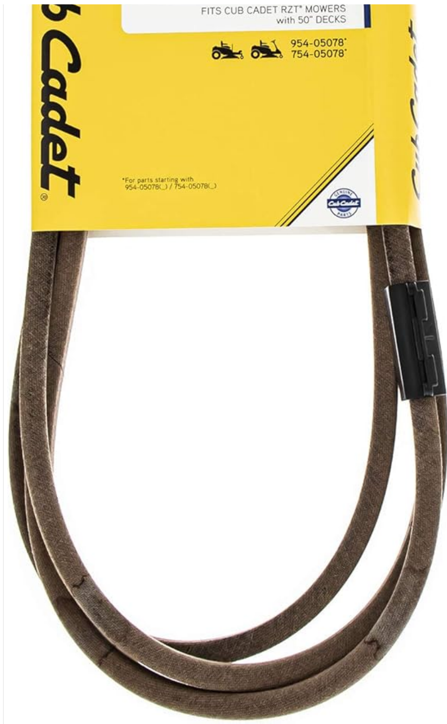
Image: The CUB CADET 50-inch Deck Drive Belt, still in its yellow and black packaging, showcasing the product's branding and key specifications.