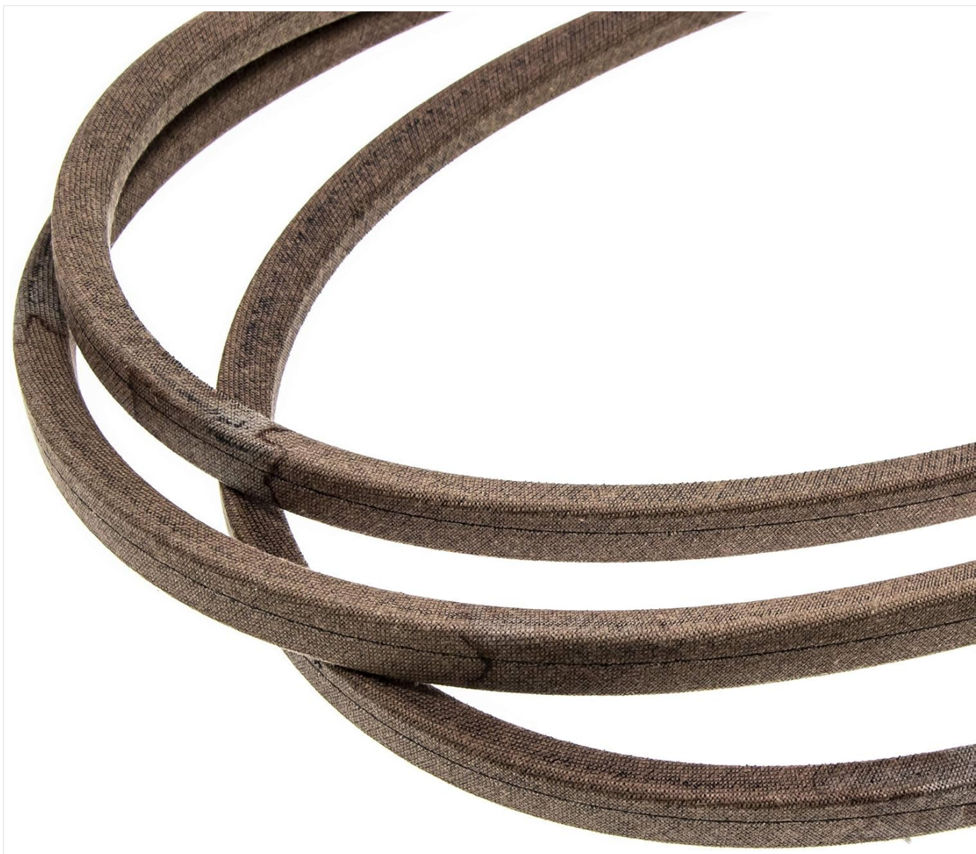
Image: A detailed close-up view of the CUB CADET deck belt's material, showing its woven texture and construction designed for durability and grip.