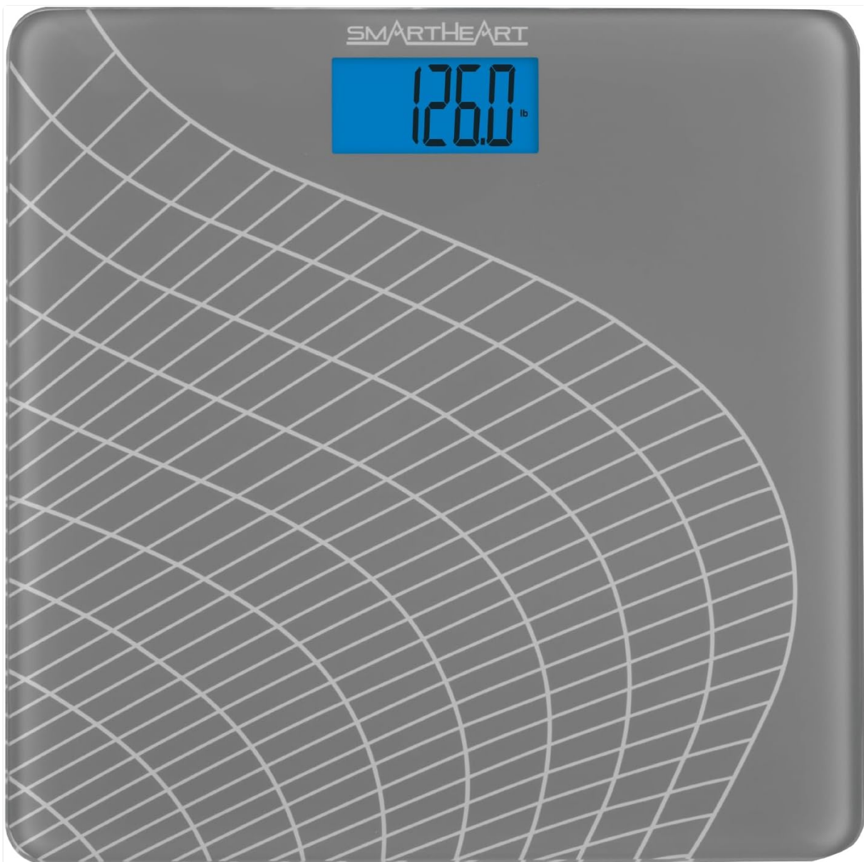
Image: The SmartHeart Veridian Digital Floor Scale, a gray square platform with a blue digital display showing a weight of 126.0 lbs.