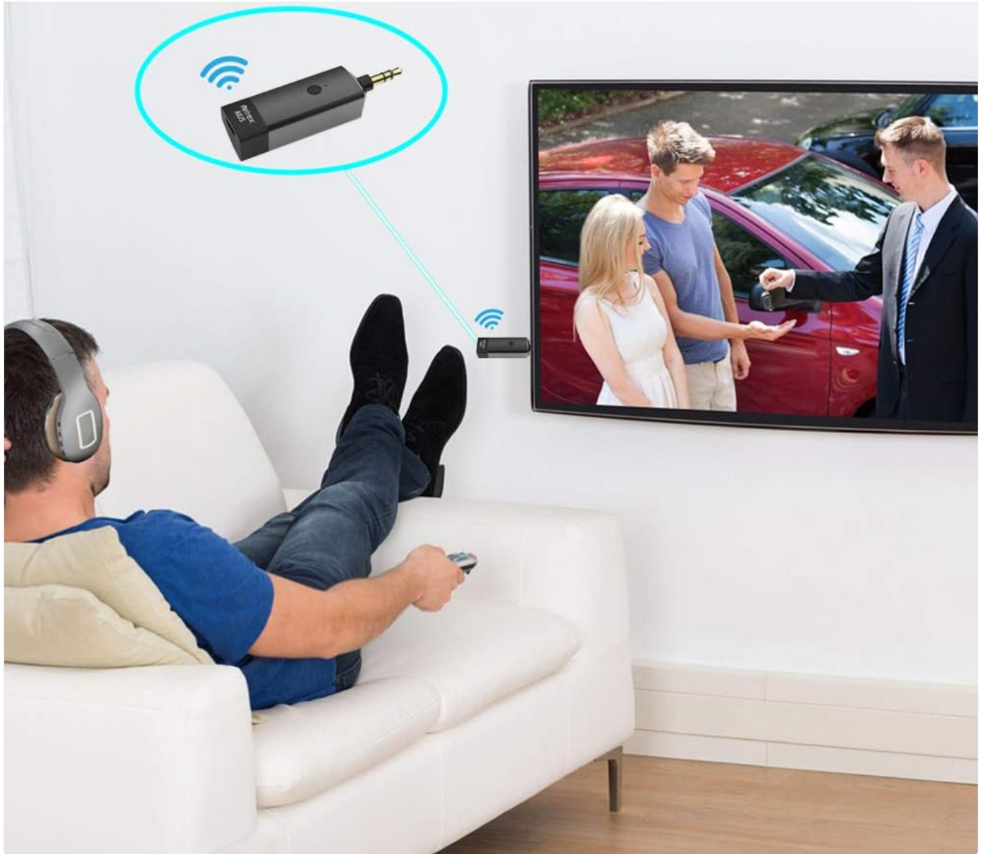
Figure 5: Enjoying audio wirelessly from a TV using the Airfrex AIUS.