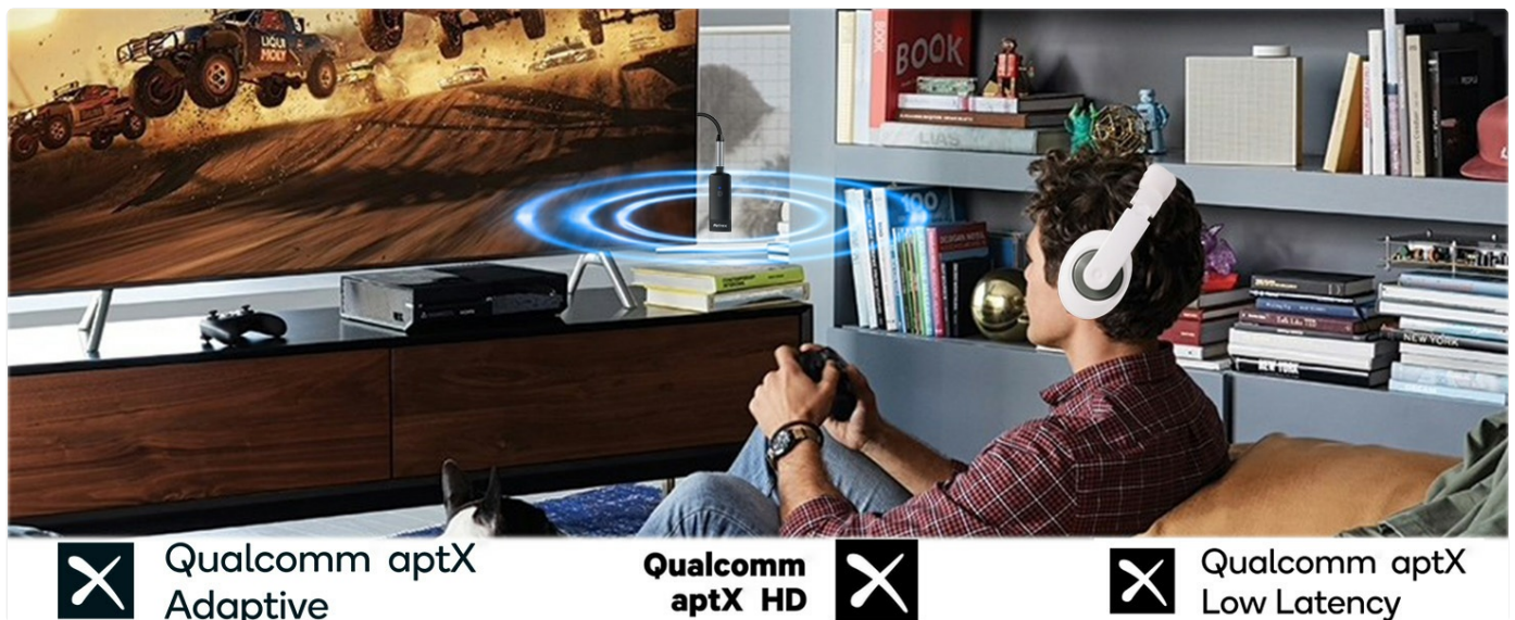
Figure 6: Using the Airfrex AIUS for wireless gaming audio.