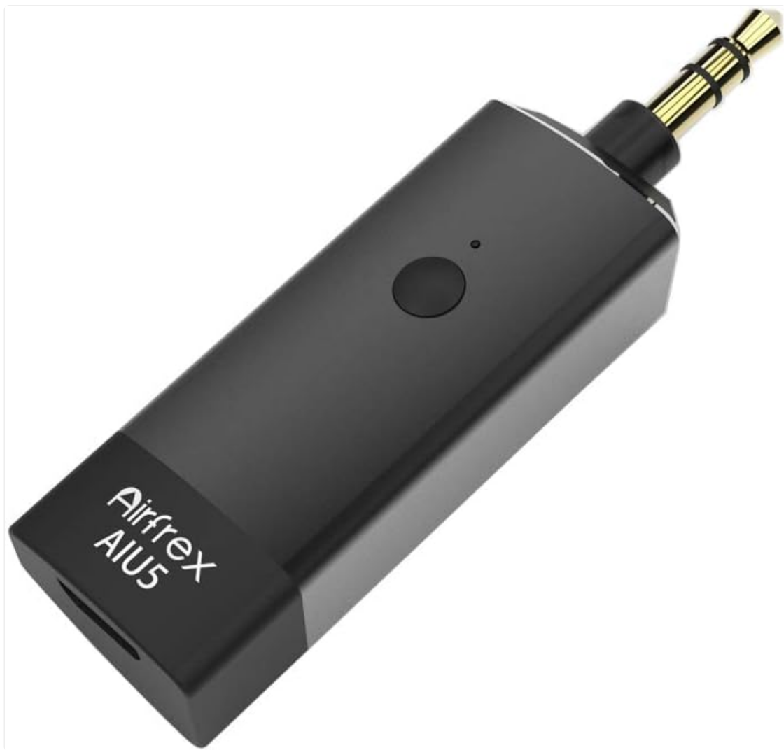
Figure 3: Front view of the Airfrex AIUS, highlighting the multi-function button and 3.5mm audio jack.