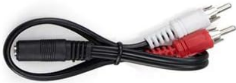
RCA to 3.5mm Converting Cable