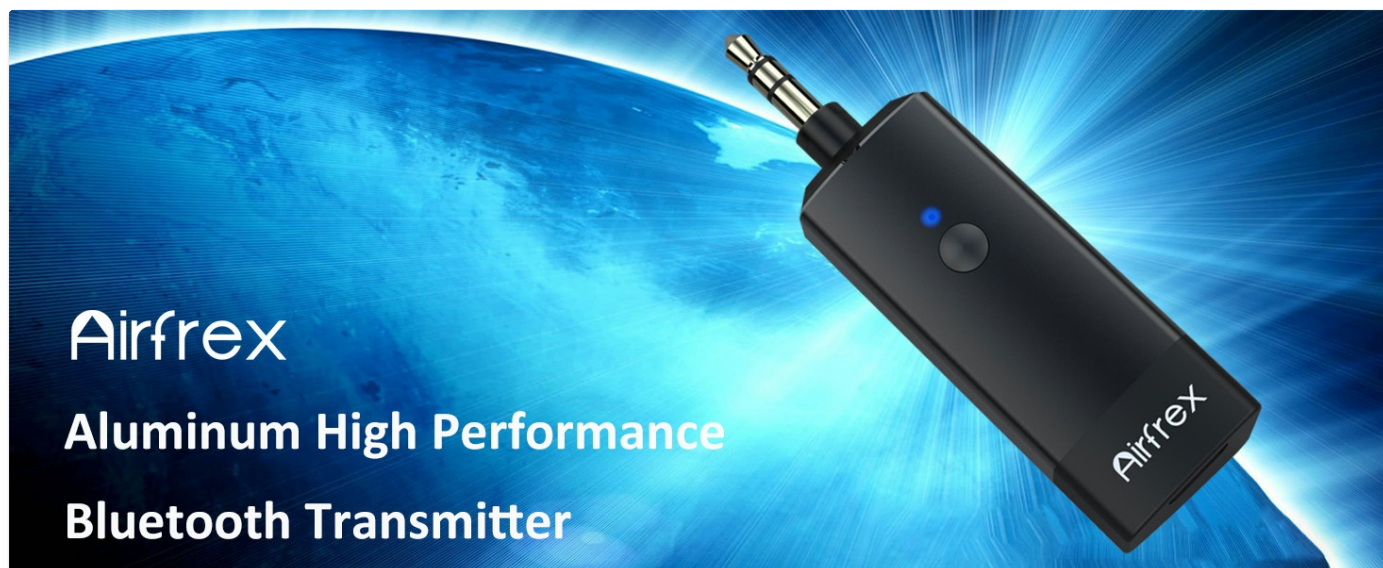
Figure 9: Enjoying wireless audio from fitness equipment using the Airfrex AIUS.