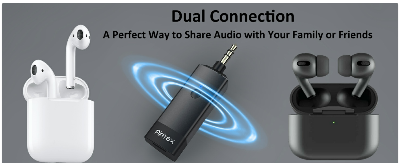
Figure 8: The Airfrex AIUS supports dual connection, allowing two Bluetooth headphones/speakers to connect simultaneously for shared listening.