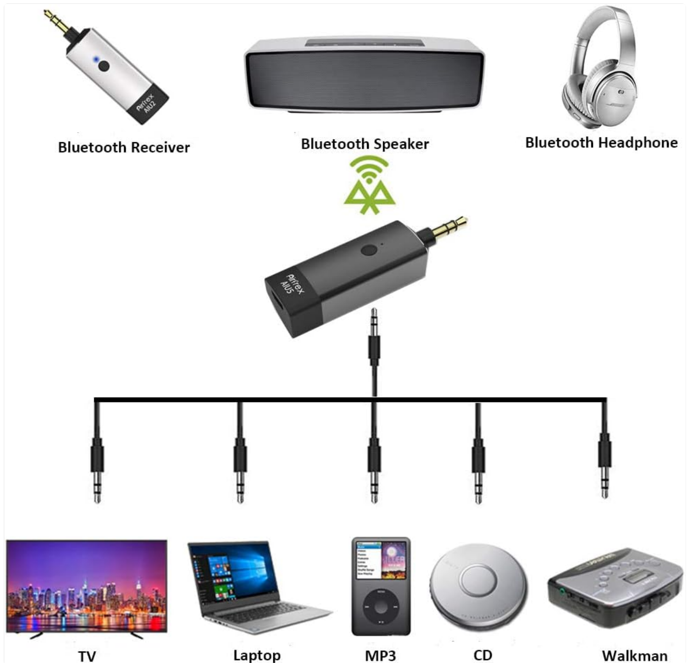
Figure 4: Connectivity options for the Airfrex AIUS with various audio devices.