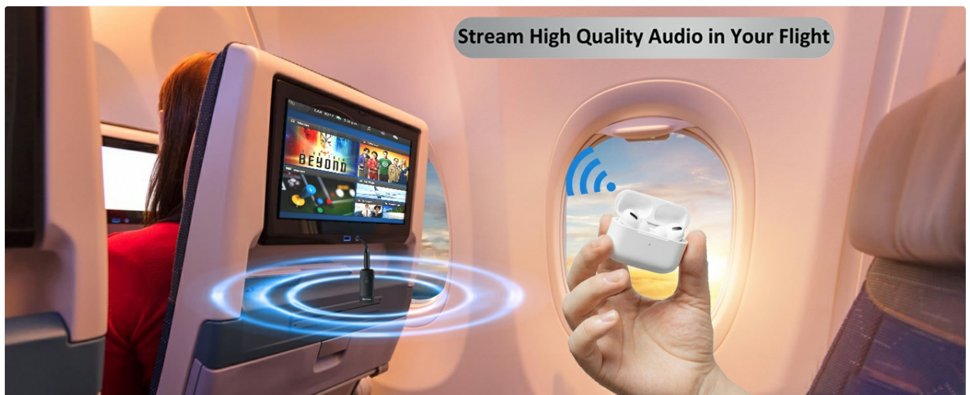
Figure 7: Streaming high-quality audio during travel with the Airfrex AIUS.