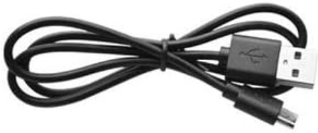
USB Charging Cable