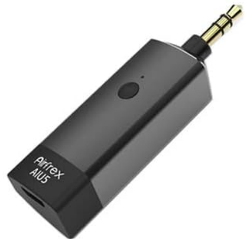
Bluetooth Transmitter ( Not Receiver)