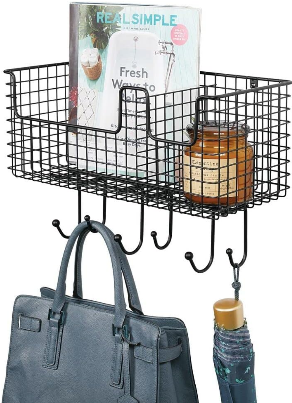
Image 1.1: Front view of the mDesign Metal Wire Farmhouse Wall Decor Storage Organizer Basket, showcasing its two basket sections and six hooks. A handbag and umbrella are shown hanging from the hooks, and a magazine and candle are in the basket.