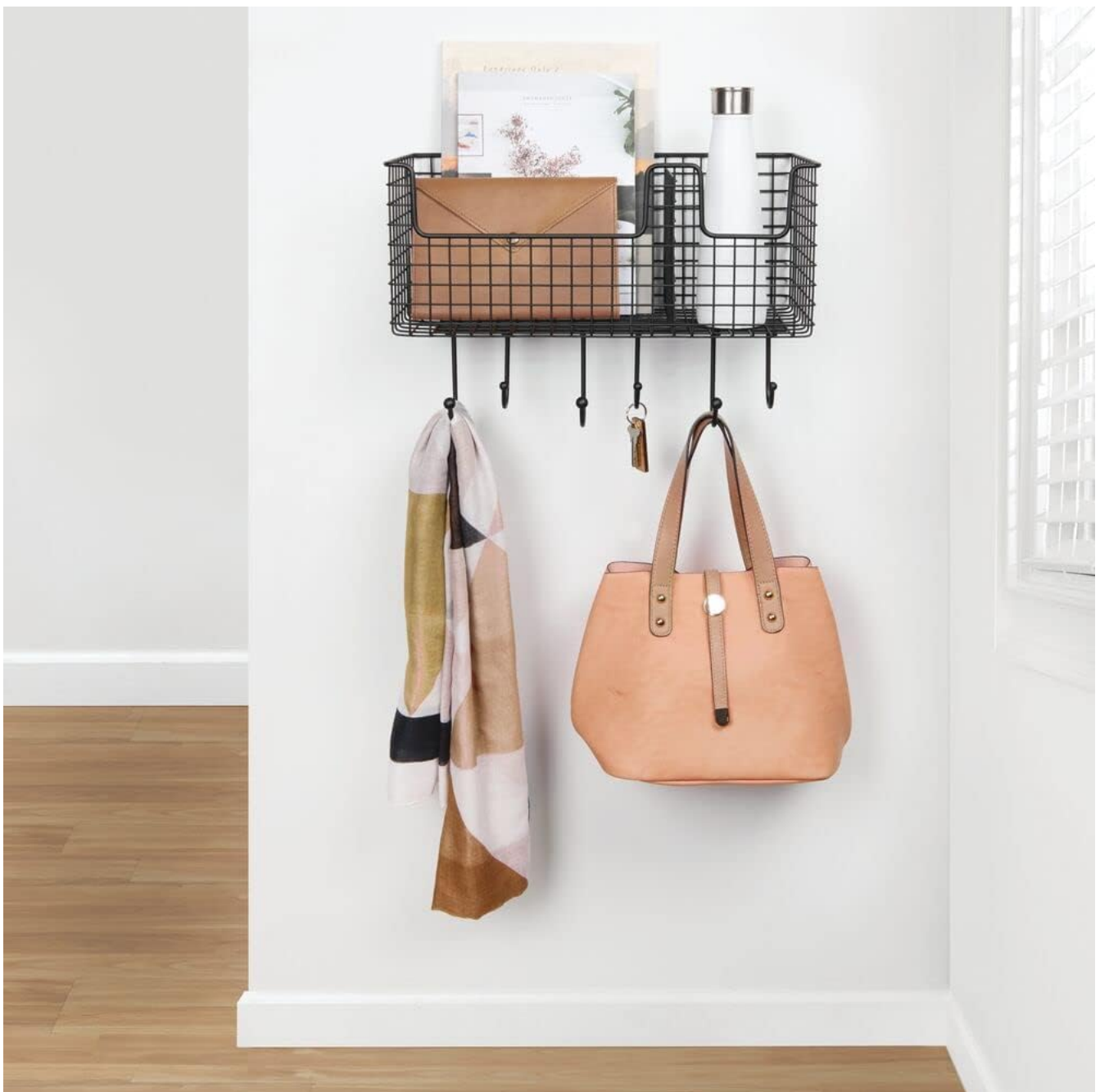
Image 4.1: The storage basket mounted in an entryway, holding mail and a water bottle in the basket, and a scarf and handbag on the hooks.