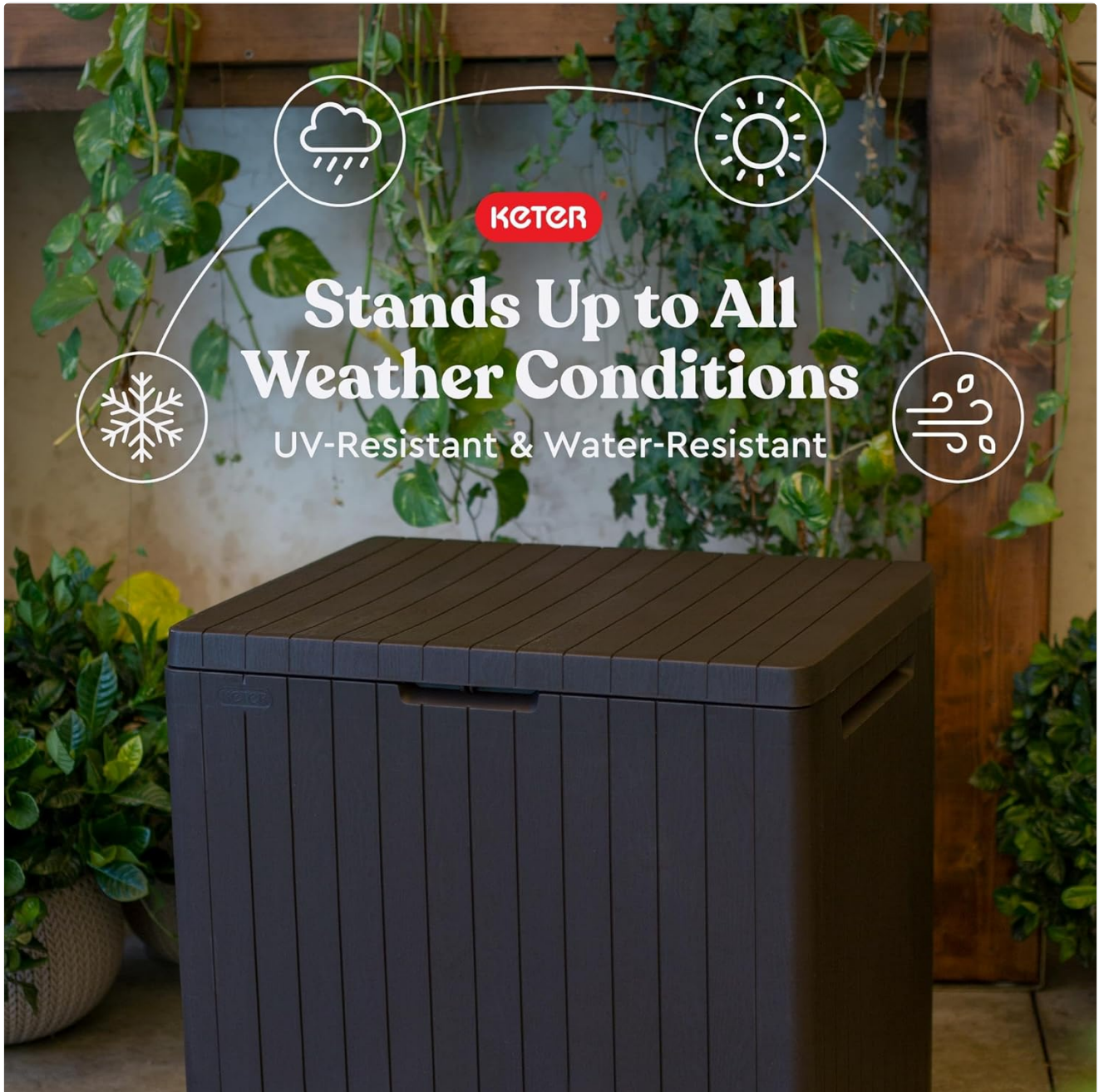
Image: This graphic illustrates the Keter City Box's ability to withstand all weather conditions, including rain, sun, snow, and wind, emphasizing its UV-resistant and water-resistant properties.