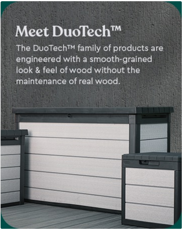
Image: This image emphasizes that the Keter deck boxes are crafted from UV-protected and weather-resistant resin, ensuring that stored items remain safe and dry from the elements.