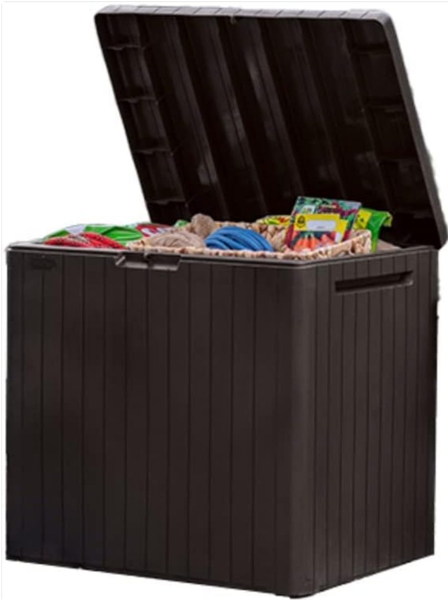
Image: The Keter City 30 Gallon Resin Outdoor Storage Box shown with its lid open, revealing various stored items such as gardening supplies and cushions. This highlights its practical storage capacity.