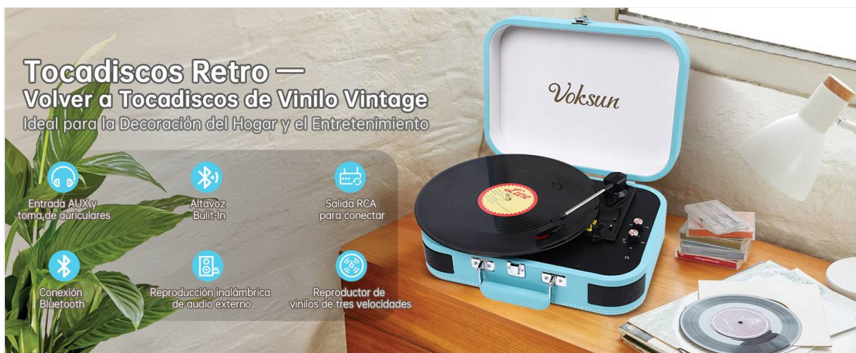
Image 1.1: VOKSUN S300 Portable Vintage Turntable in blue suitcase design.

Thank you for purchasing the VOKSUN S300 Portable Vintage Turntable. This device combines classic aesthetics with modern functionality, allowing you to enjoy your vinyl records and digital music. Please read this manual carefully before use to ensure proper operation and to maximize your listening experience. The VOKSUN S300 features a portable suitcase design, 3-speed playback, built-in stereo speakers, Bluetooth In/Out connectivity, USB playback, AUX input, and RCA output.