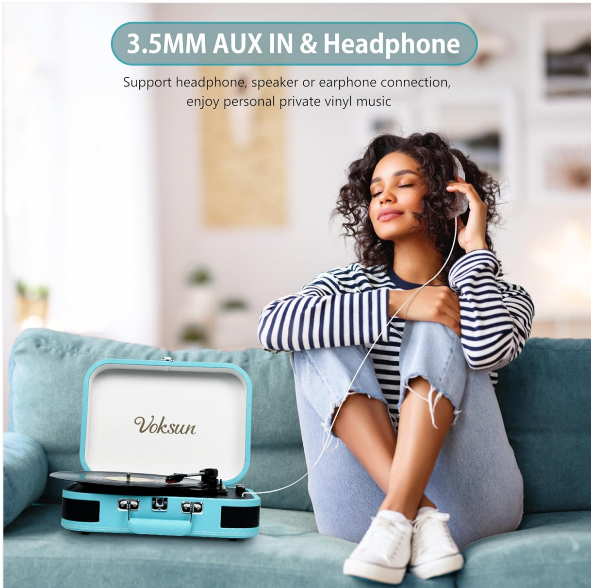
Image 4.3: A user enjoying private listening with headphones connected to the VOKSUN S300 via the 3.5mm AUX input. Connect external audio devices (e.g., MP3 player, smartphone) to the turntable using a 3.5mm audio cable (not included) plugged into the AUX IN port. Rotate the MODE knob to select AUX mode. Audio from the connected device will play through the turntable's speakers.

Support headphone, speaker or earphone connection, enjoy personal private vinyl music