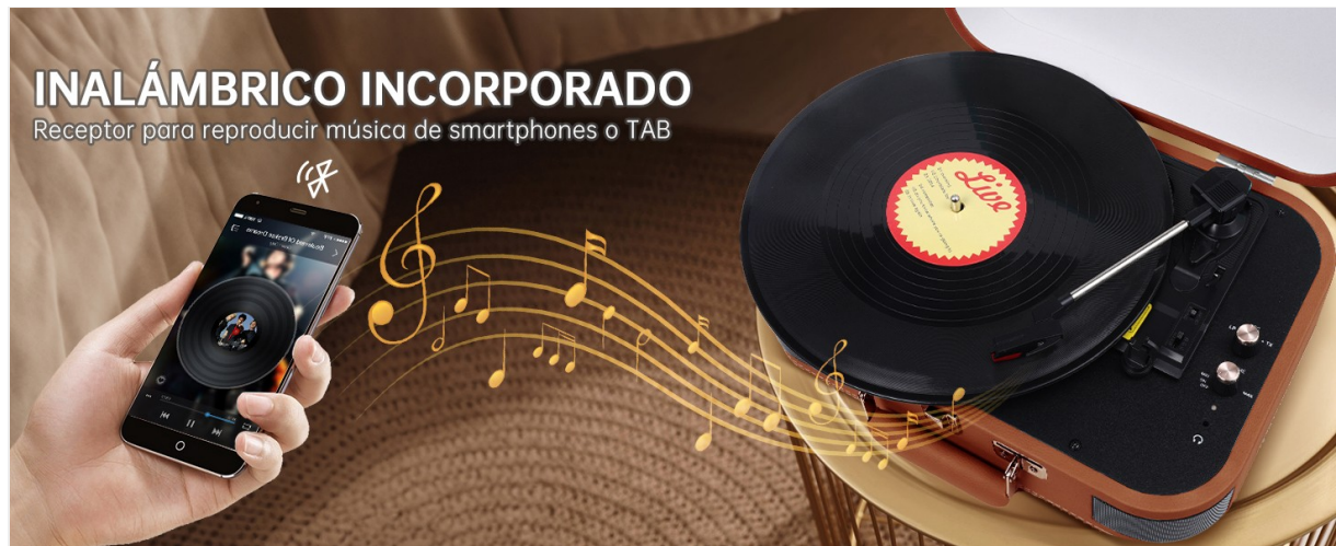
Image 4.2: The VOKSUN S300 turntable demonstrating wireless Bluetooth connectivity with a smartphone.