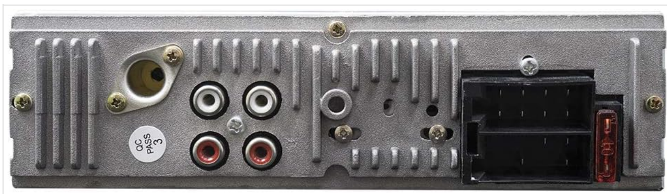
Image: Rear panel of the PNI Clementine 8524BT, displaying power, speaker, and RCA connections.