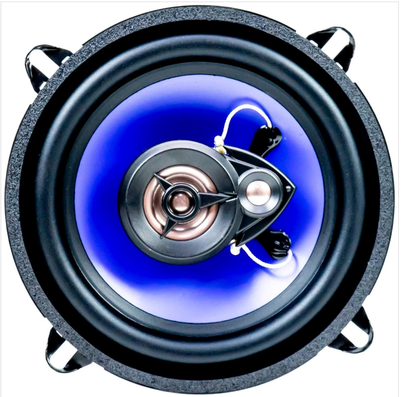
Image: Front view of the PNI HiFi500 speaker, showing the cone and tweeter.