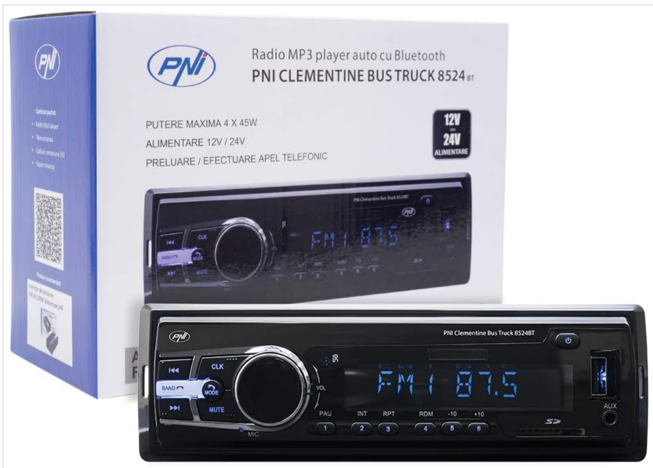
Image: Front panel of the PNI Clementine 8524BT, showing display, buttons, and ports.