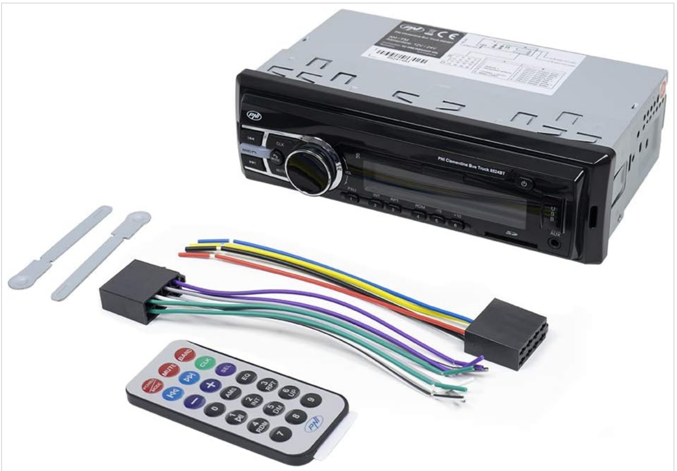
Image: PNi Clementine 8524BT Car MP3 Player with remote control, wiring harness, and mounting accessories.