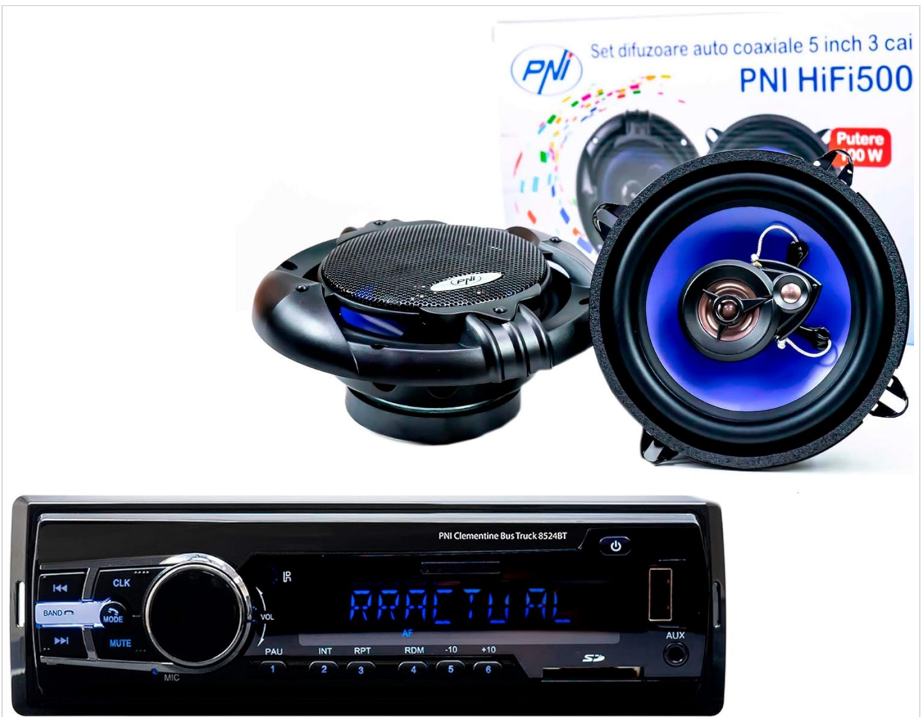
Image: The PNi Clementine 8524BT Car MP3 Player and a pair of PNi HiFi500 Coaxial Car Speakers.