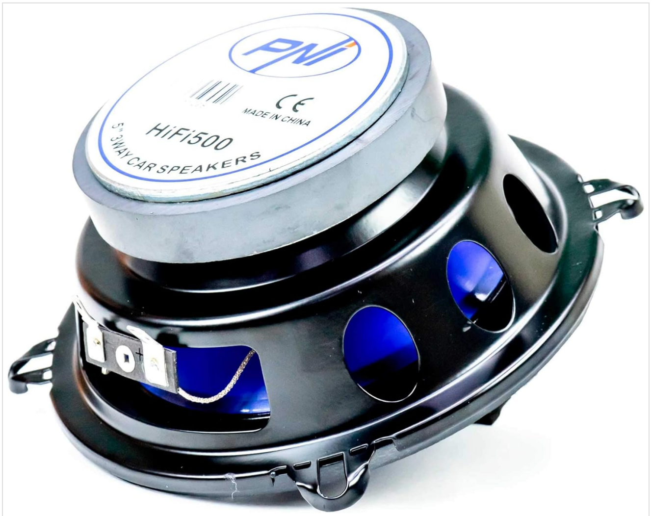
Image: Angled rear view of the PNI HiFi500 speaker, showing the magnet and terminals.