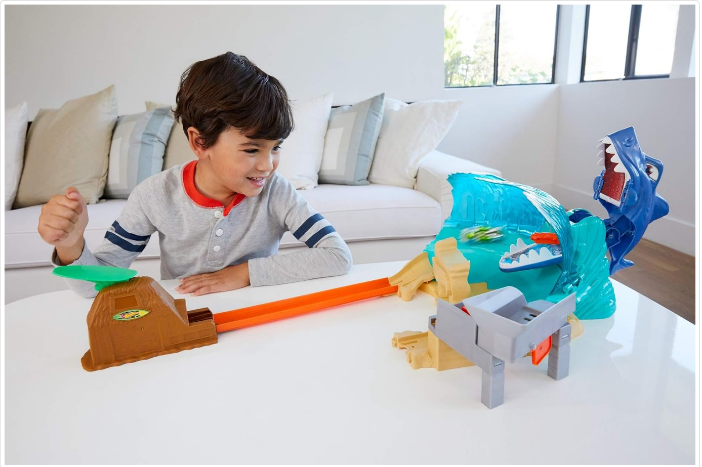
Image: Detail of the scoring stand, showing positions for cars to land and accumulate points.