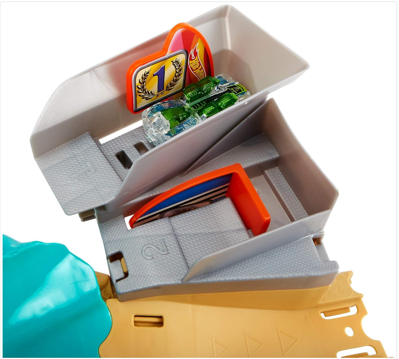
Image: A Hot Wheels car caught within the shark's open jaws, illustrating the playset's action feature.