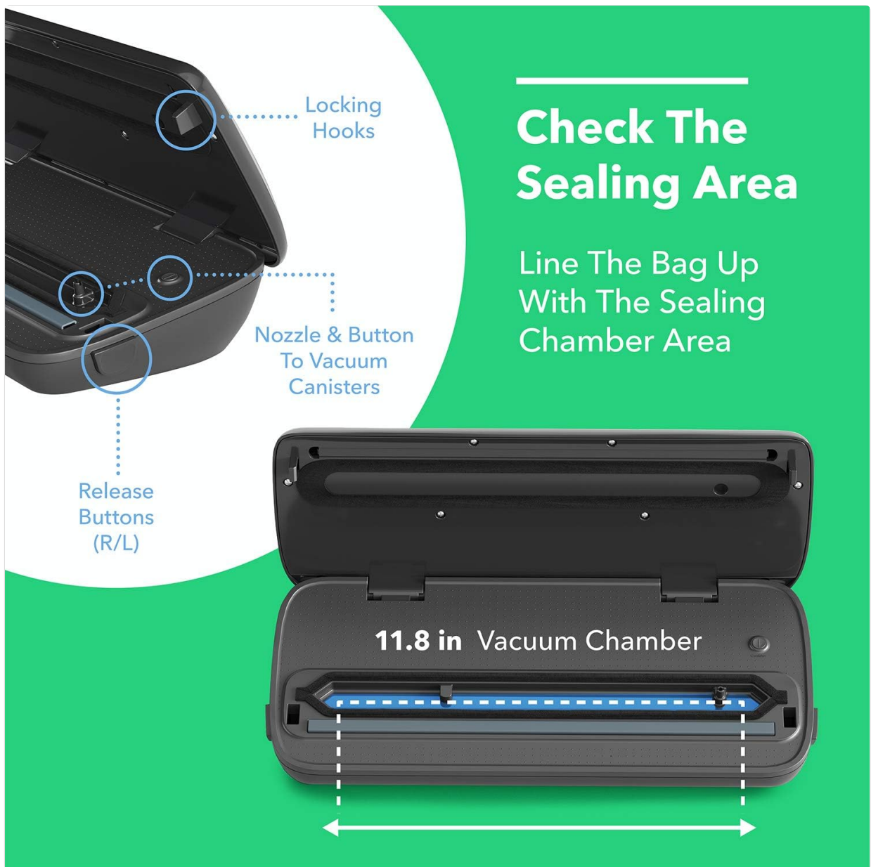
Diagram showing the locking hooks, nozzle and button for vacuum canisters, and release buttons (R/L) on the Vremi Vacuum Sealer. The vacuum chamber measures 11.8 inches.