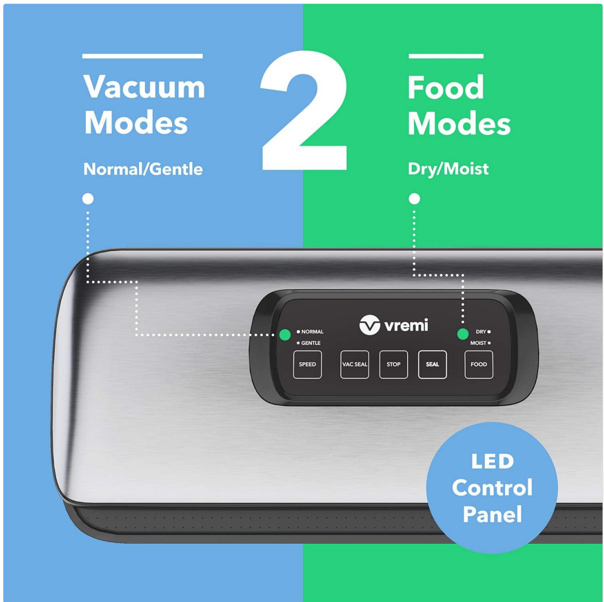
The Vremi Vacuum Sealer features an intuitive LED control panel with buttons for various functions like Normal/Gentle speed, Dry/Moist food modes, Vac Seal, Stop, and Seal.