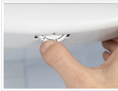
Image: A hand adjusting the temperature control dial inside the refrigerator compartment.