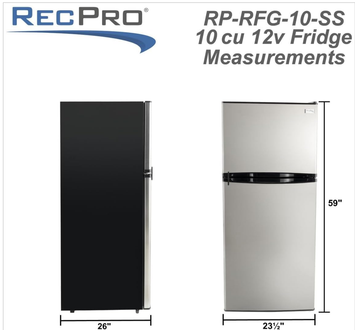
Image: Detailed dimensions of the RecPro 10 Cu Ft 12V RV Refrigerator, showing its height, width, and depth for proper installation planning.