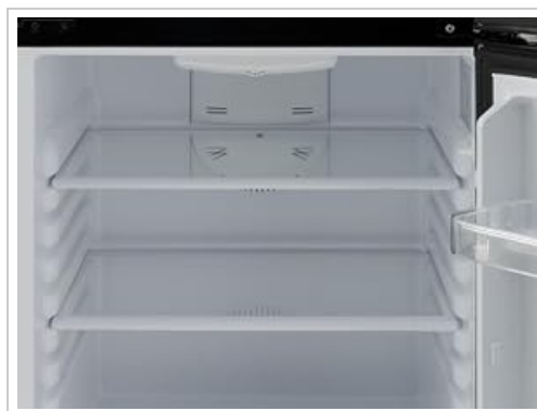
Image: The interior of the refrigerator with adjustable glass shelves, demonstrating customizable storage options.