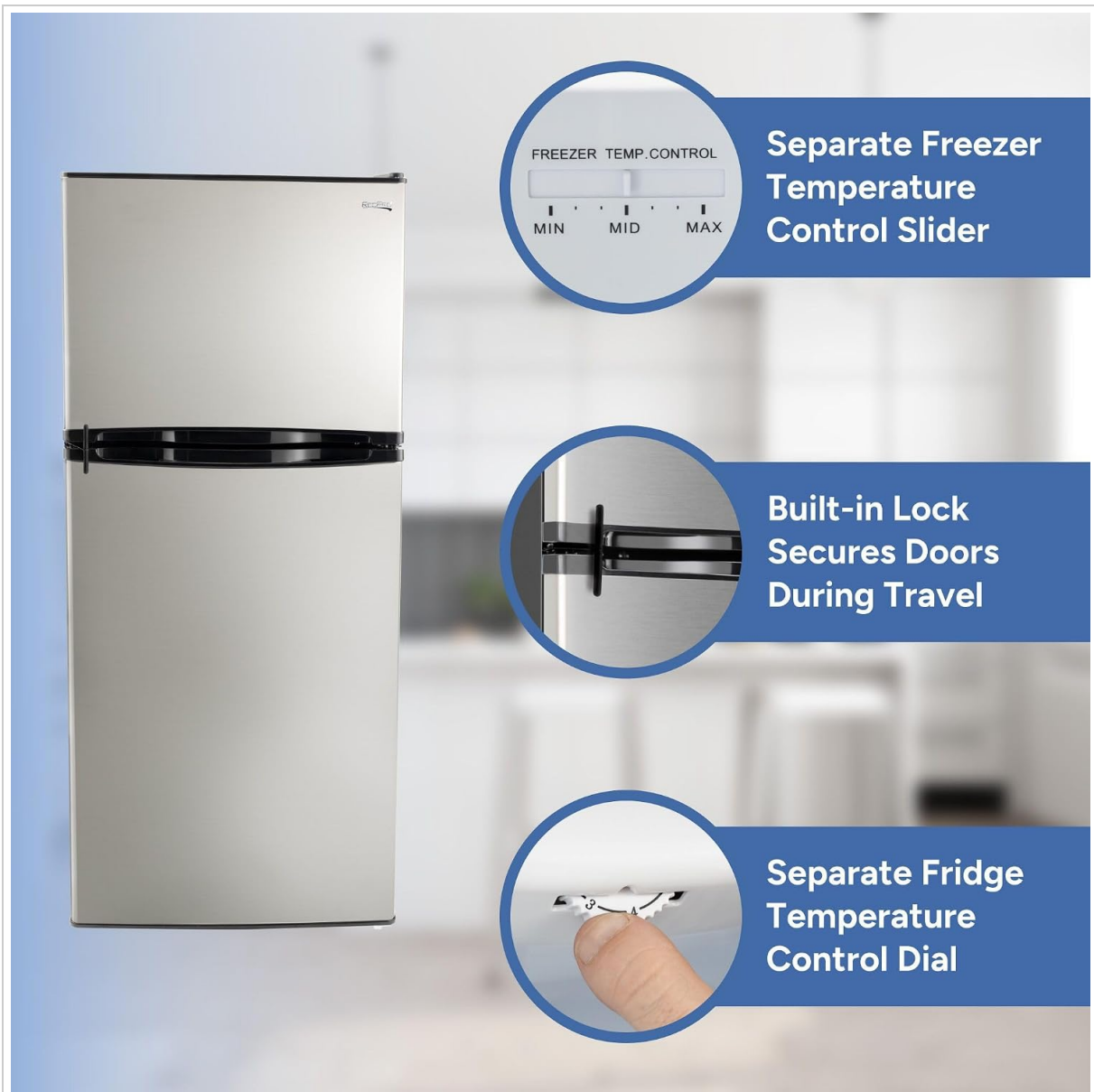
Image: The RecPro 10 Cu Ft 12V RV Refrigerator with callouts indicating the separate freezer temperature control slider, built-in door lock, and separate fridge temperature control dial.