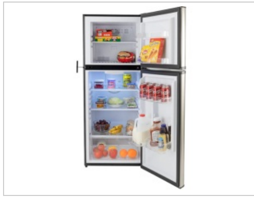
Image: The refrigerator interior, fully stocked with various food and beverage items, showcasing its storage capacity.