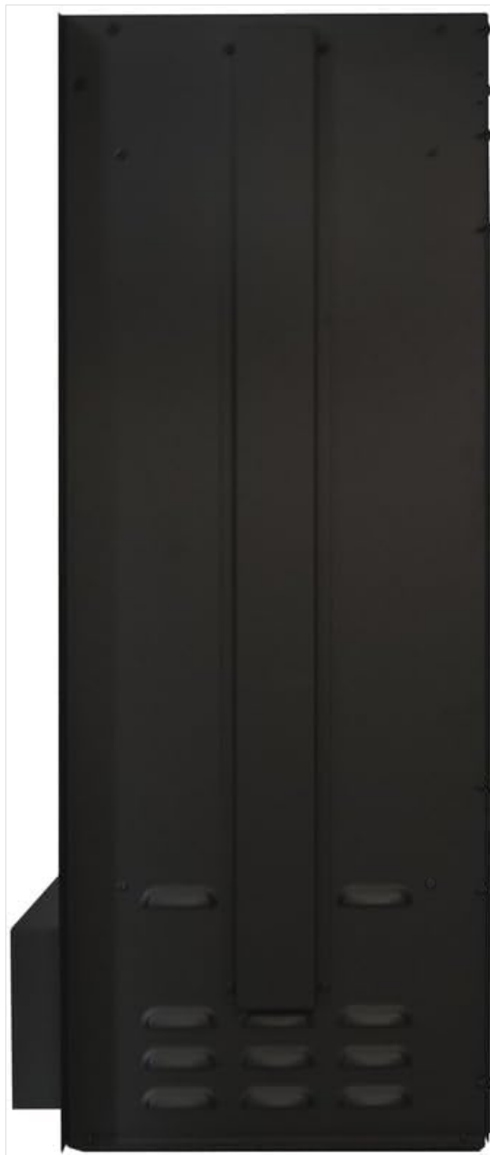
Figure 4: Side profile of the fireplace insert, illustrating its compact depth and rear ventilation features.