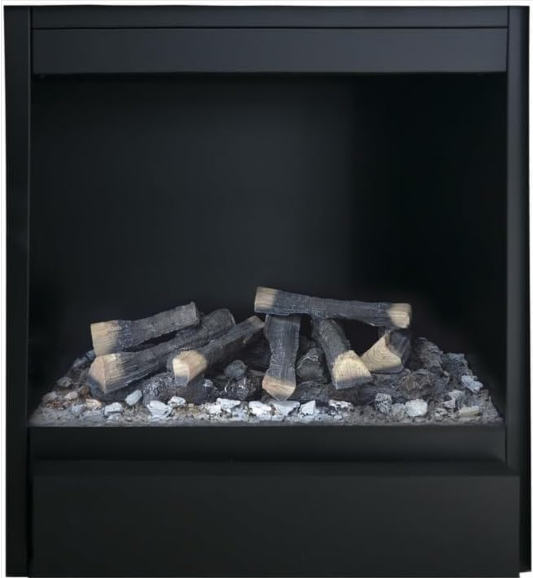
Figure 6: Visual representation of key features: remote control operation, heating capability, water vapor flame effect, and plug-and-play installation.

This model utilizes water vapor to create a realistic flame effect. The water tank provides approximately 7-8 hours of operation. Ensure the water tank is filled for optimal flame realism.