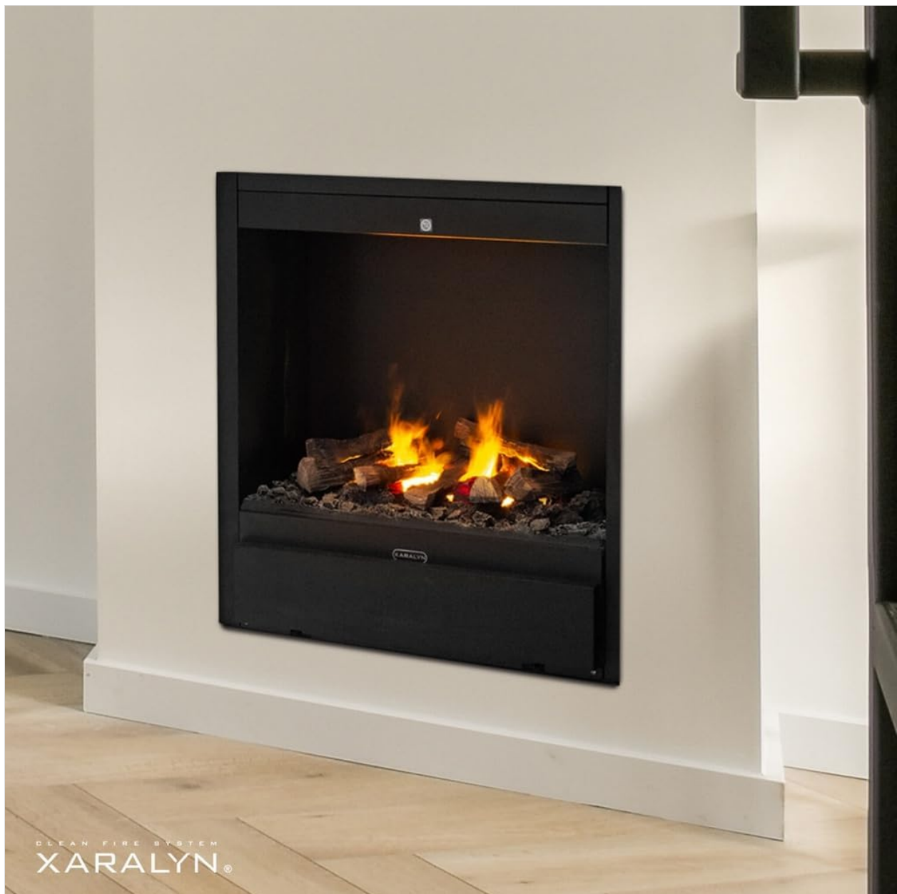
Figure 2: Example of the fireplace insert installed within a wall niche, demonstrating integrated placement.