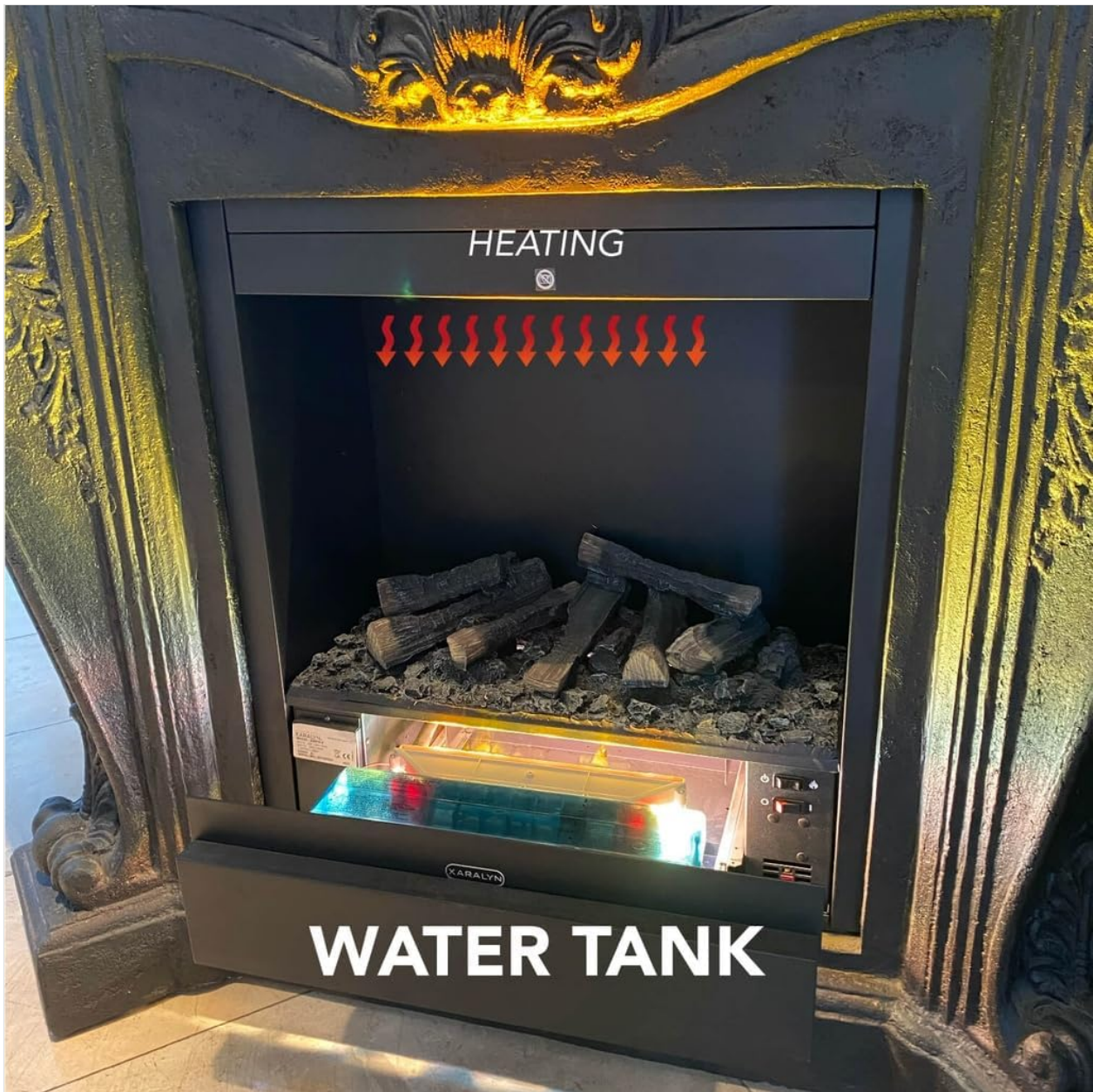
Figure 7: The fireplace insert with the lower panel open, revealing the water tank for refilling and indicating the heating element location.