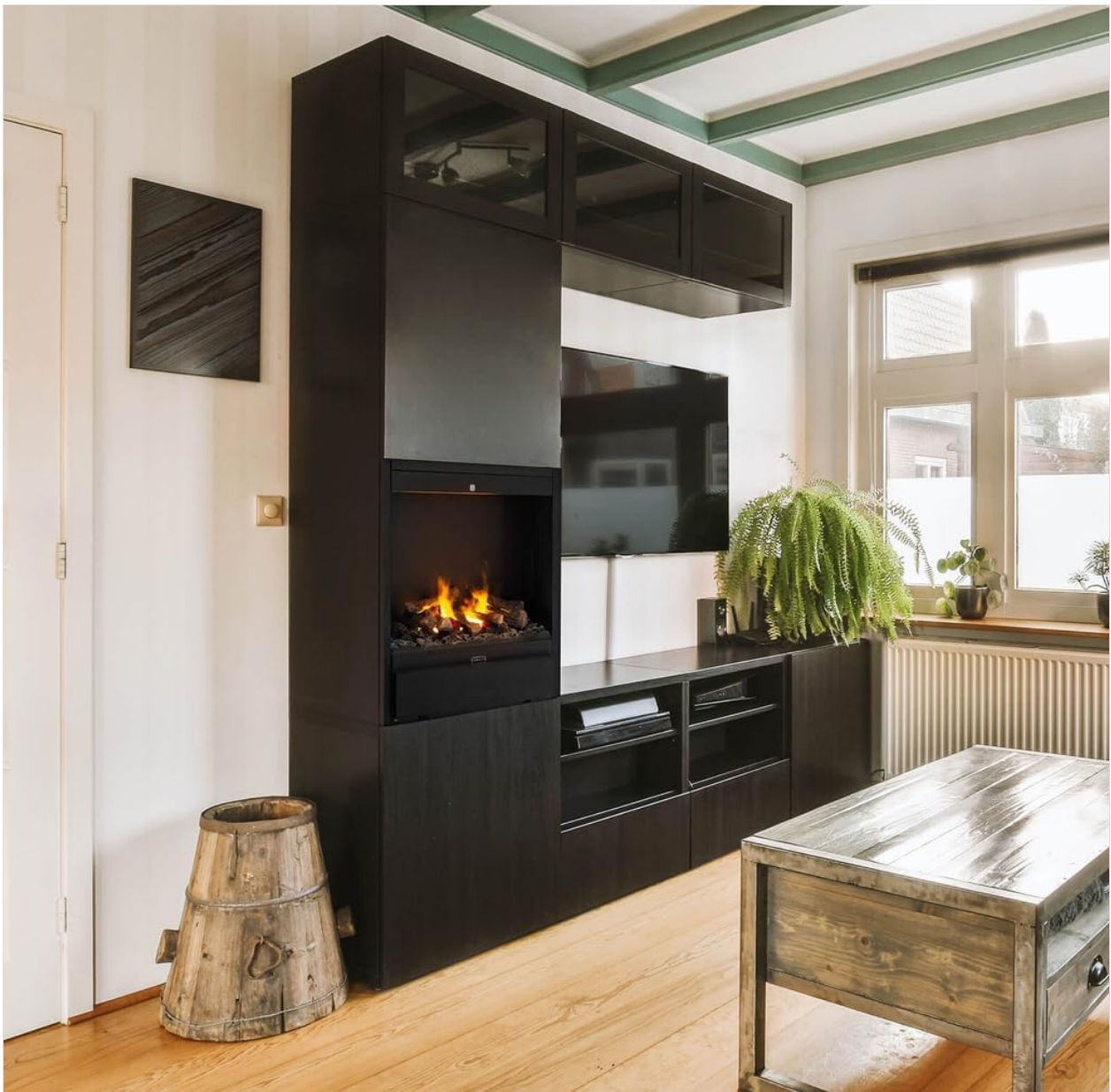
Figure 3: The fireplace insert integrated into a contemporary black cabinet, showcasing a furniture-style installation.