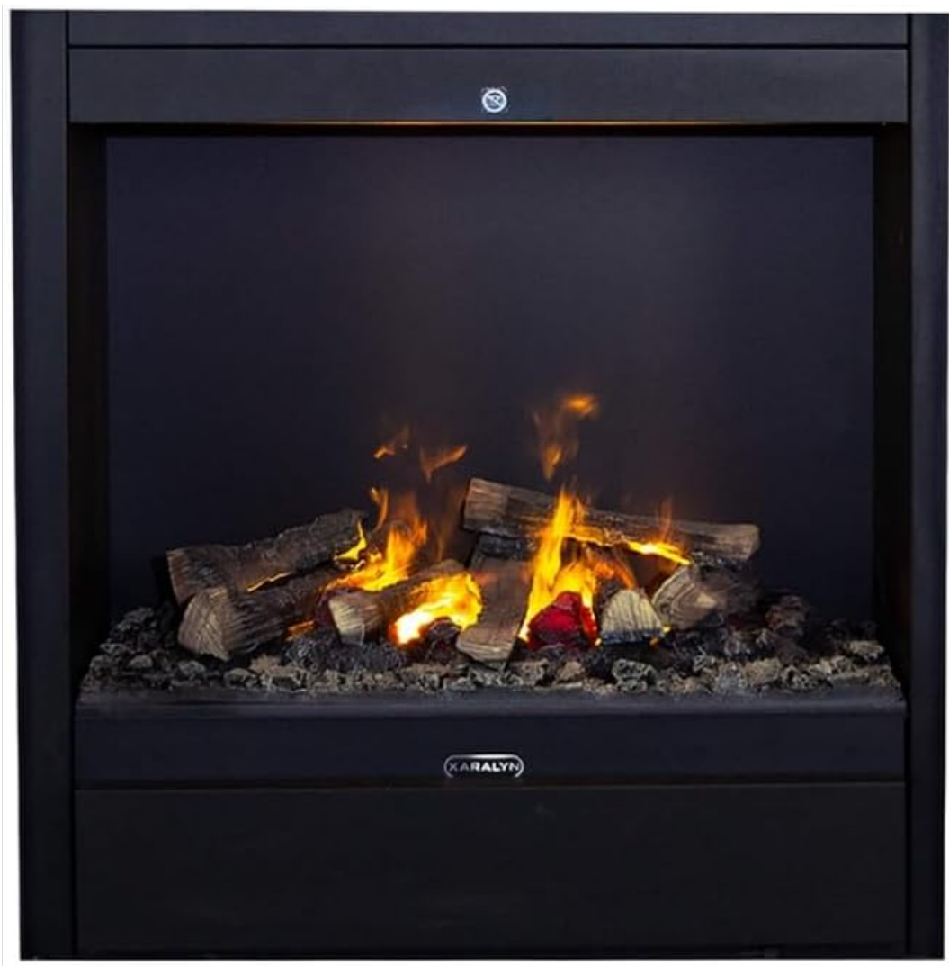
Figure 1: Front view of the Xaralyn Albany ECO ABN15E Electric Fireplace Insert, showcasing the flame effect and decorative logs.