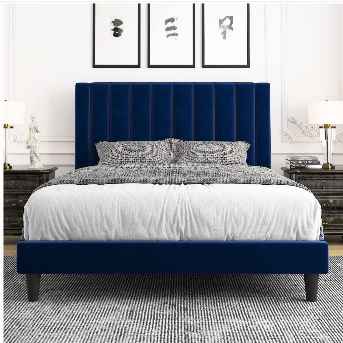
A fully assembled Allewie Queen Platform Bed Frame in navy blue velvet, featuring a vertical channel tufted headboard, shown in a bedroom setting.