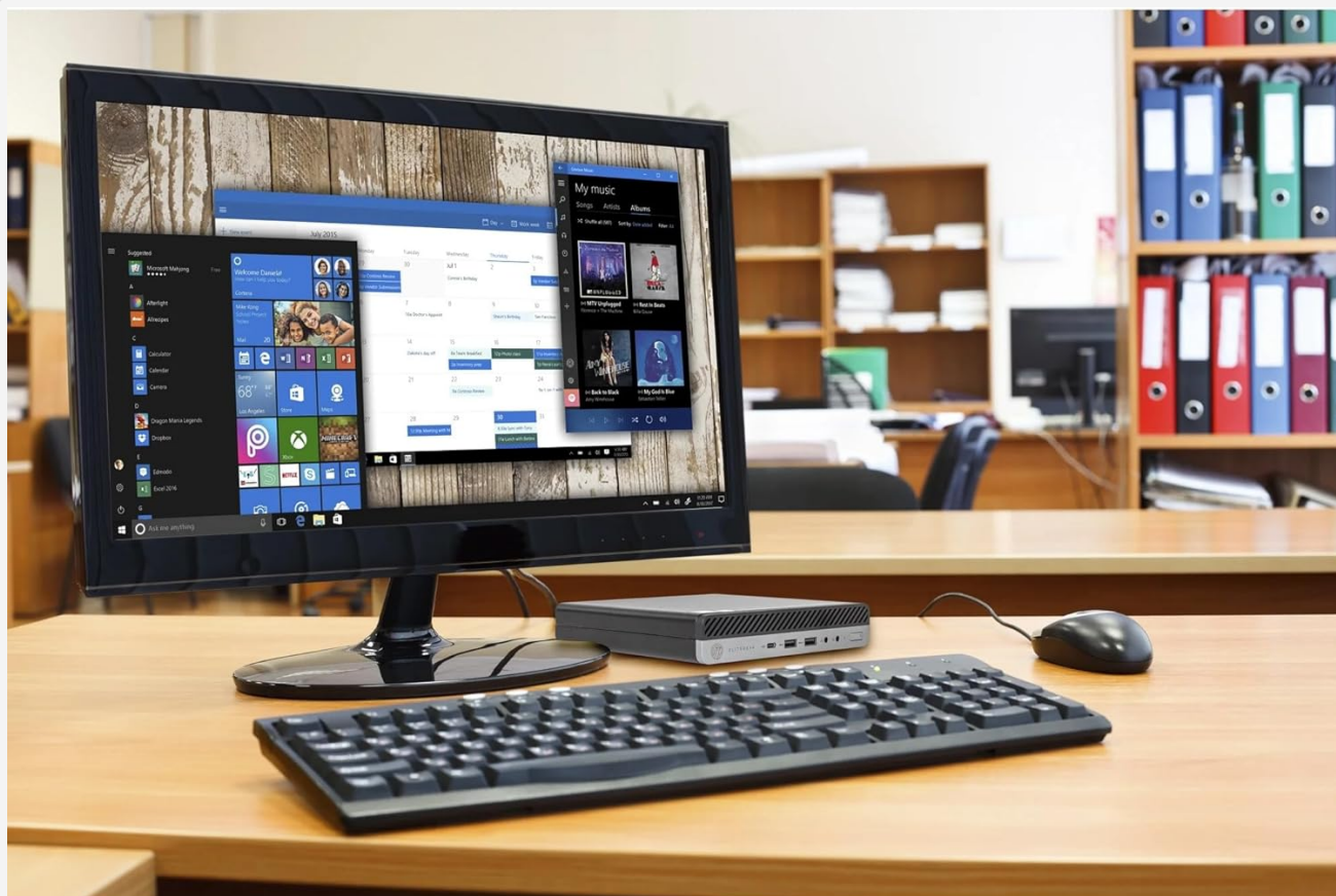
Image: A complete desktop setup featuring the HP EliteDesk 800 G4 Mini PC, monitor, keyboard, and mouse.