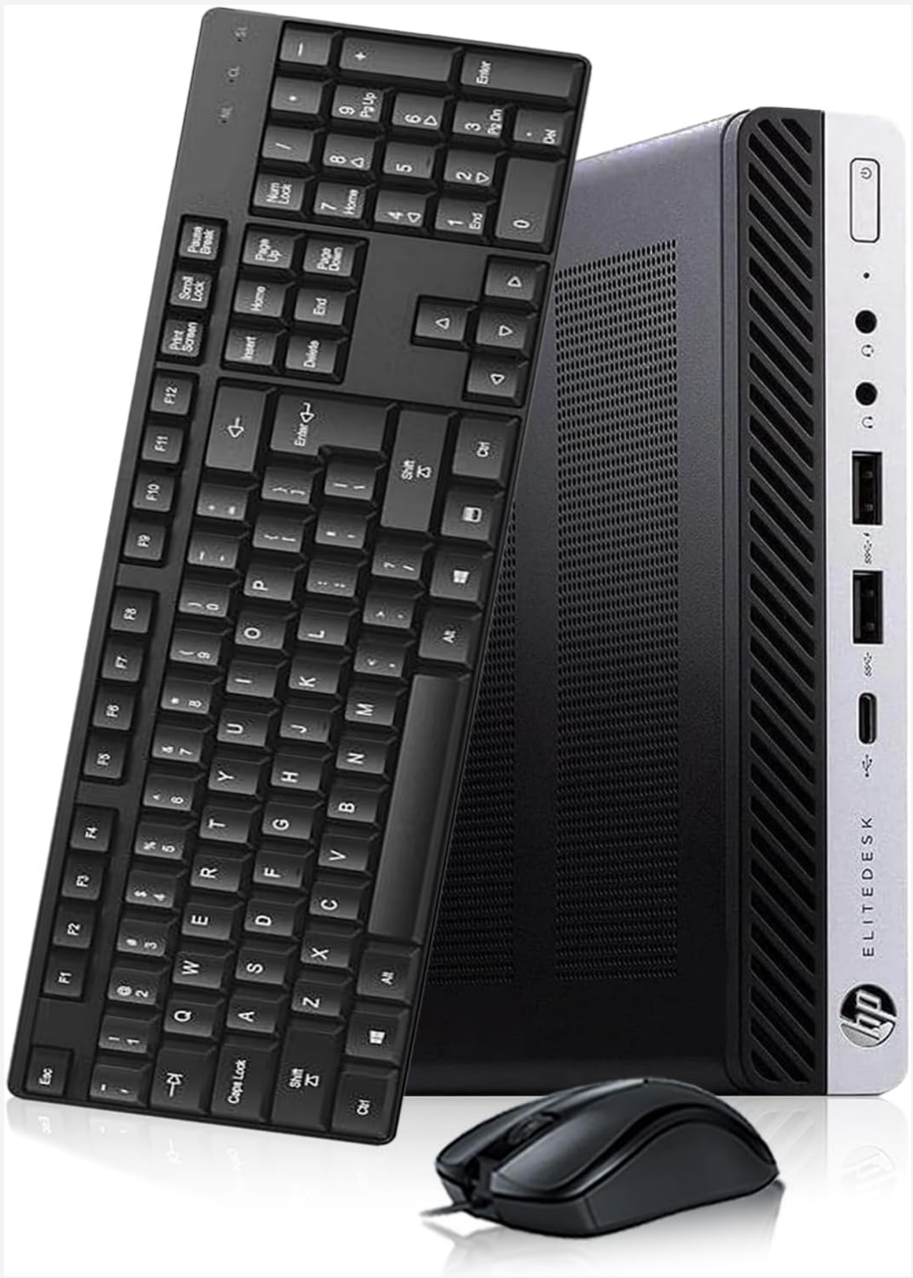
Image: The HP EliteDesk 800 G4 Mini PC shown alongside its included keyboard and mouse.