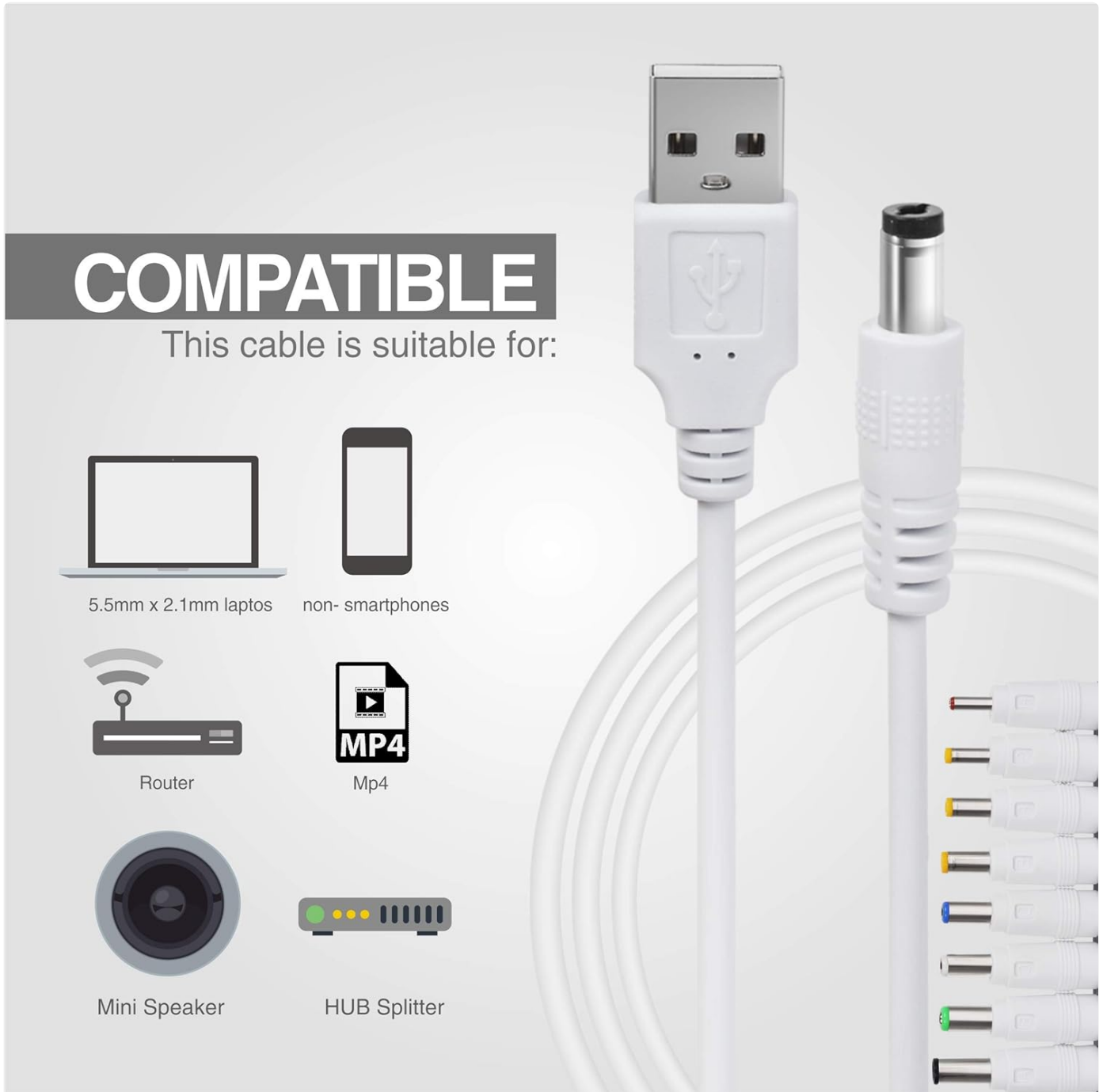
Image: A visual representation of the 8 interchangeable DC plugs with their respective dimensions (e.g., 3.5*1.35mm, 4.0*1.7mm, etc.).

Note: This DC cable is not compatible with HP, Acer laptops, and some other devices that require higher voltage or specific proprietary connectors. Always check your device's power requirements.