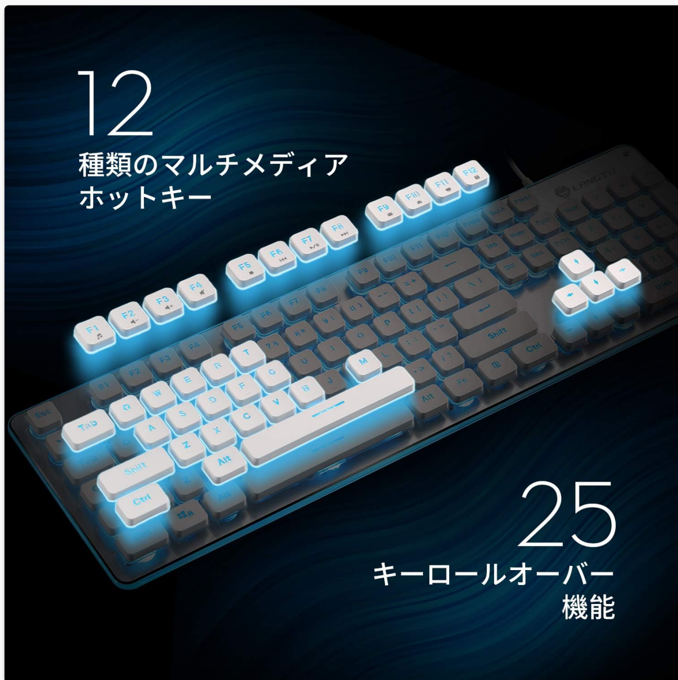
Image: This image highlights the 12 multimedia hotkeys (F1-F12) and the 25-key rollover function of the LANGTU KB-L2-WB keyboard, demonstrating its capabilities for efficient control and simultaneous key presses.

The keyboard features 25-key anti-ghosting, which means up to 25 keys can be pressed simultaneously and registered accurately. This is particularly beneficial for fast-paced gaming where multiple key presses are common.