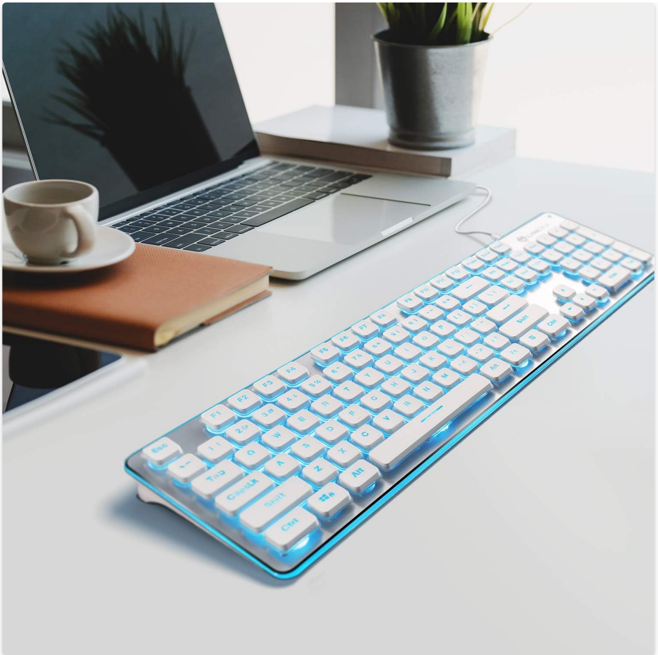
Image: The LANGTU KB-L2-WB Gaming Keyboard illuminated with blue LED backlight, positioned on a desk next to a laptop and a coffee cup, showcasing its sleek design in a typical workspace setup.