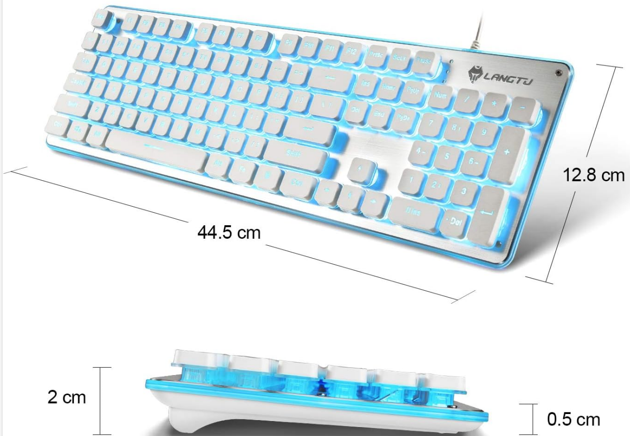
Image: A diagram illustrating the physical dimensions of the LANGTU KB-L2-WB keyboard, showing its length (44.5 cm), width (12.8 cm), and height (2 cm, with a keycap height of 0.5 cm).