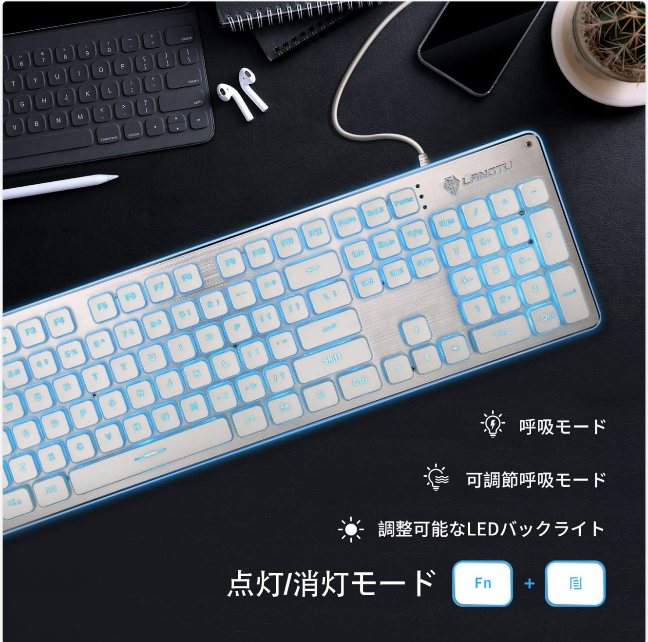
Image: A close-up view of the LANGTU KB-L2-WB keyboard, illustrating the various LED backlight modes such as 'Breathing Mode' and 'Adjustable Breathing Mode', along with the 'Fn' key combination for turning the light on or off.