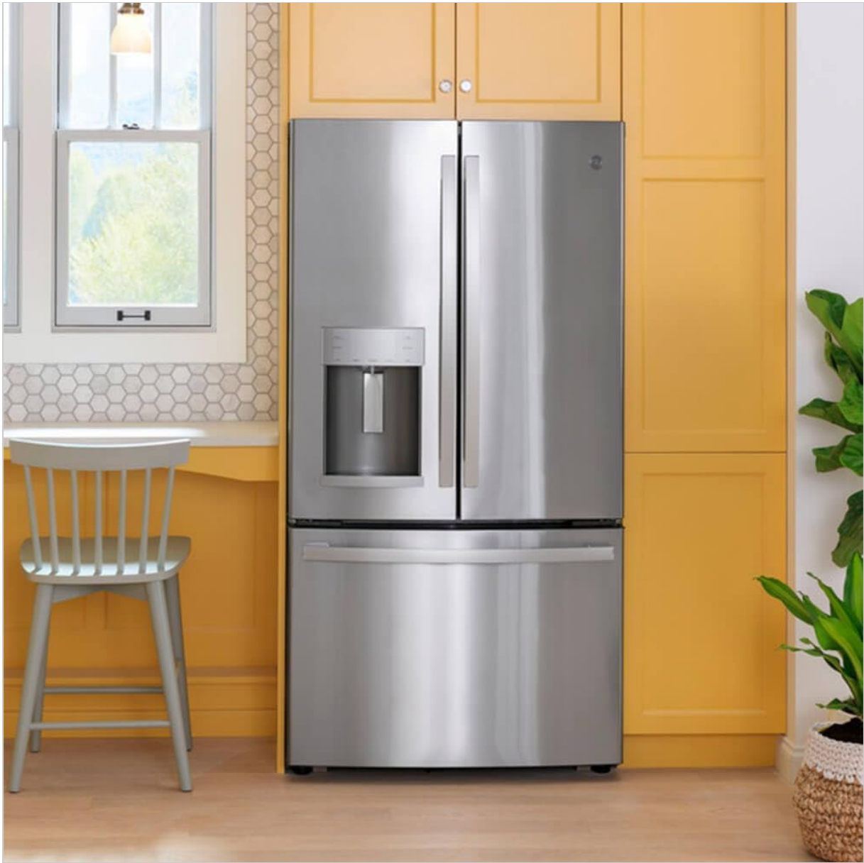
Figure 5: Freezer drawer with upper and lower storage.