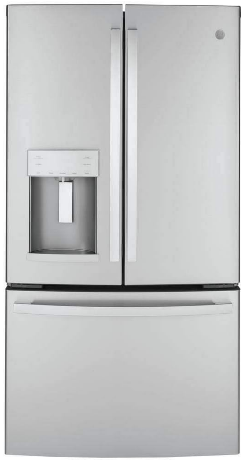
Figure 1: Front view of the GE GYE22GYNFS Refrigerator.