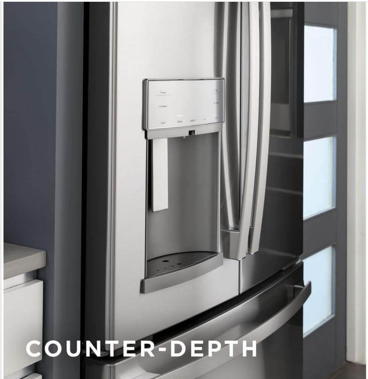
Figure 6: Fingerprint-resistant stainless steel finish.