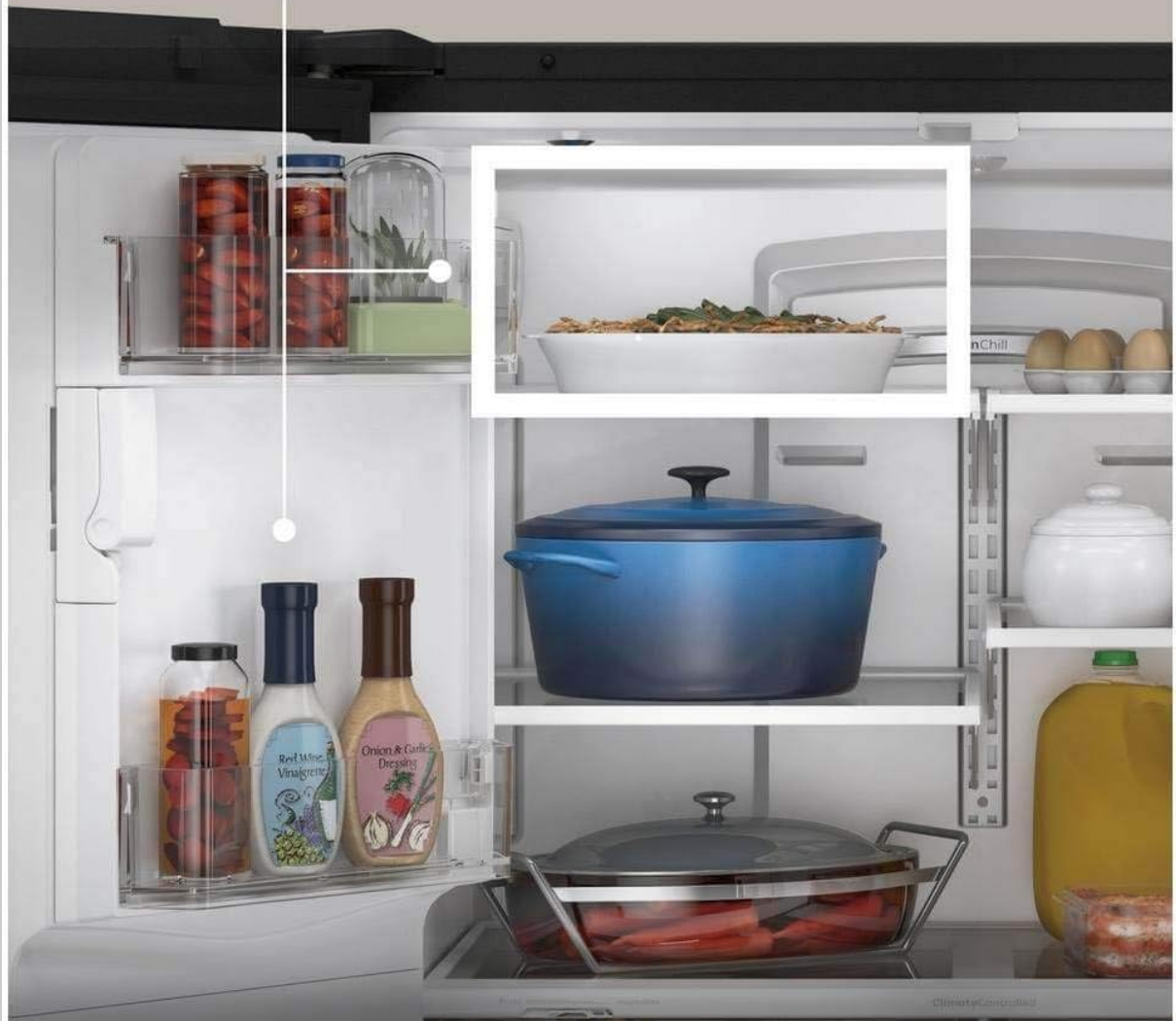
Figure 4: Interior of the fresh food compartment.