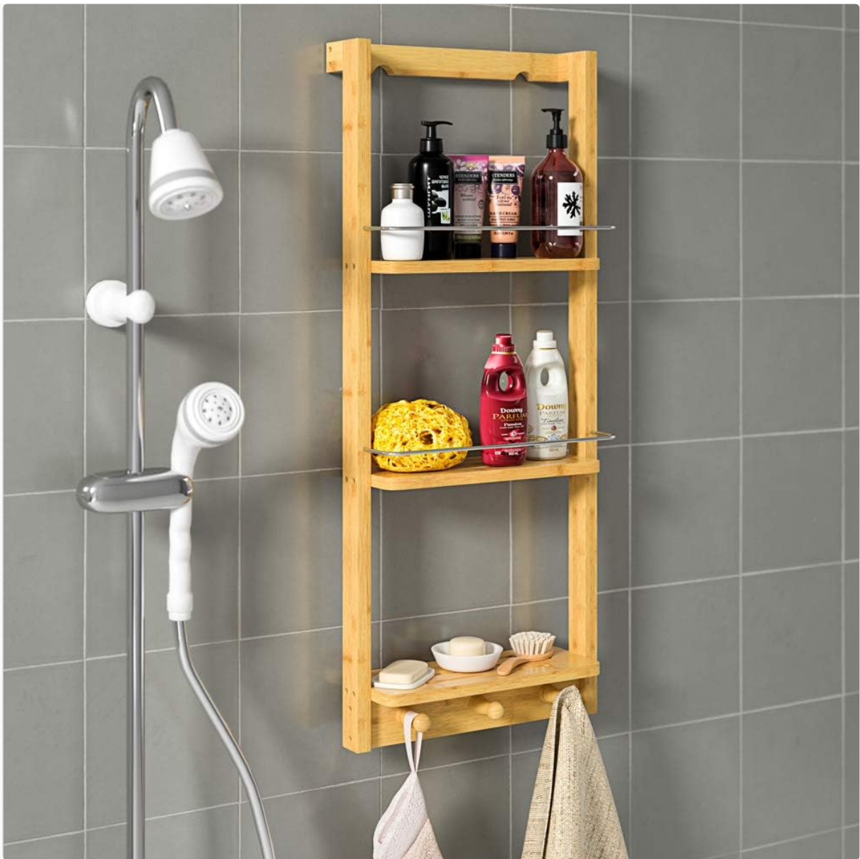
Image 1.1: The Casaria Bamboo Shower Shelf in use, showcasing its storage capacity and design.