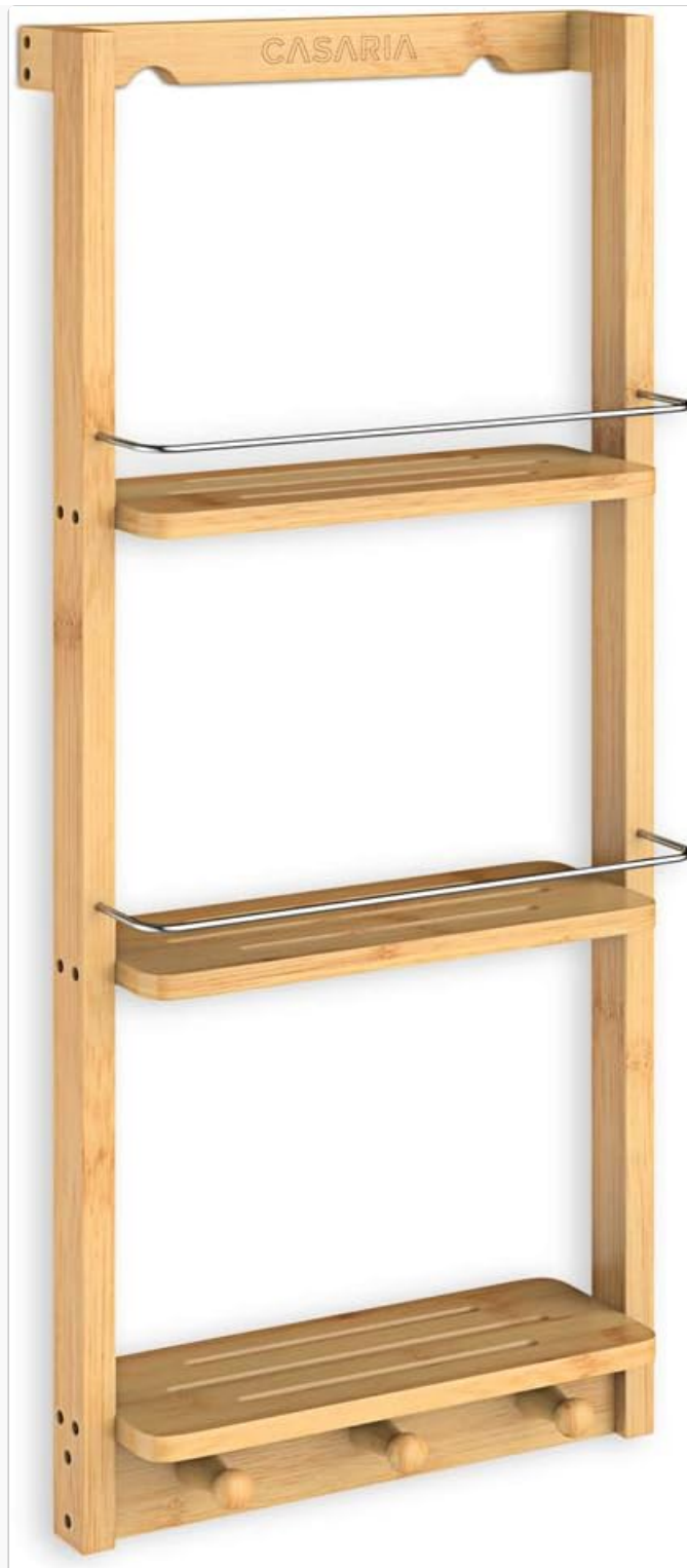
Image 2.1: Detail of the bottom shelf with hooks and mounting points.