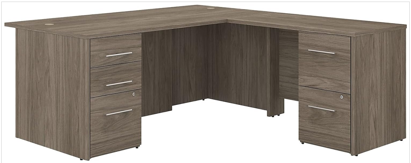
Image 1: Front view of the Bush Furniture Office 500 L-Shaped Desk in Modern Hickory finish, showcasing the overall design and integrated storage.