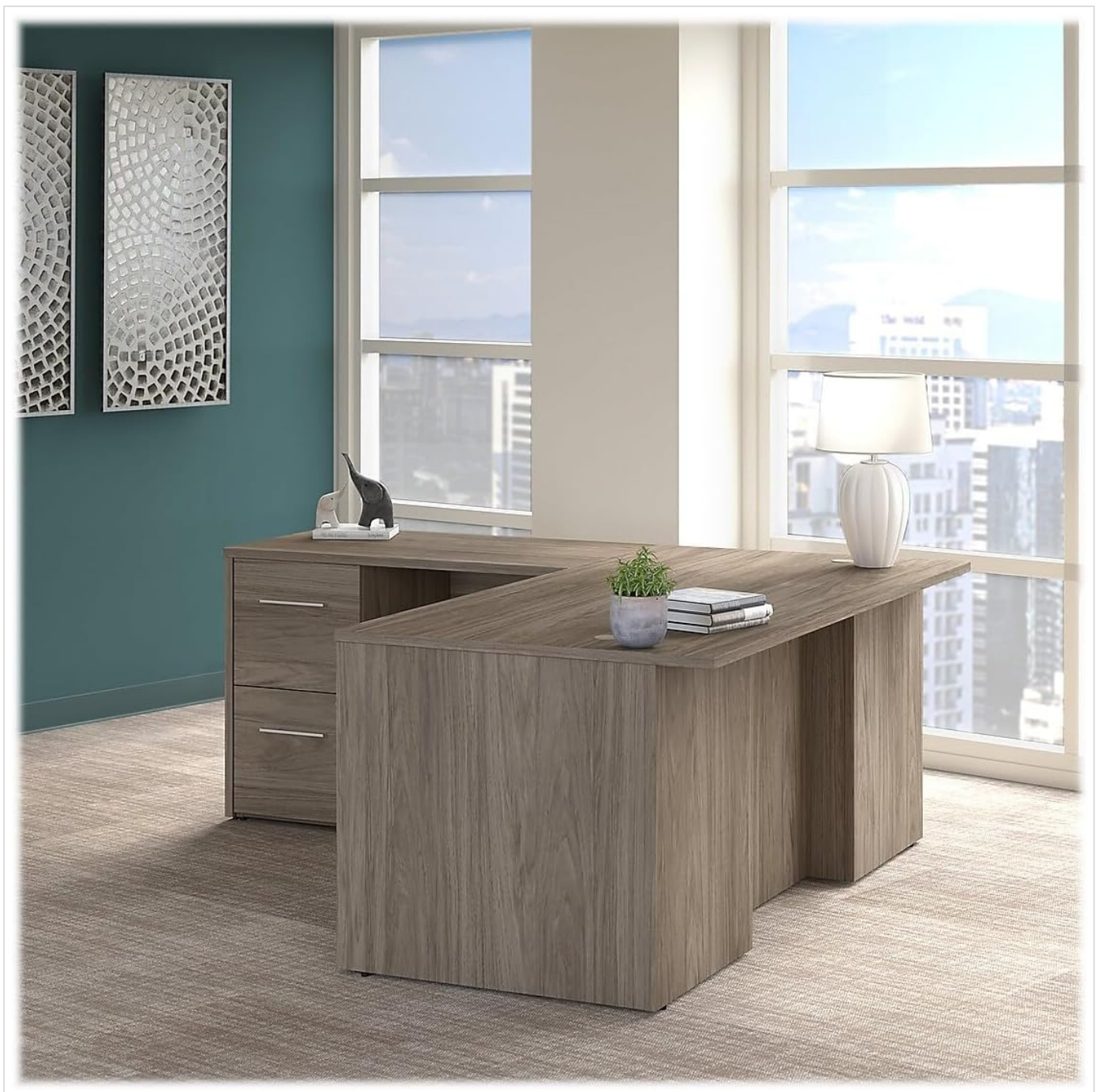
Image 2: The L-shaped desk situated in a contemporary office environment, demonstrating its functional and aesthetic integration into a workspace.