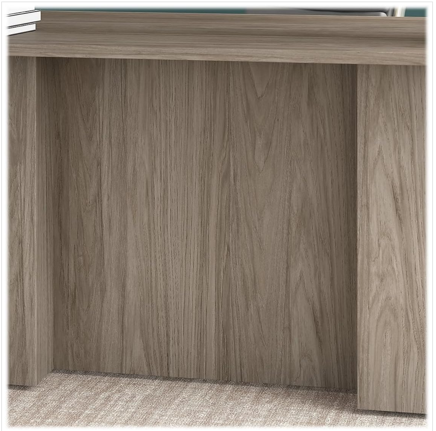
Image 3: Side profile of the L-shaped desk, providing a view of its depth and the sturdy construction of the side panels.