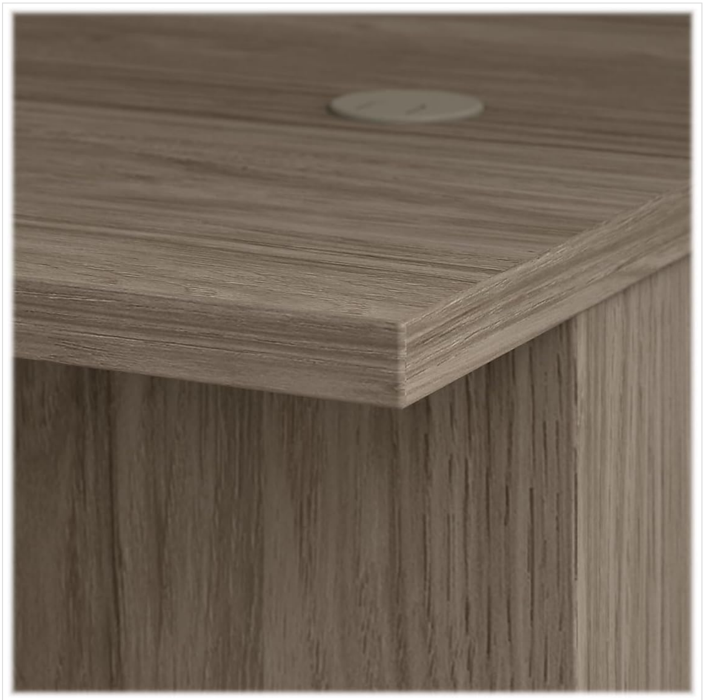
Figure 2: Wire Management Grommet. A close-up of the circular wire management grommet on the desk surface, designed to route cables neatly.