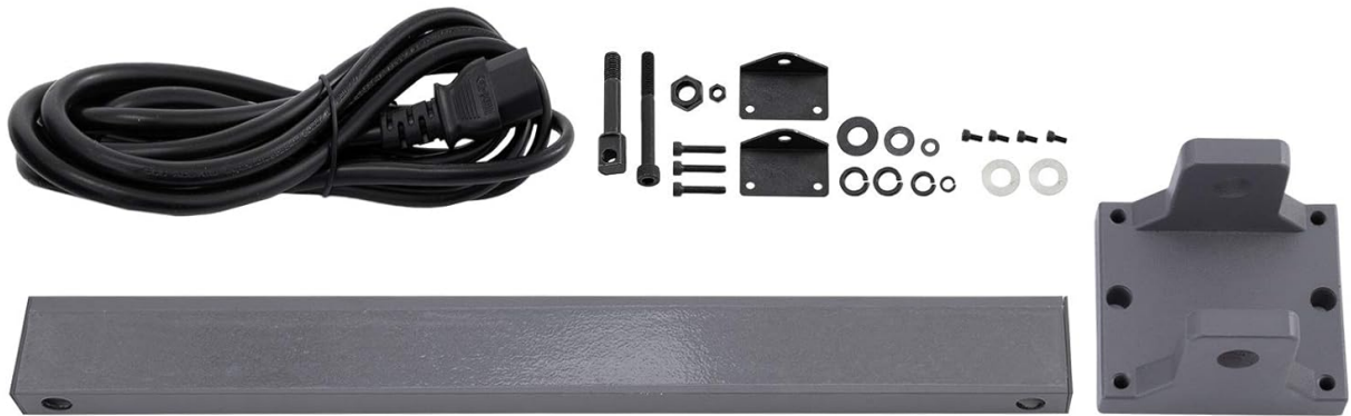
Figure 3.1: Overview of the VEVOR 2-Axis DRO system and its included accessories.