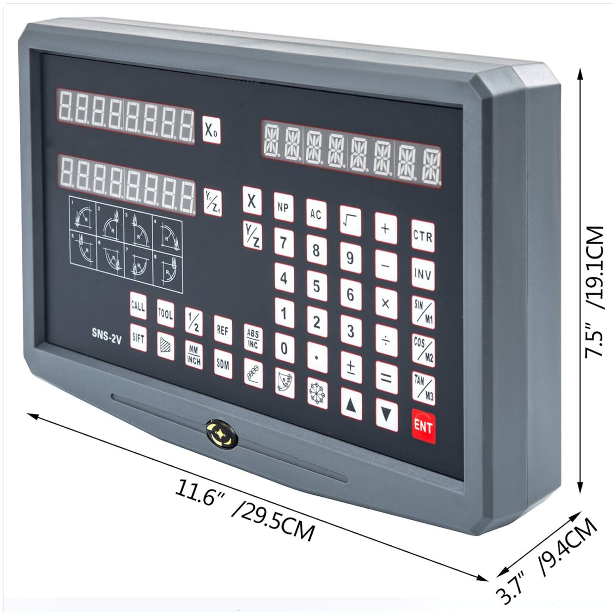
Figure 4.1: Dimensions of the DRO display unit for mounting reference.