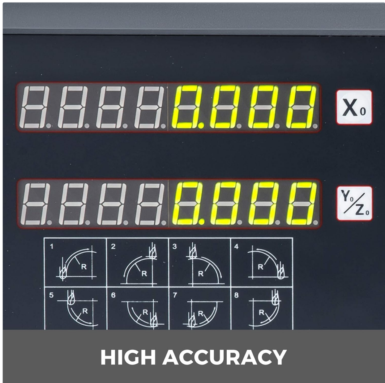
Figure 5.1: High accuracy digital display of axis positions.