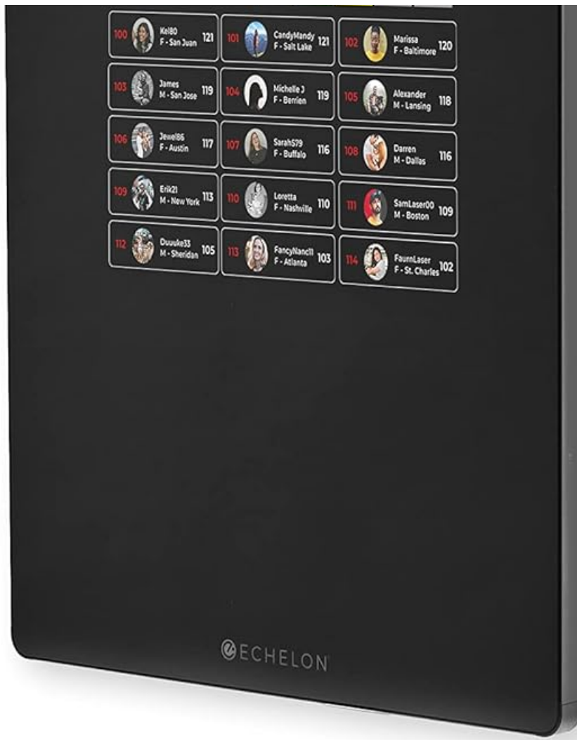
The Echelon Reflect Smart Connect Fitness Mirror in operation, showing a fitness class on its display.