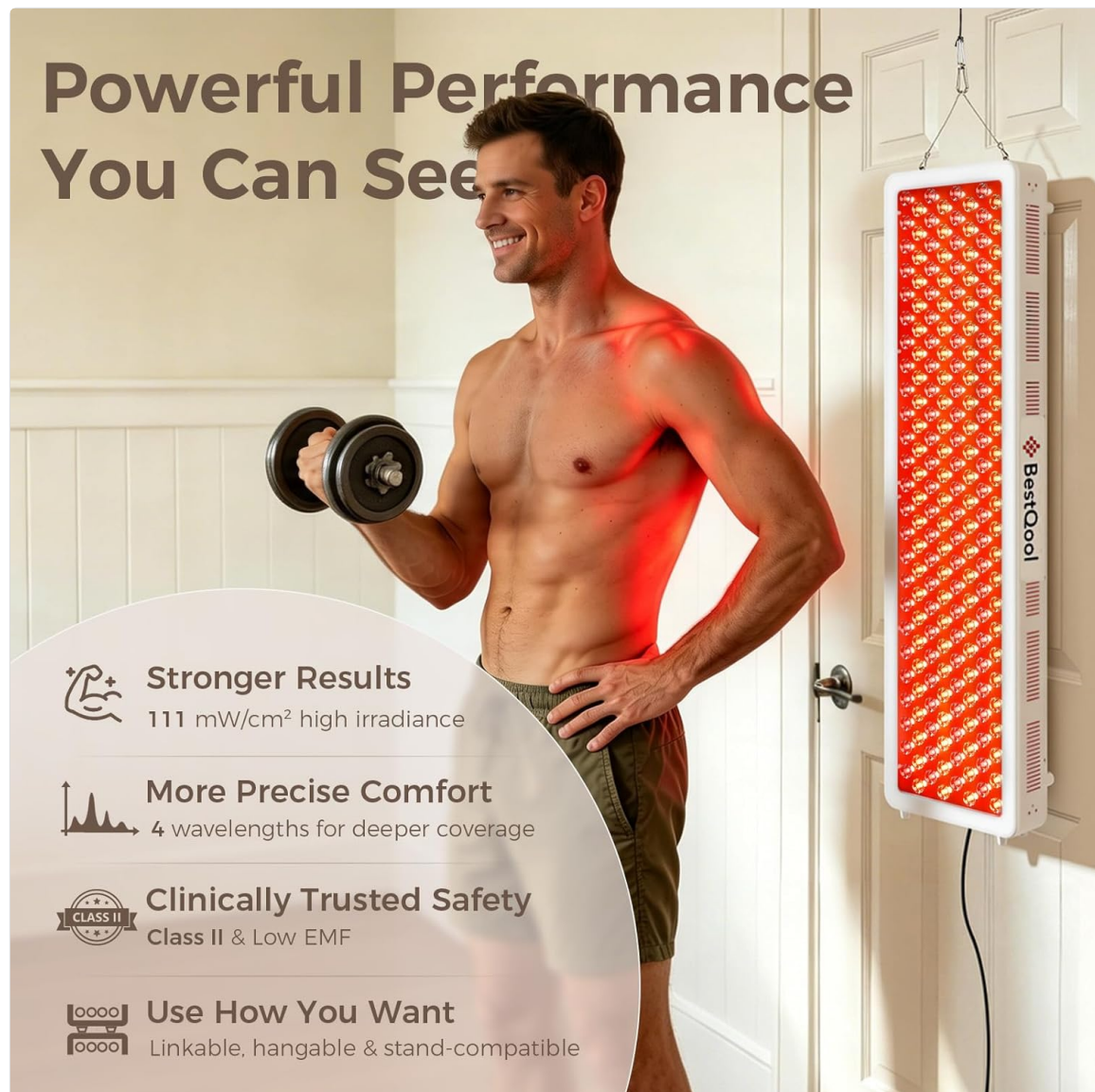
Image: The BestQool Pro200 device shown hanging on a door, illustrating a common setup method.