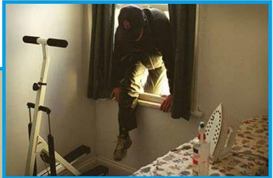
Figure 5: Constant Alarm Mode for intruder deterrence.