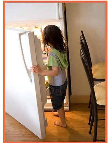
Figure 6: Time Delay Mode for various uses.