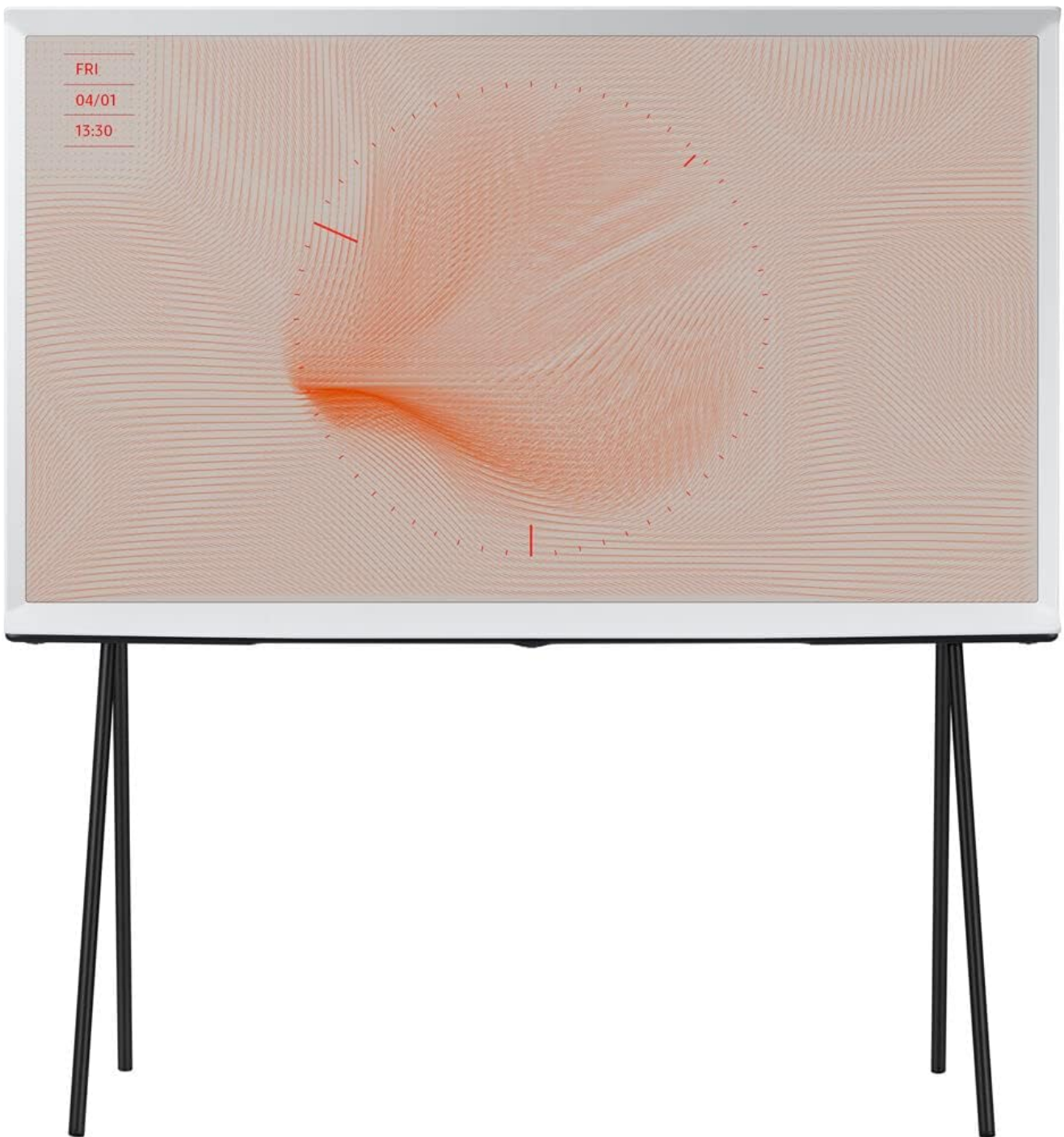
The Samsung Serif QLED TV, showcasing its unique design and integration into a modern living space.